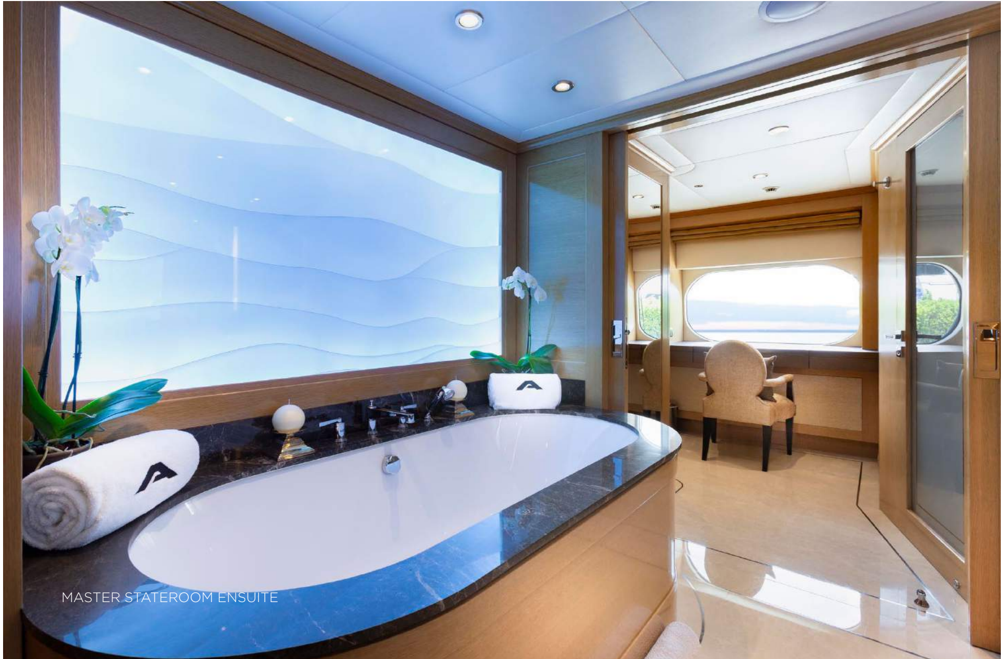
MASTER STATEROOM ENSUITE