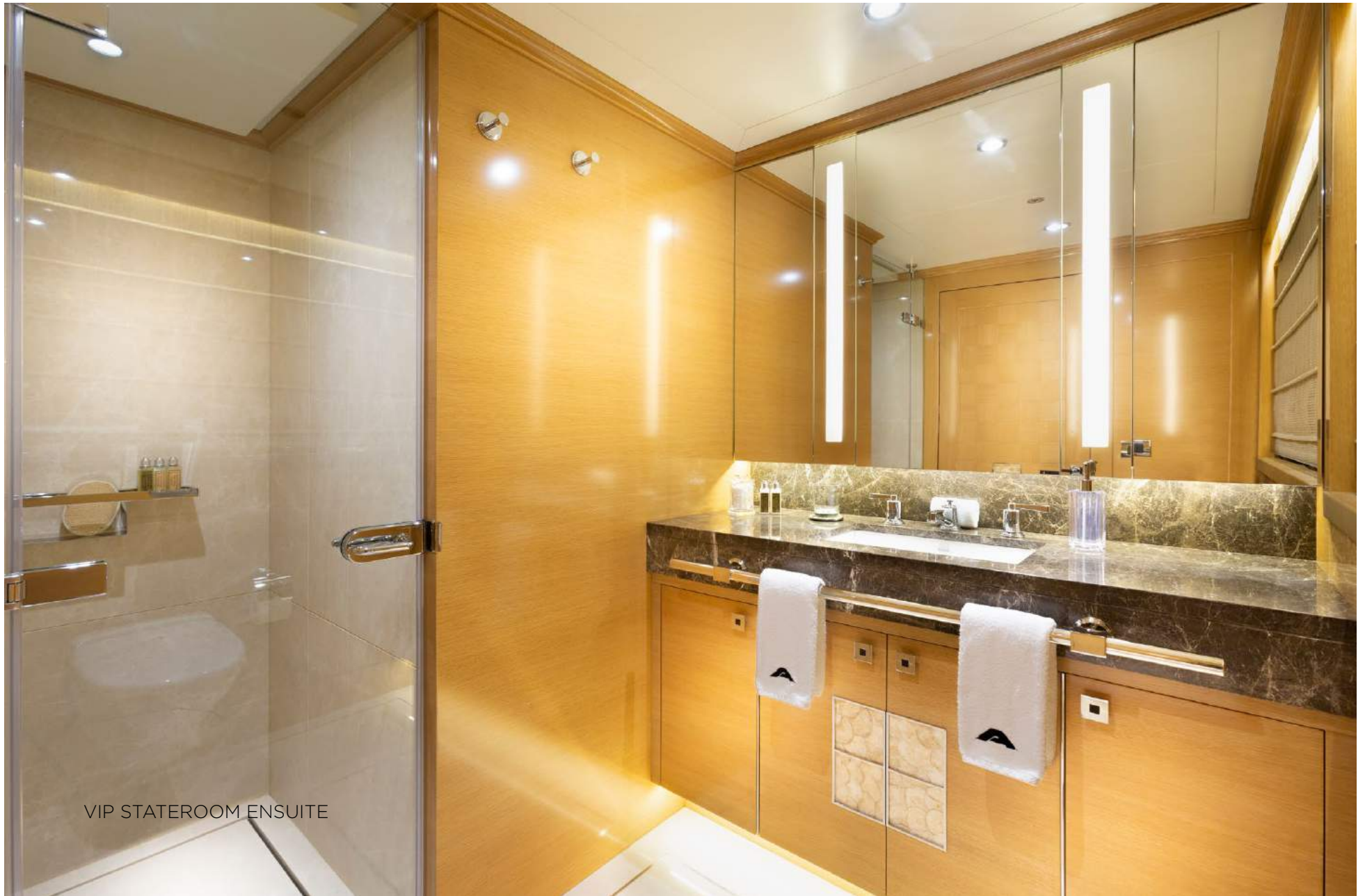
VIP STATEROOM ENSUITE