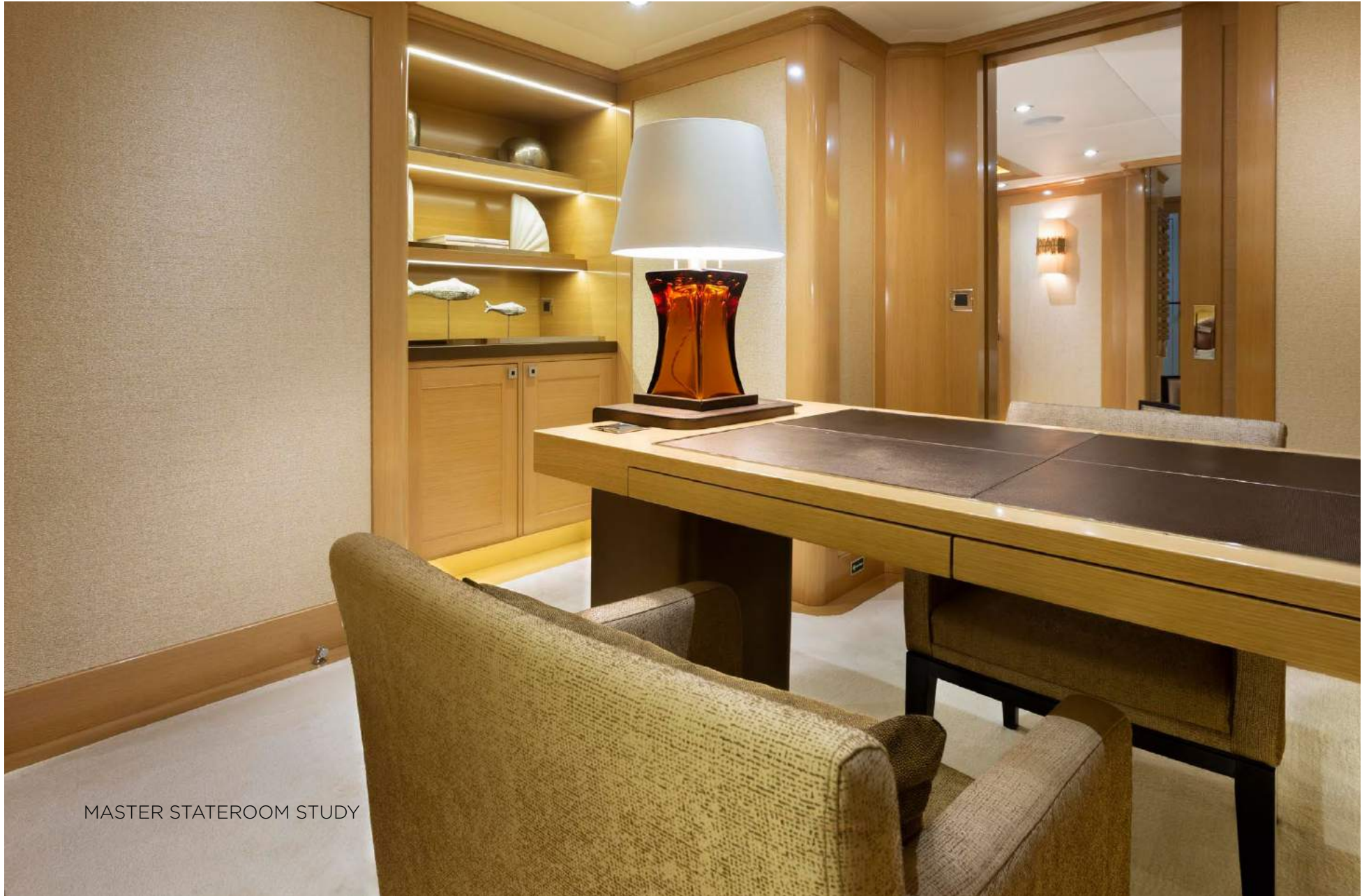
MASTER STATEROOM STUDY