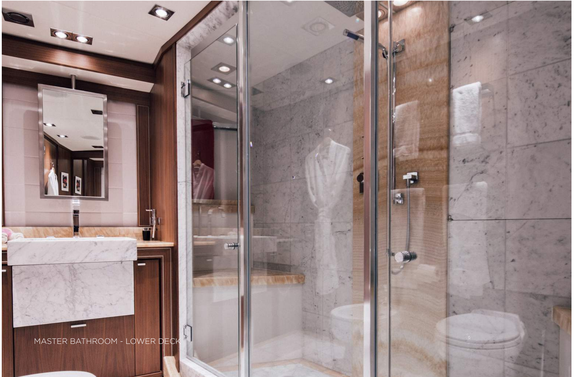
MASTER BATHROOM - LOWER DECK