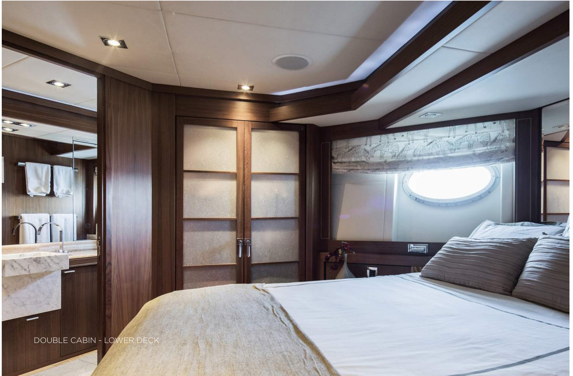
DOUBLE CABIN - LOWER DECK