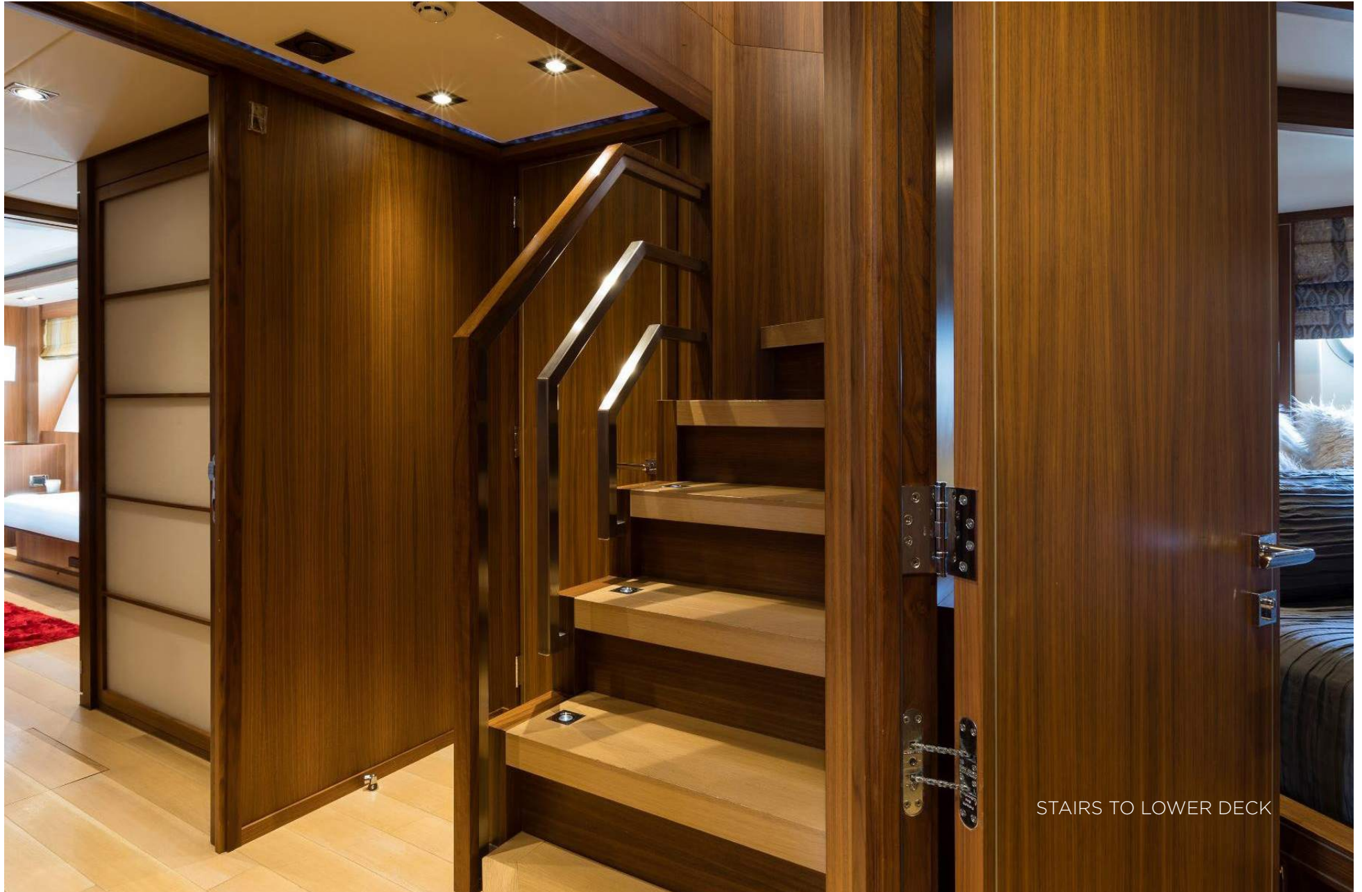
STAIRS TO LOWER DECK