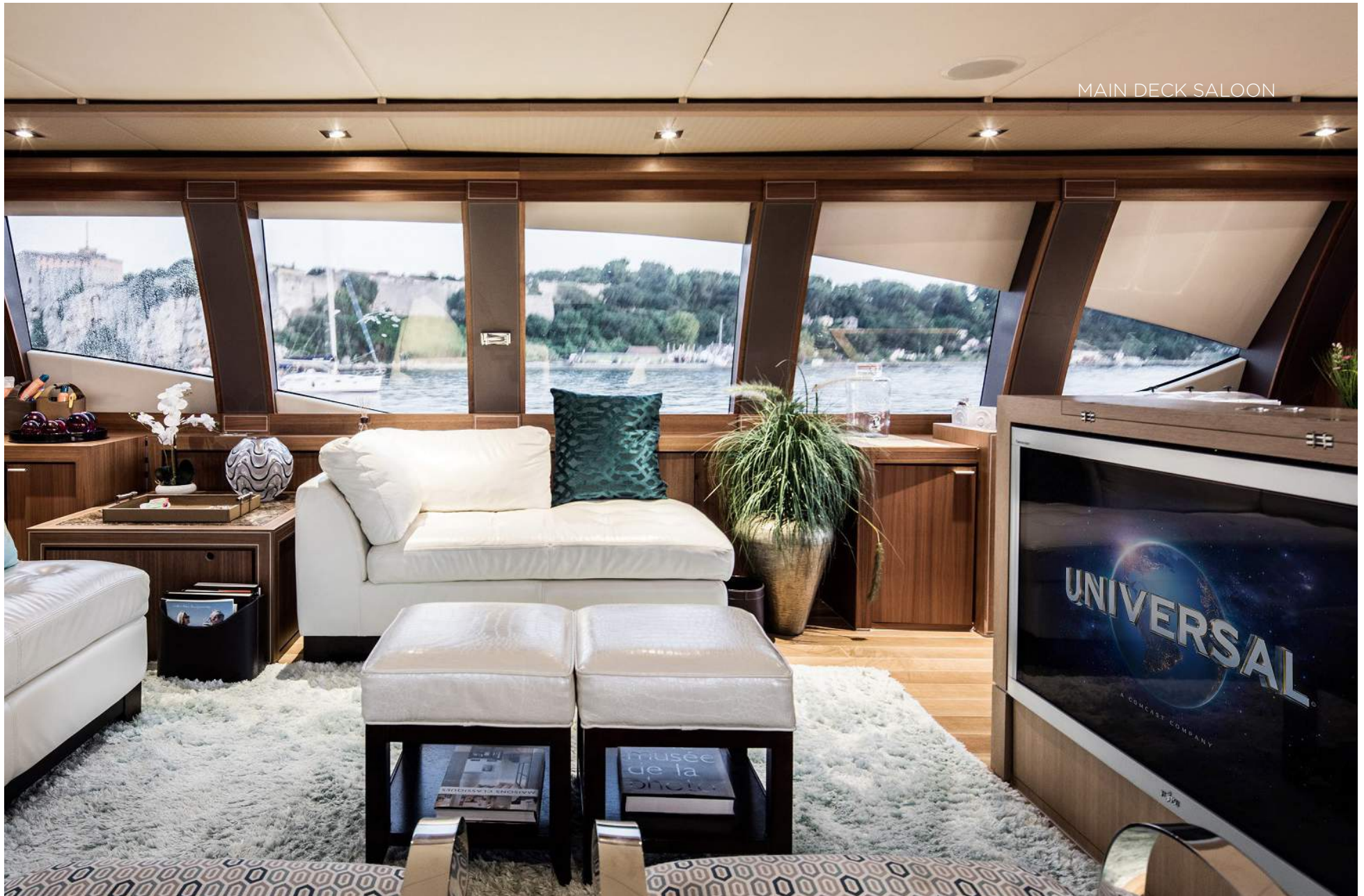
MAIN DECK SALOON