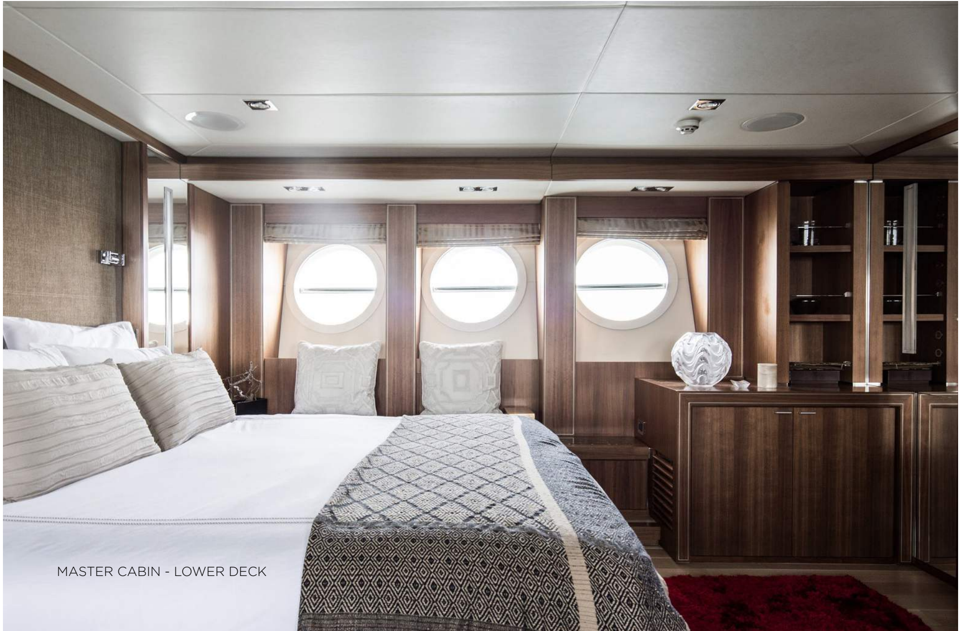
MASTER CABIN - LOWER DECK