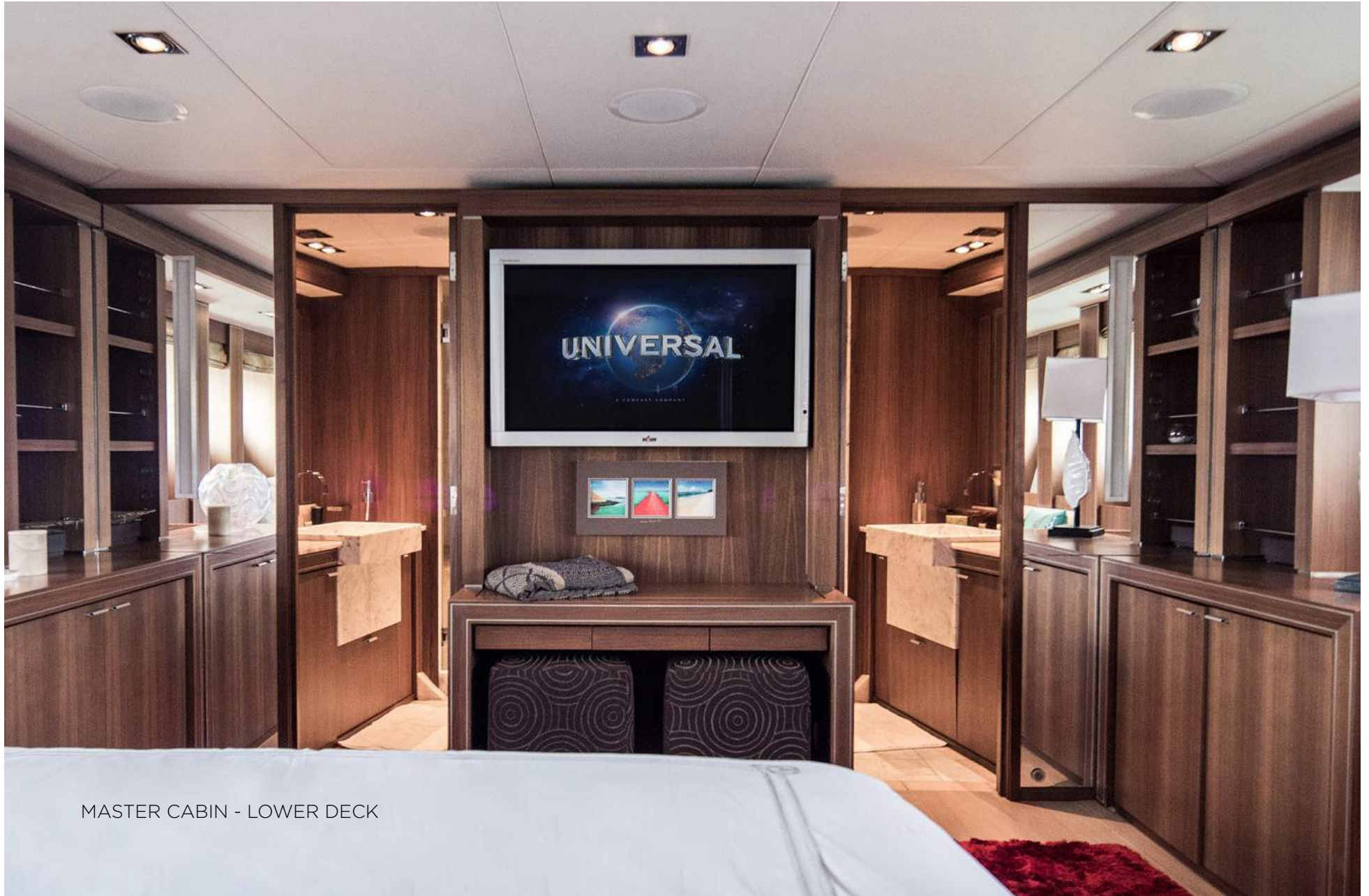
MASTER CABIN - LOWER DECK