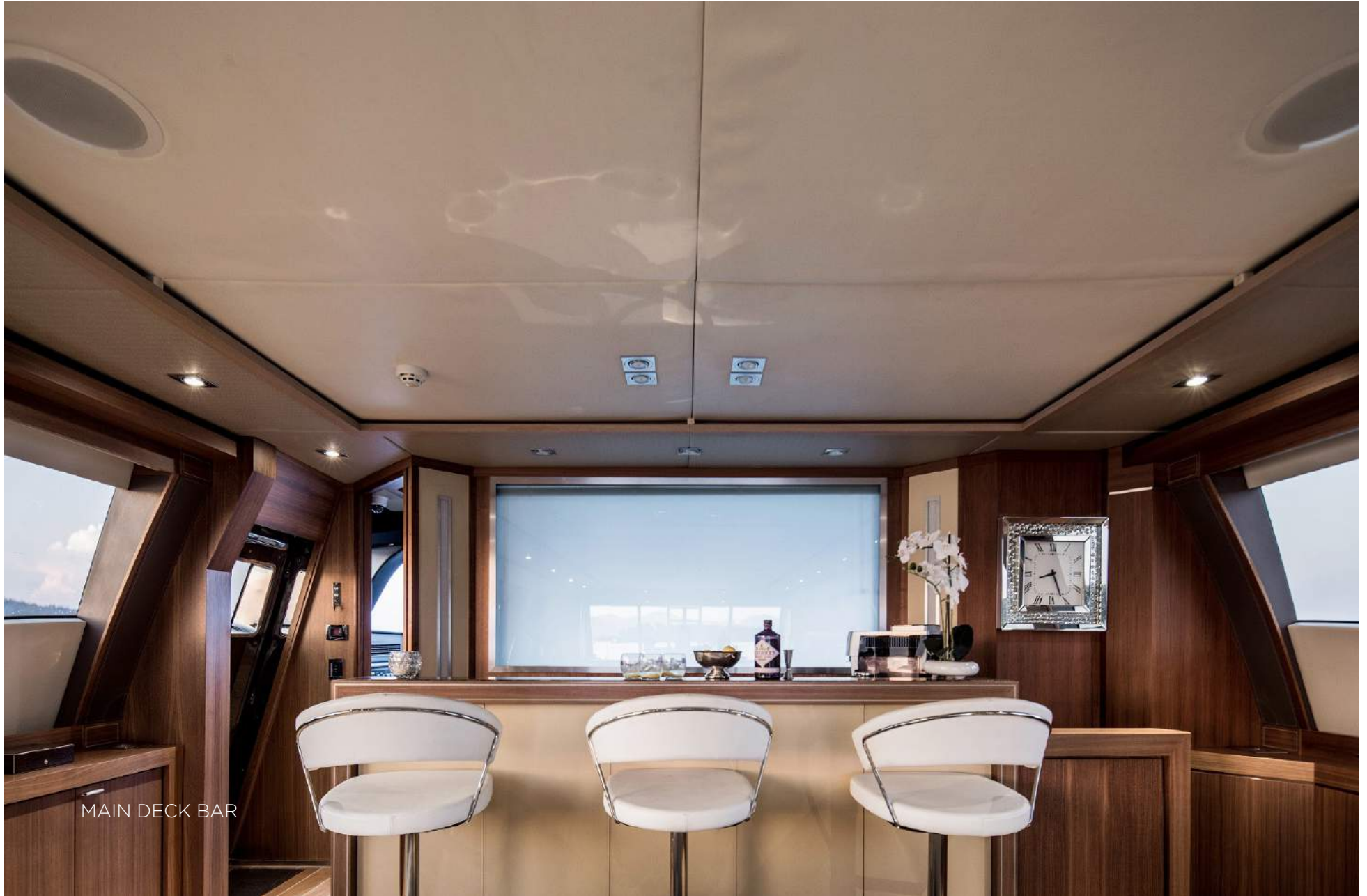
MAIN DECK BAR