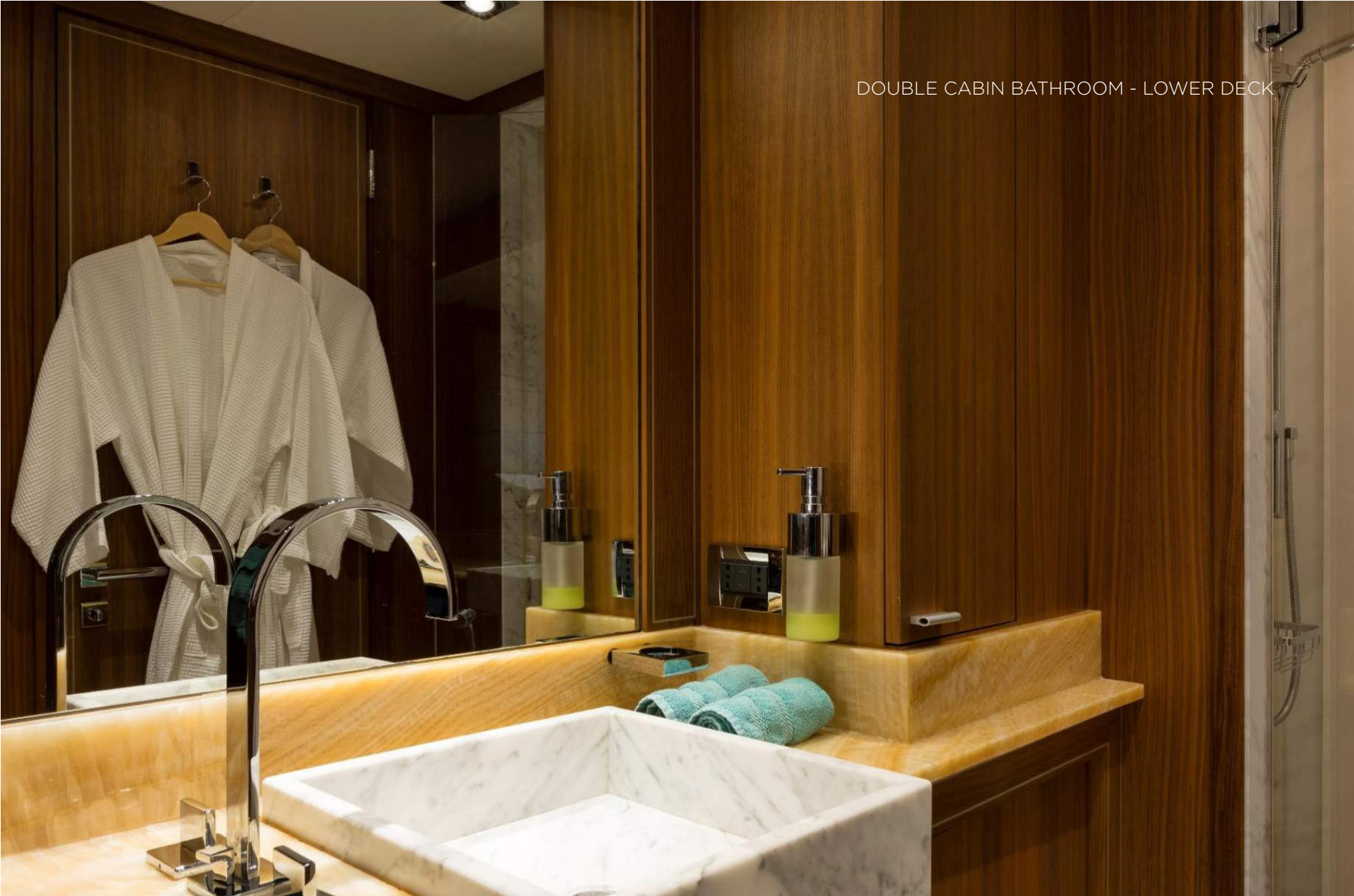
DOUBLE CABIN BATHROOM - LOWER DECK