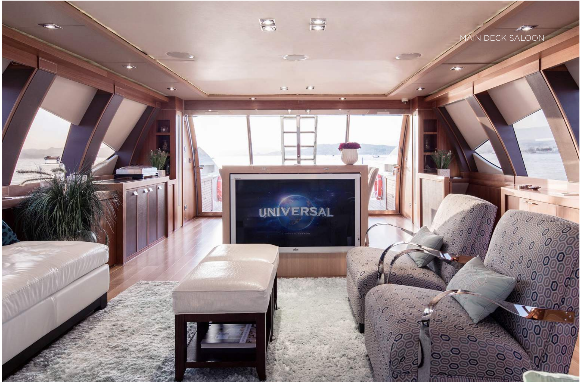
MAIN DECK SALOON