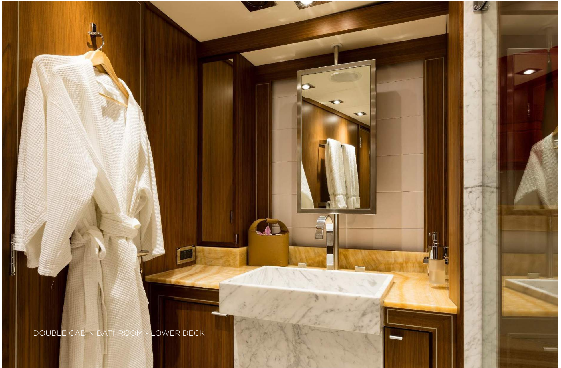
DOUBLE CABIN BATHROOM - LOWER DECK