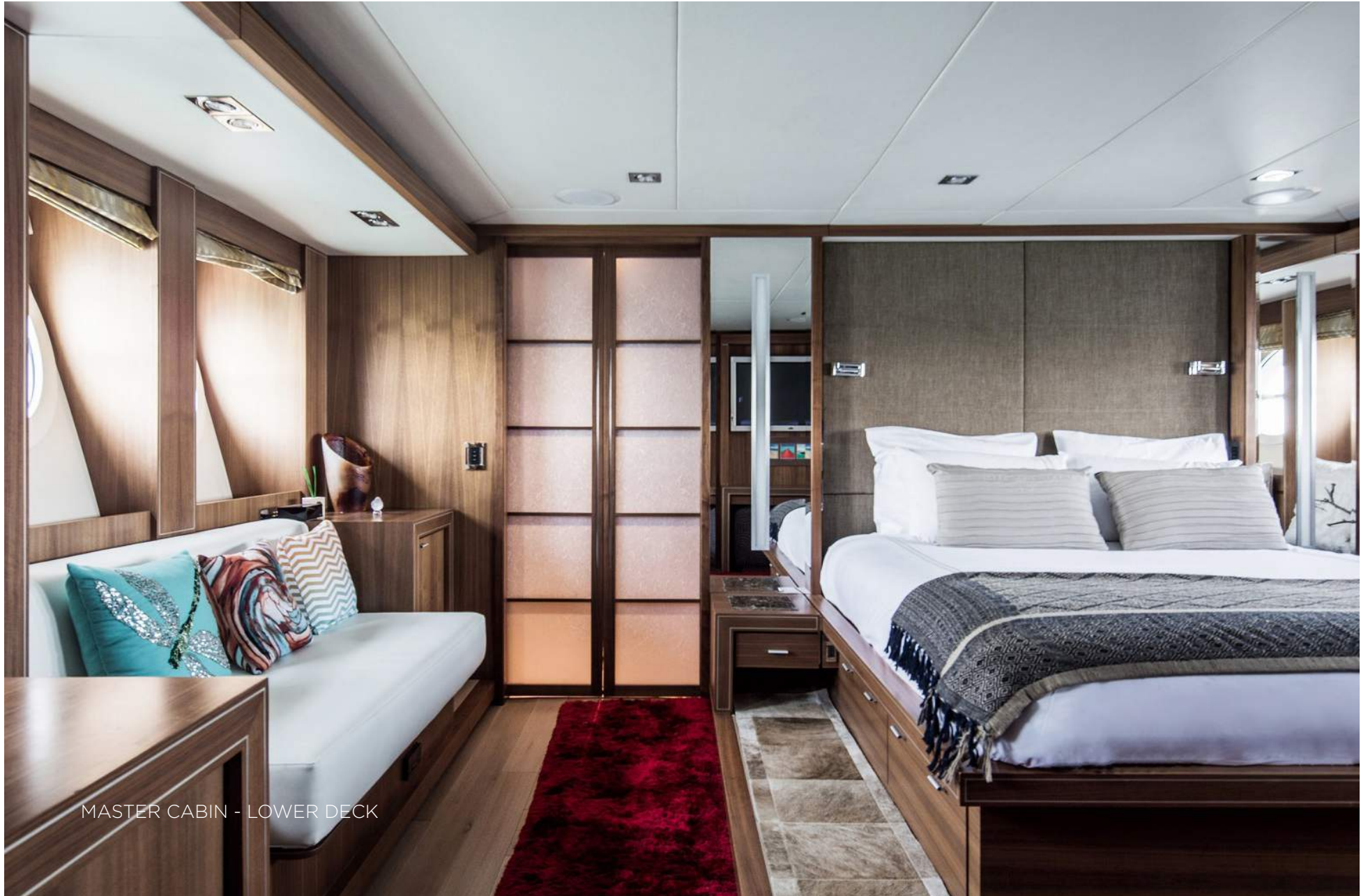
MASTER CABIN - LOWER DECK