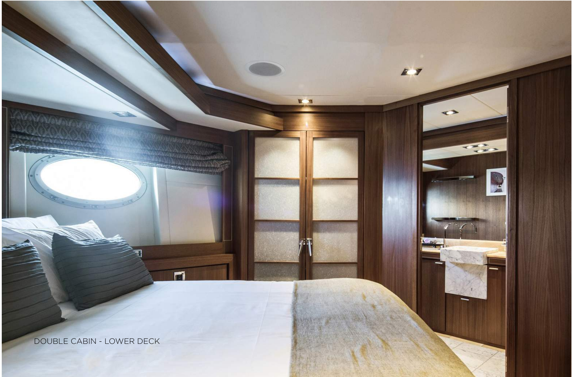
DOUBLE CABIN - LOWER DECK