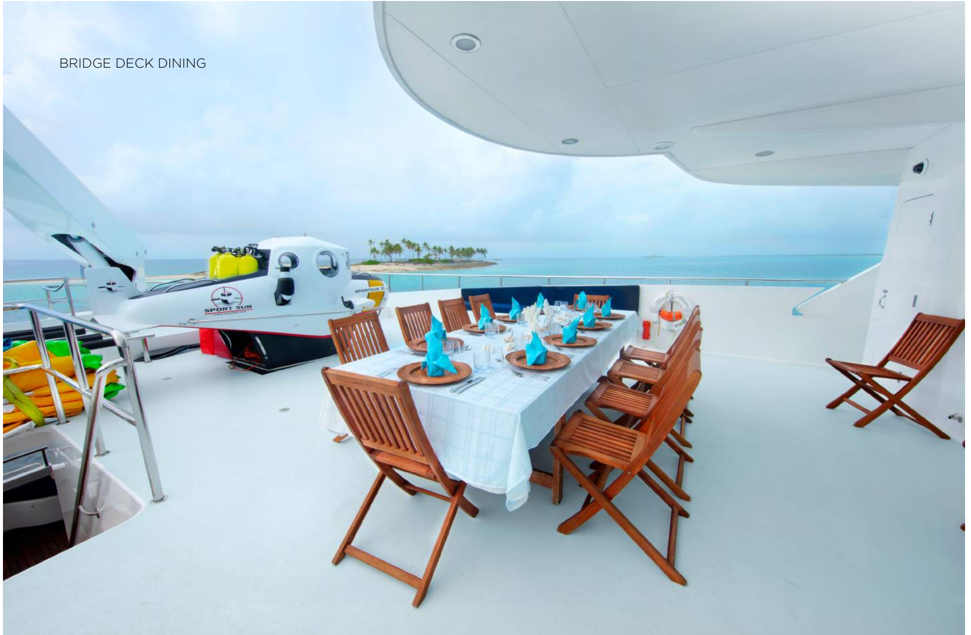
BRIDGE DECK DINING