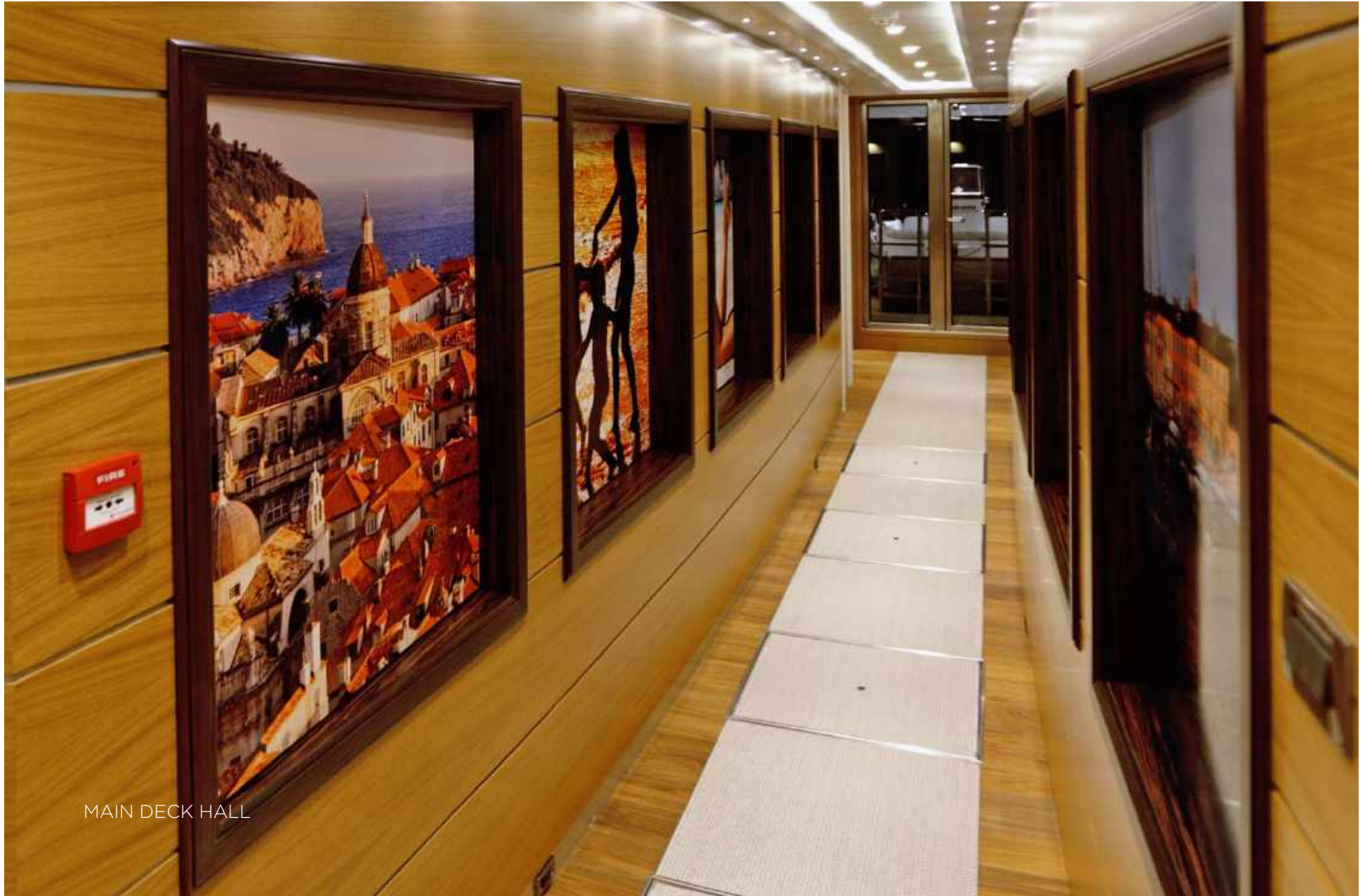
MAIN DECK HALL