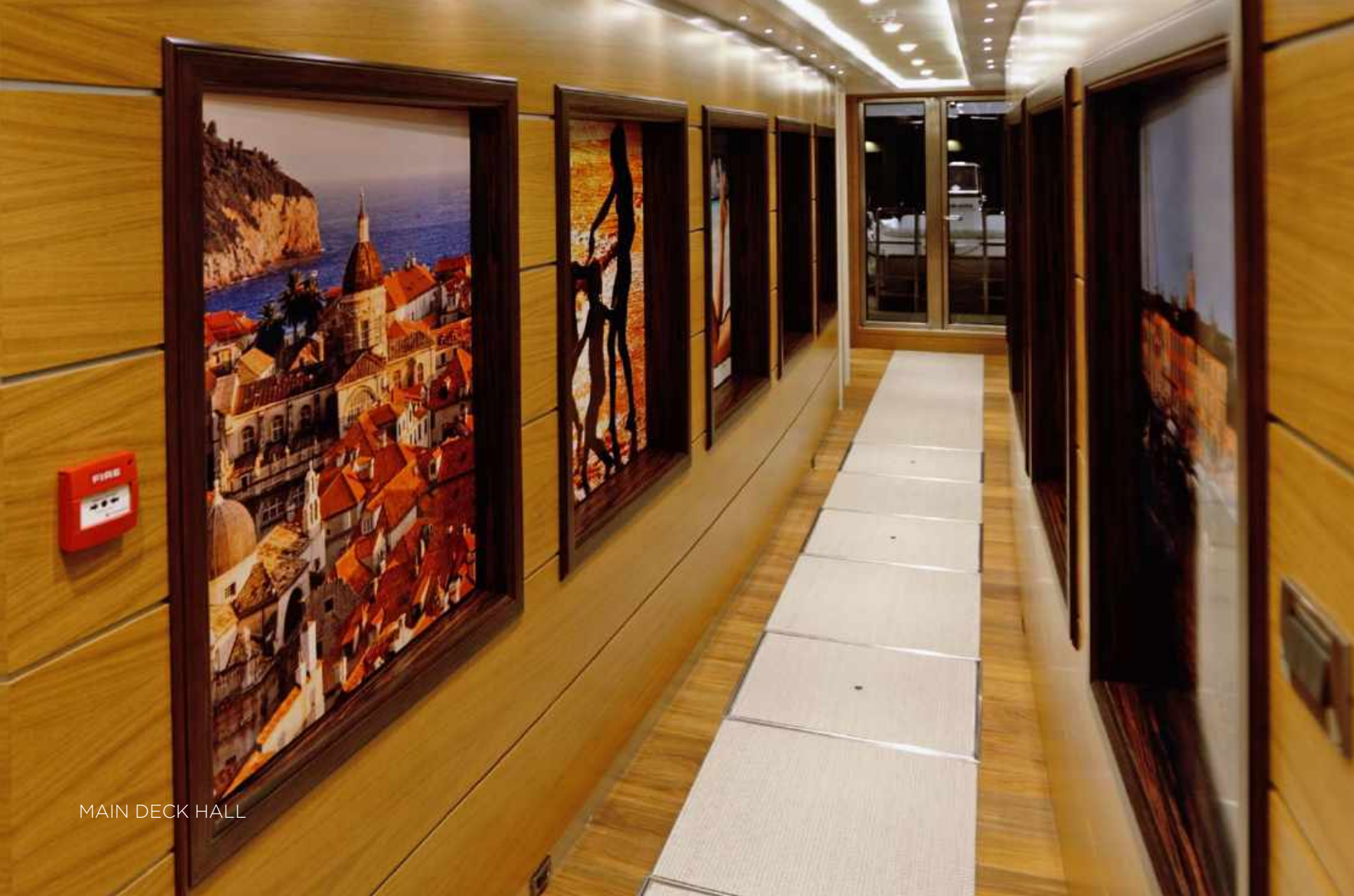
MAIN DECK HALL