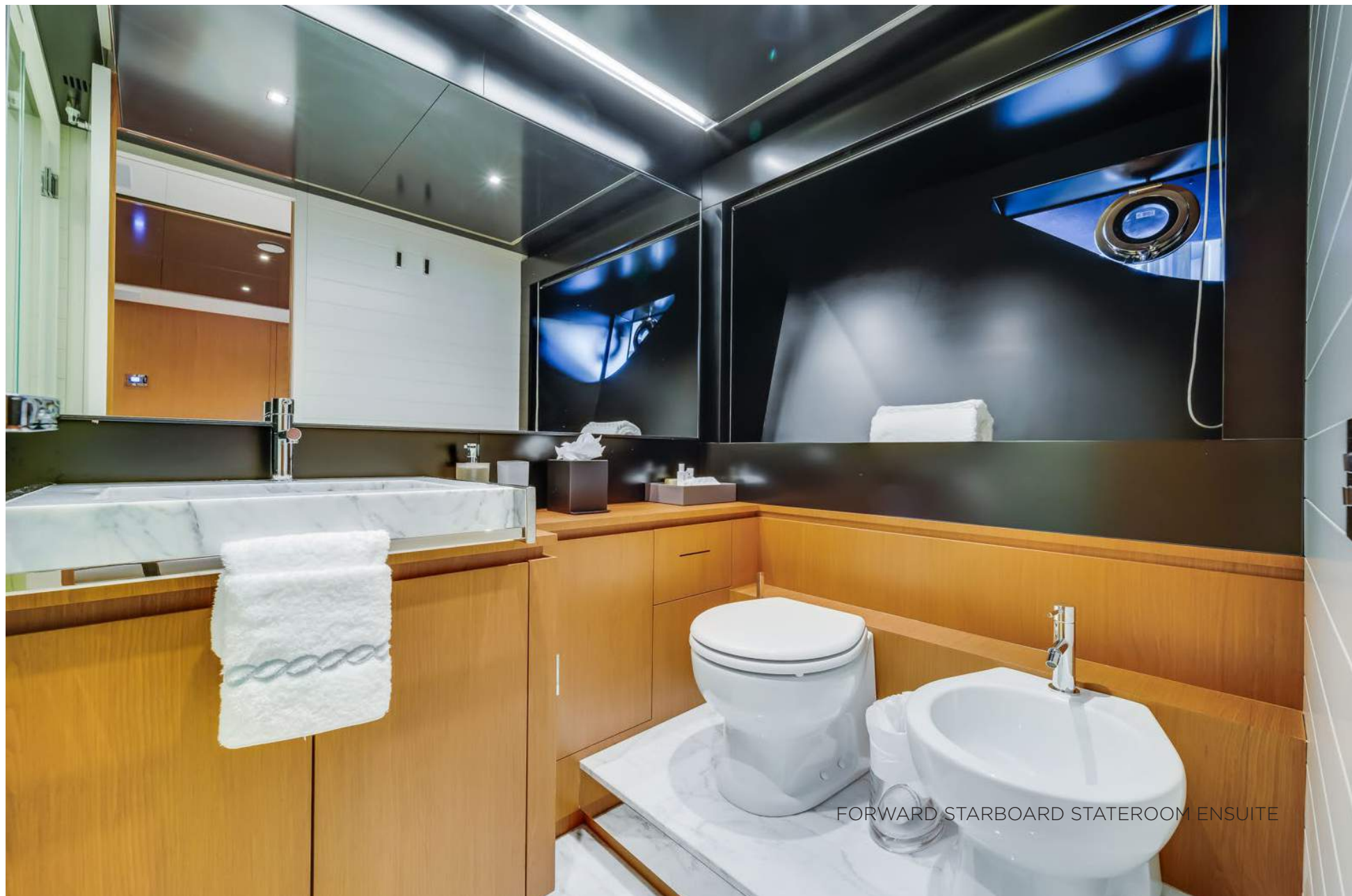
FORWARD STARBOARD STATEROOM ENSUITE