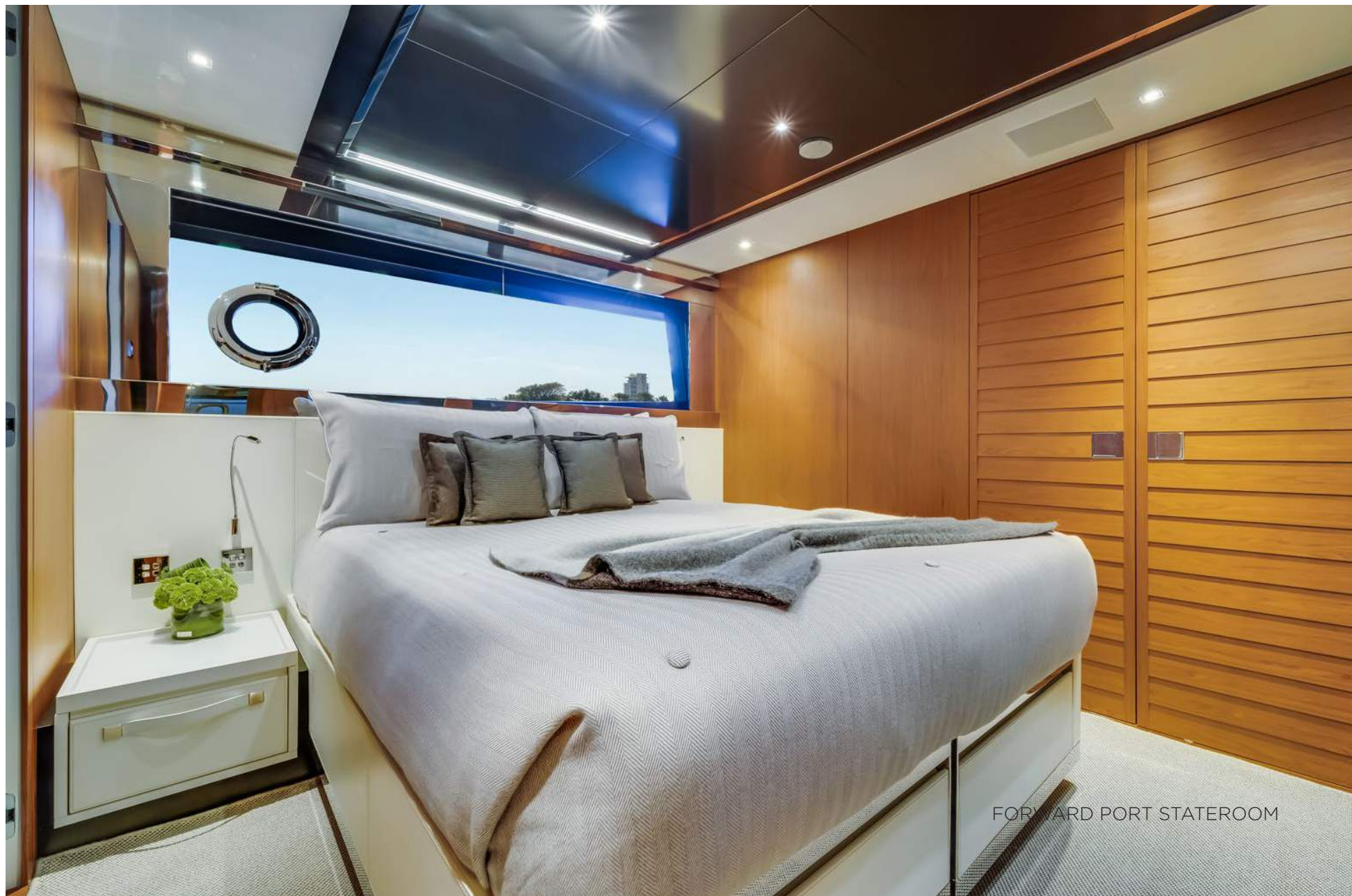
FORWARD PORT STATEROOM