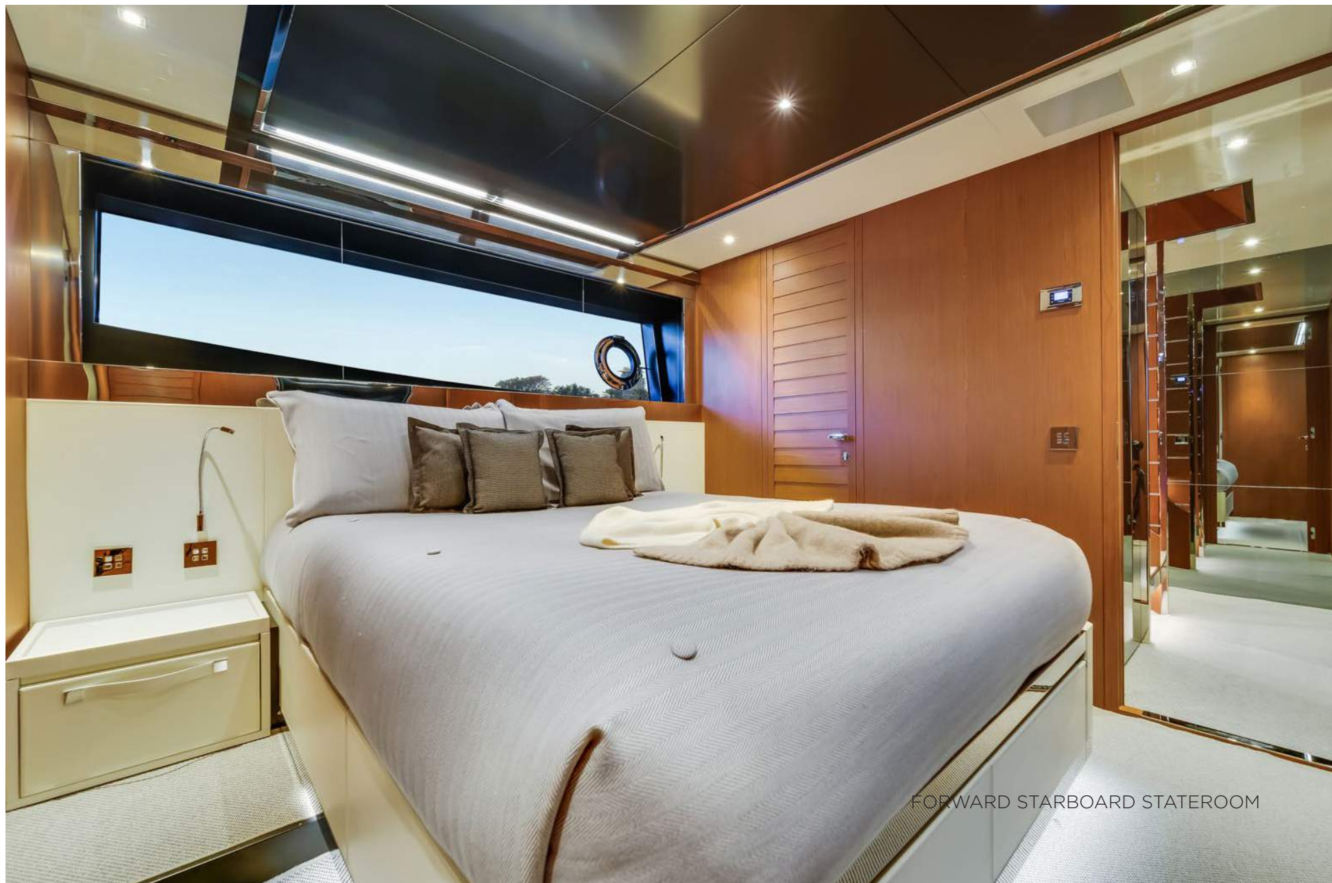
FORWARD STARBOARD STATEROOM