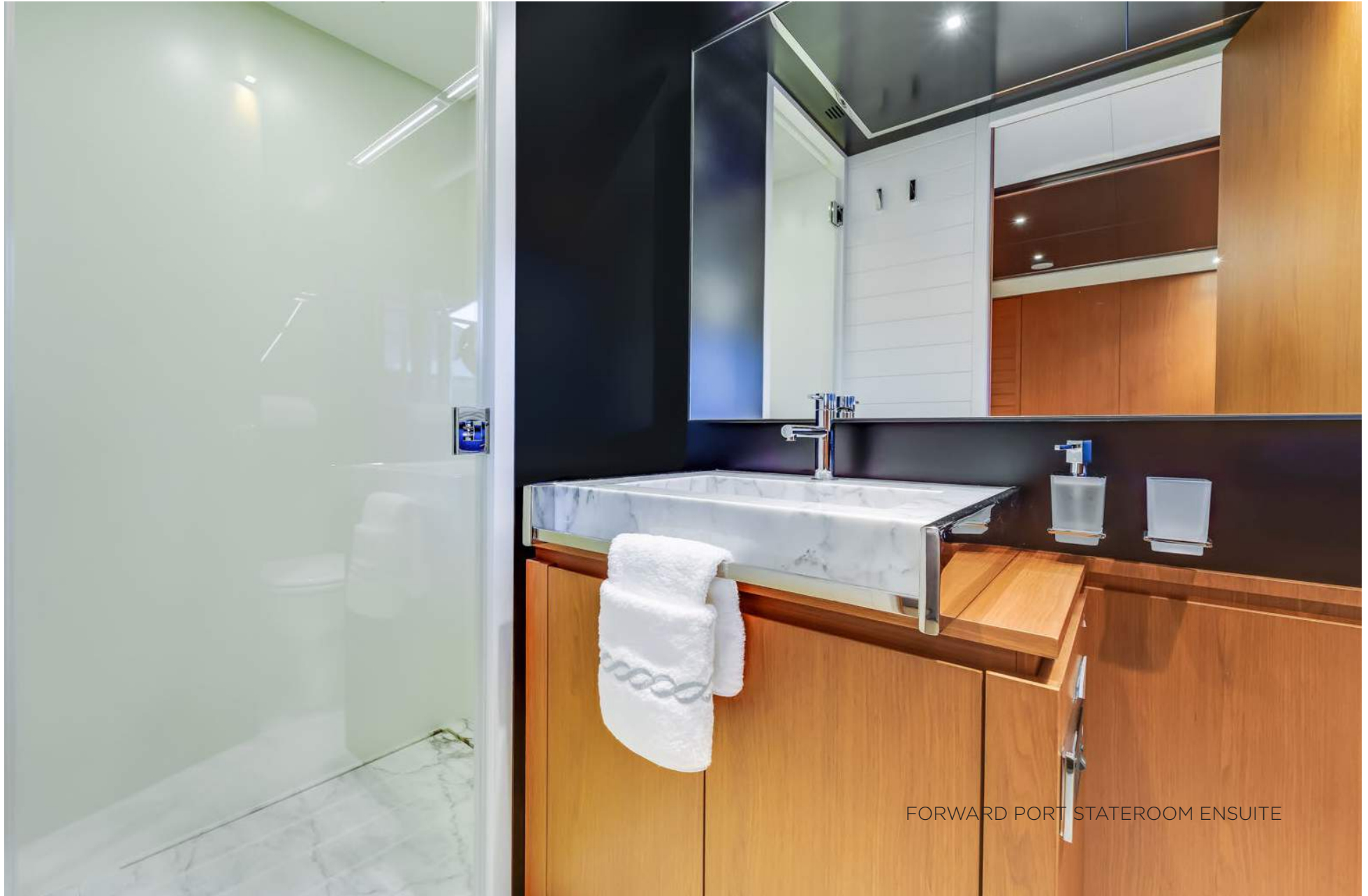
FORWARD PORT STATEROOM ENSUITE