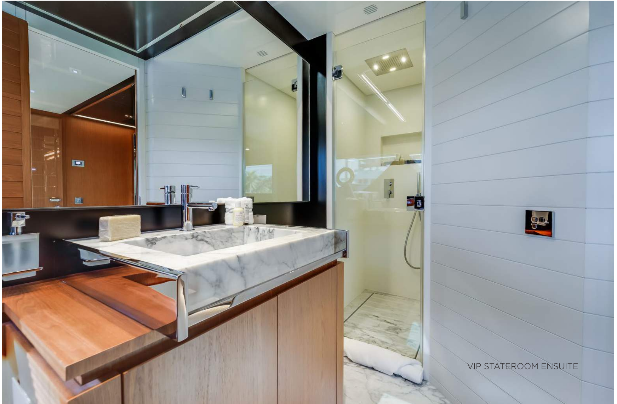
VIP STATEROOM ENSUITE