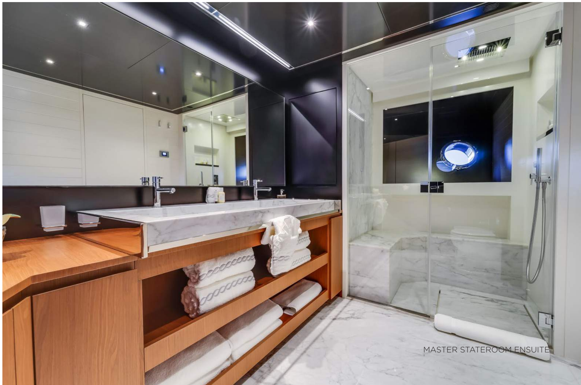
MASTER STATEROOM ENSUITE