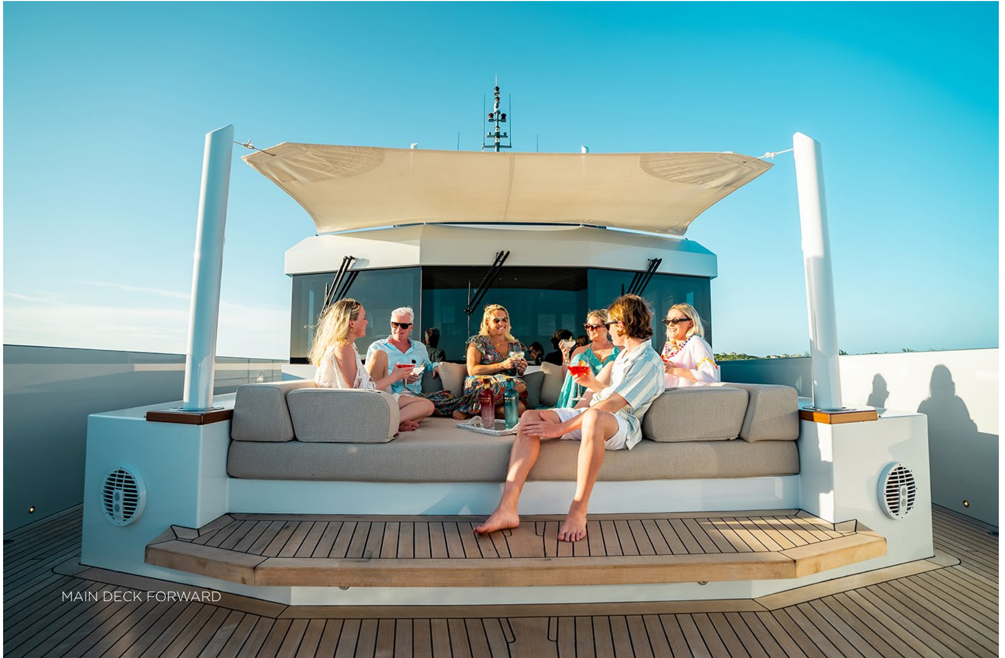
MAIN DECK FORWARD