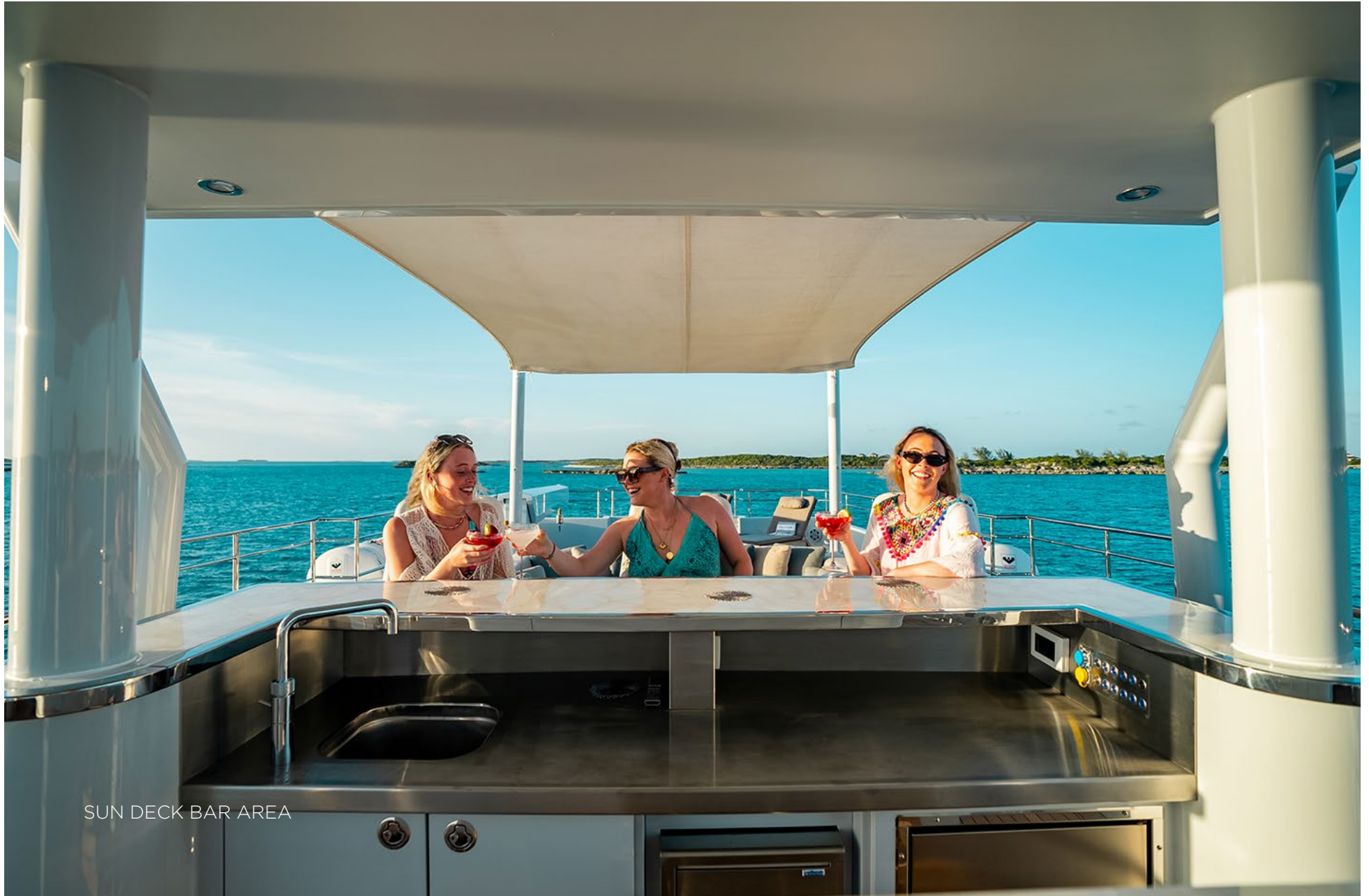
SUN DECK BAR AREA