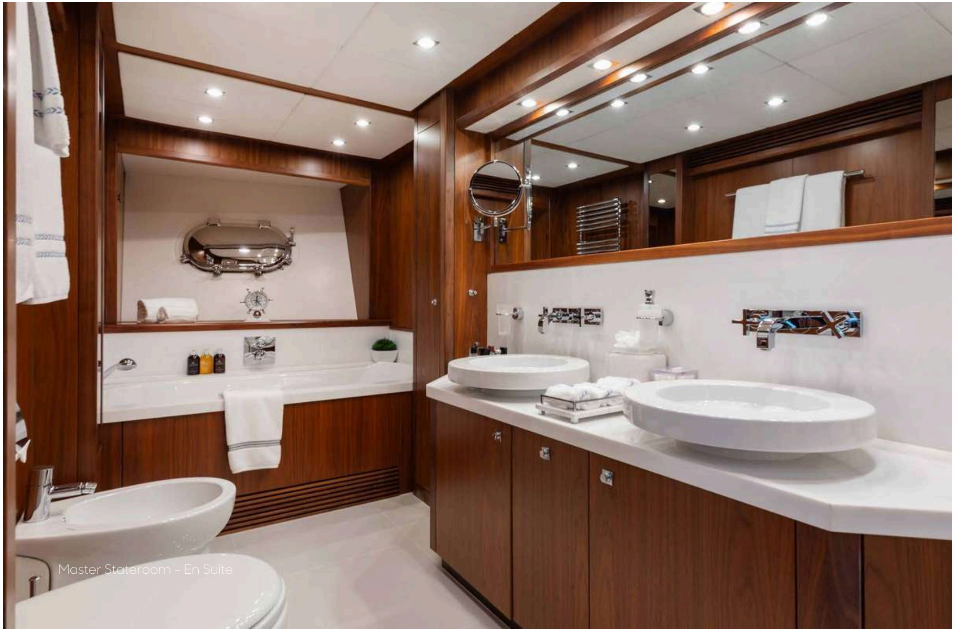
Master Stateroom - En Suite