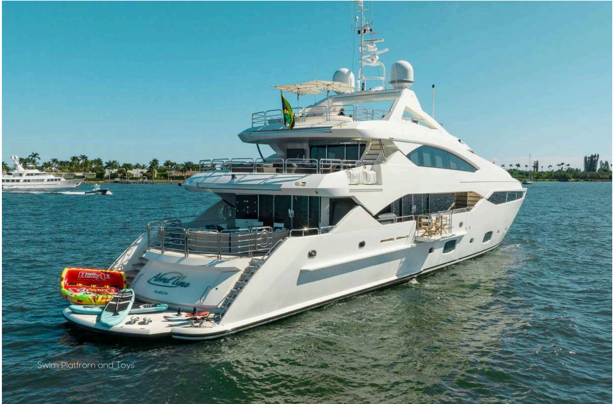
Swim Platform and Toys