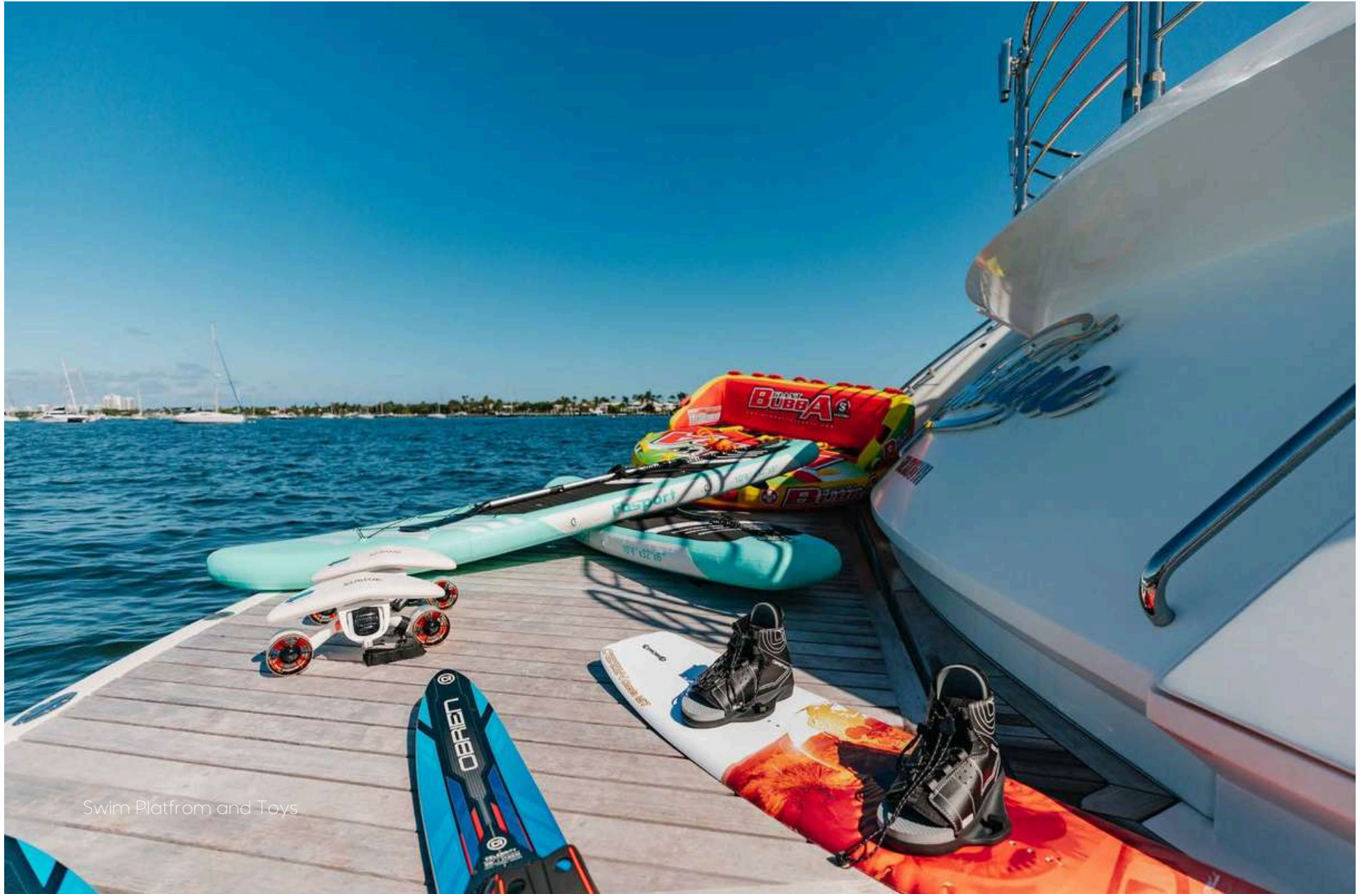
Swim Platform and Toys