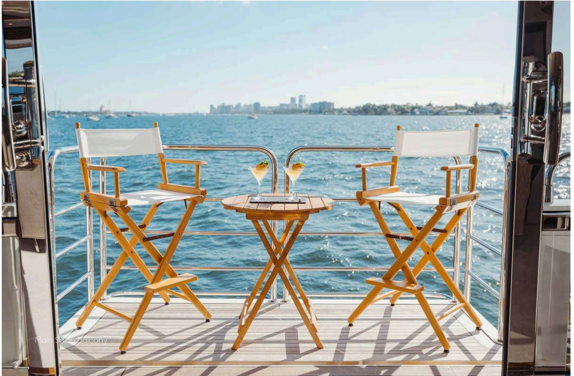
Main Salon Balcony