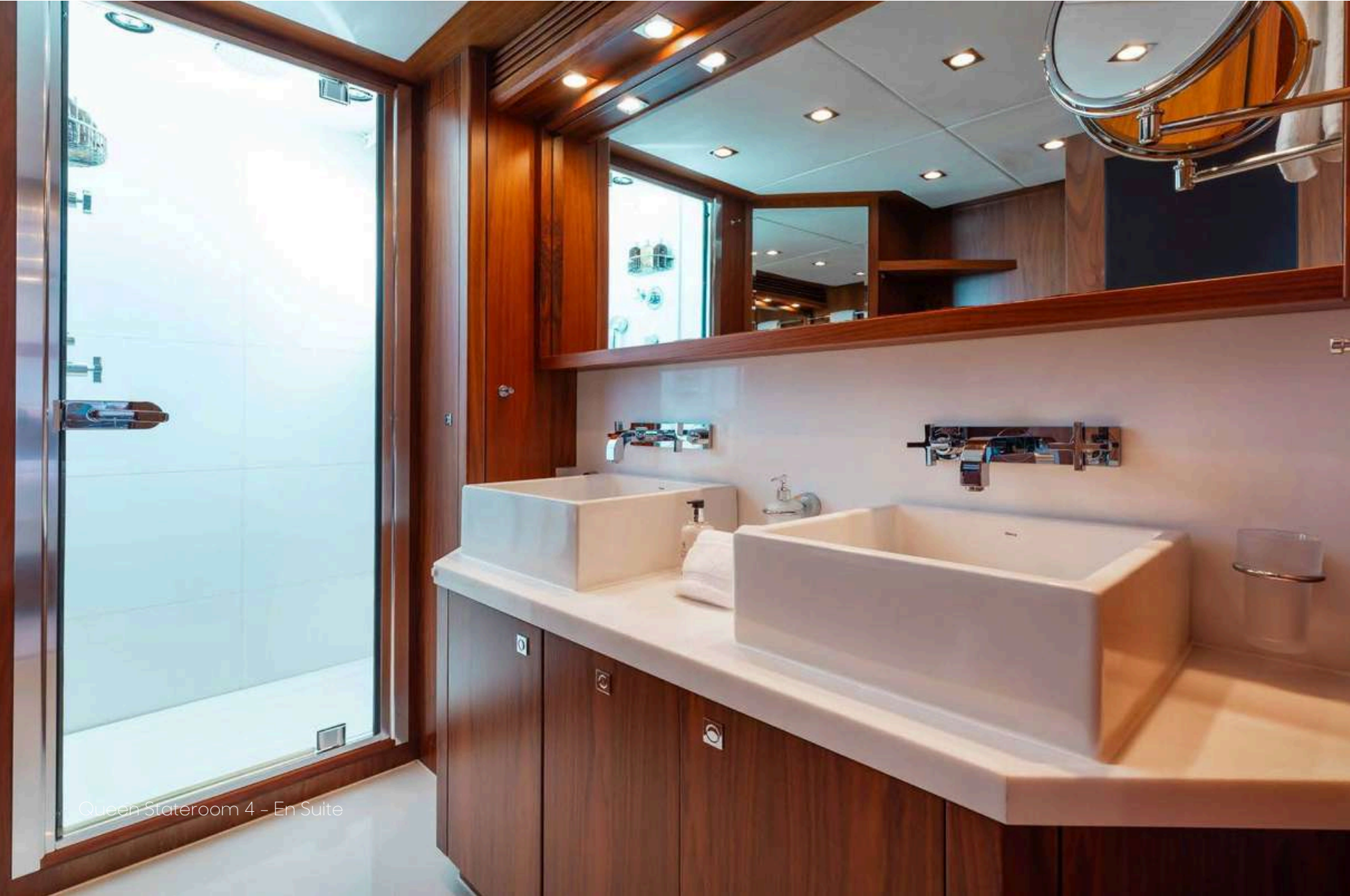
Queen Stateroom 4 - En Suite