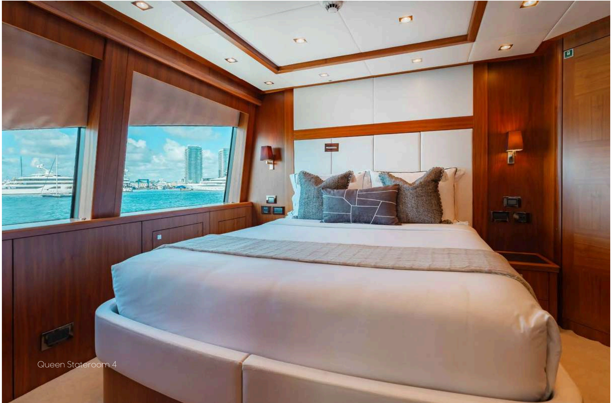
Queen Stateroom 4