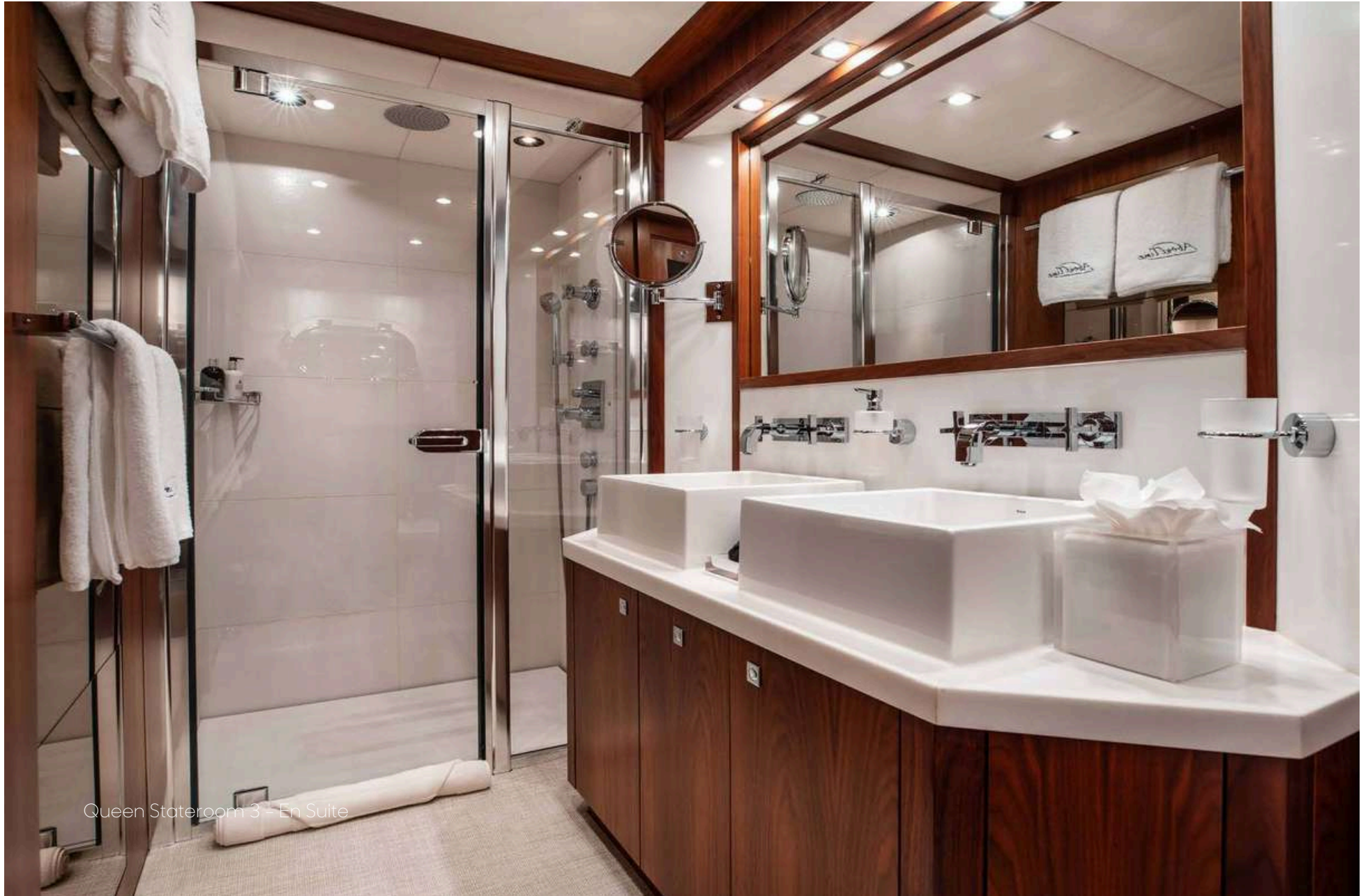
Queen Stateroom 3 - En Suite