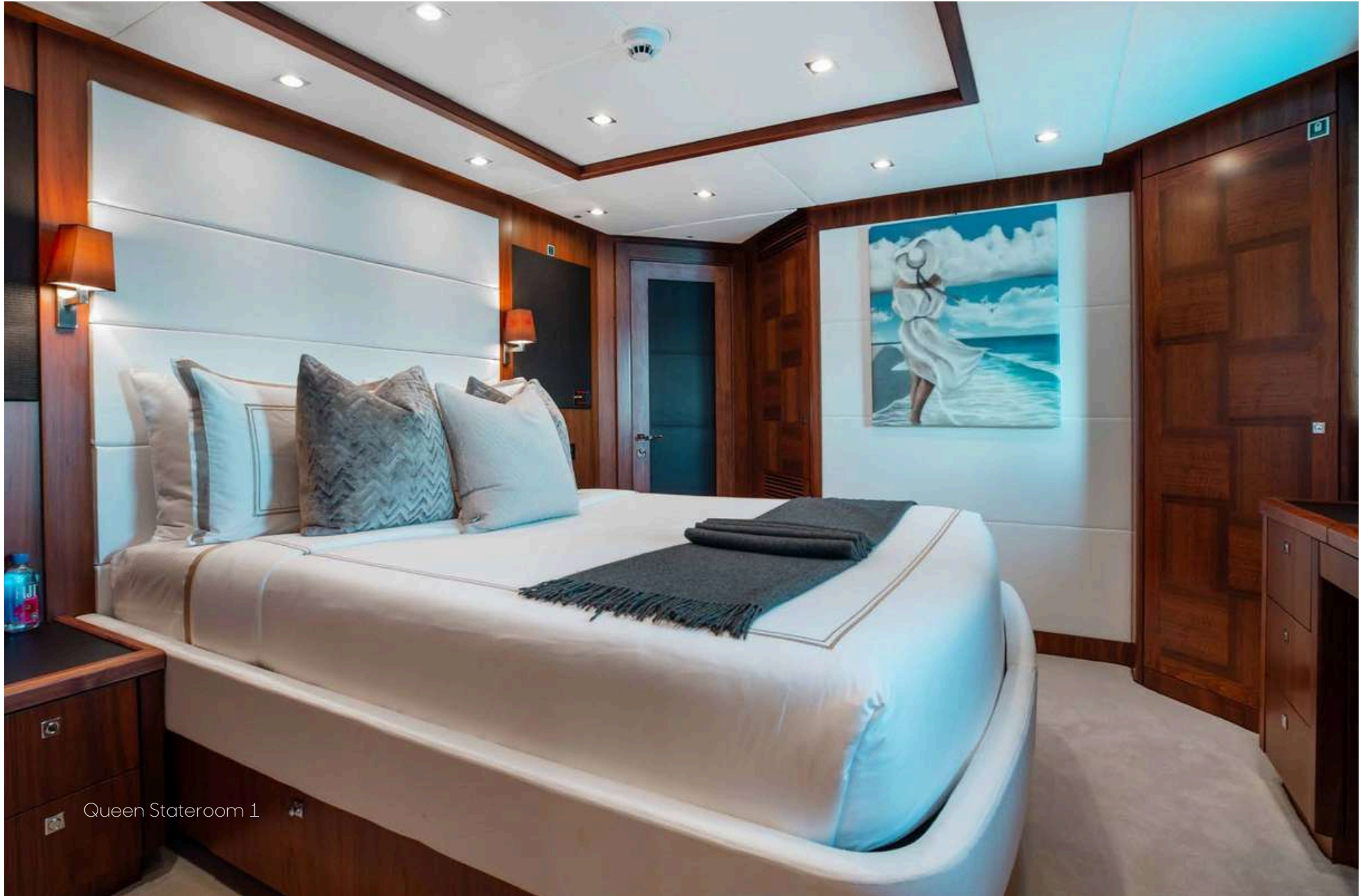
Queen Stateroom 1