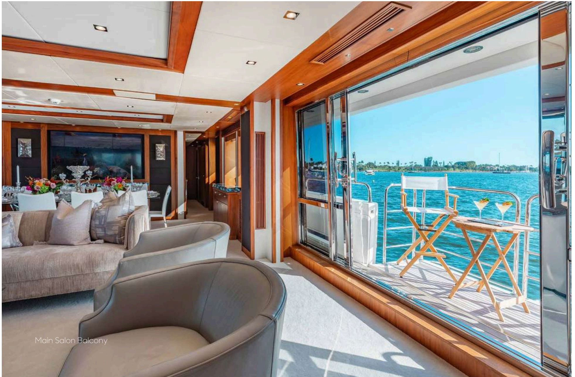
Main Salon Balcony