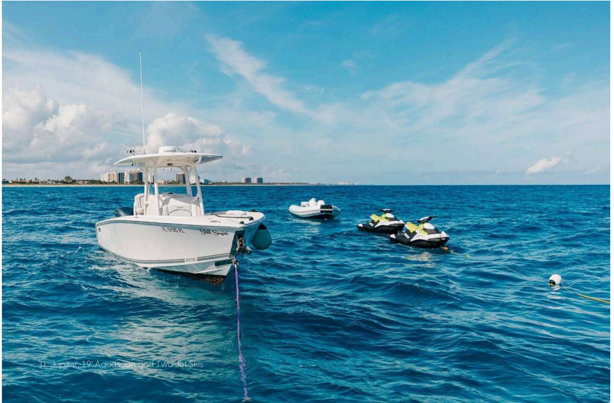
31' Jupiter, 19' Aquascan and Two Jet Skis