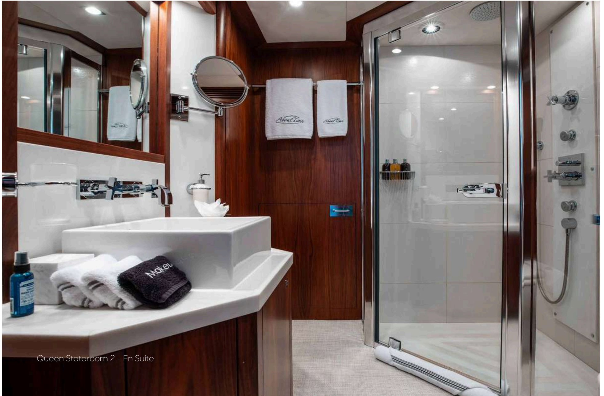
Queen Stateroom 2 - En Suite