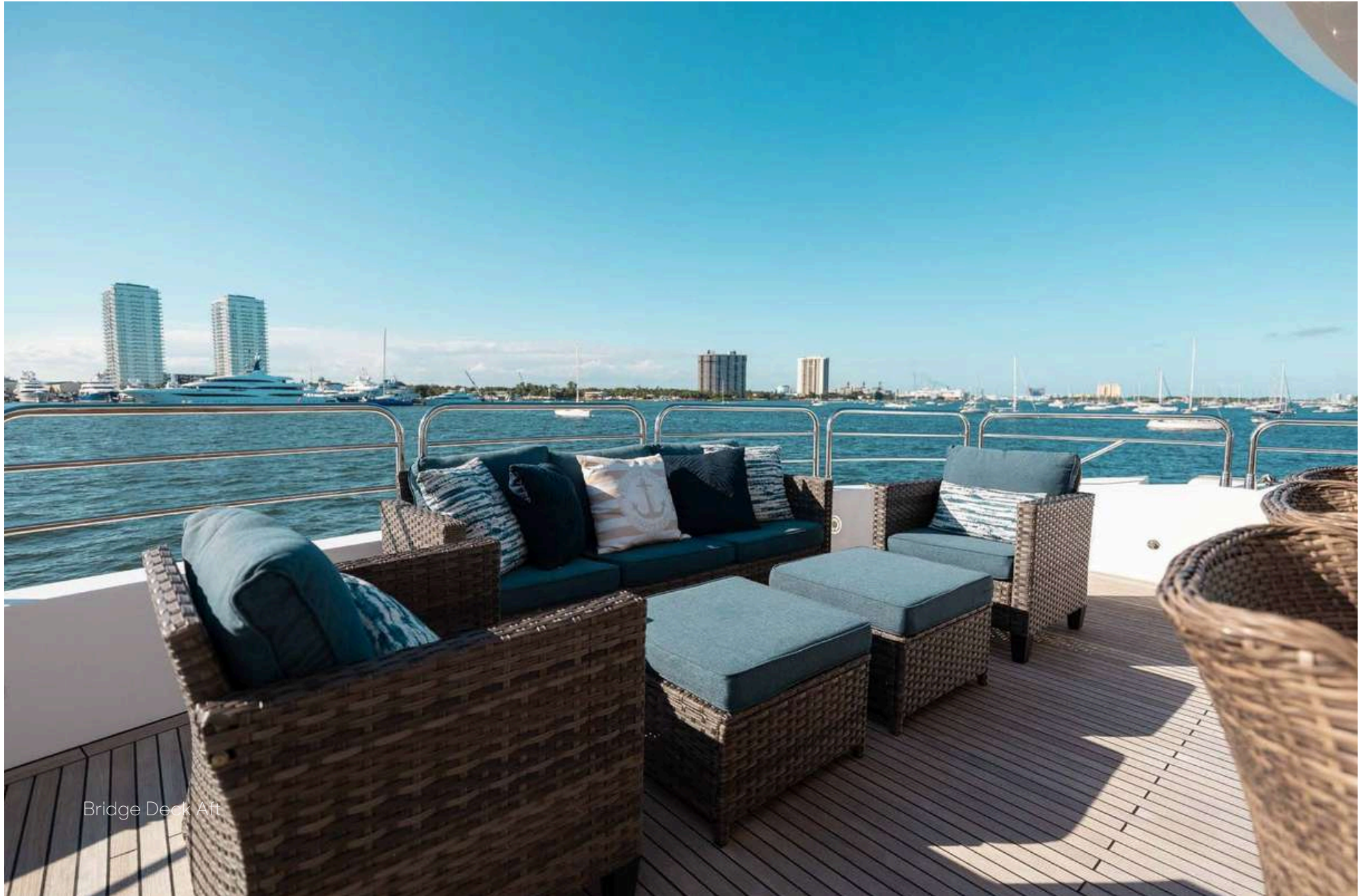
Bridge Deck Art