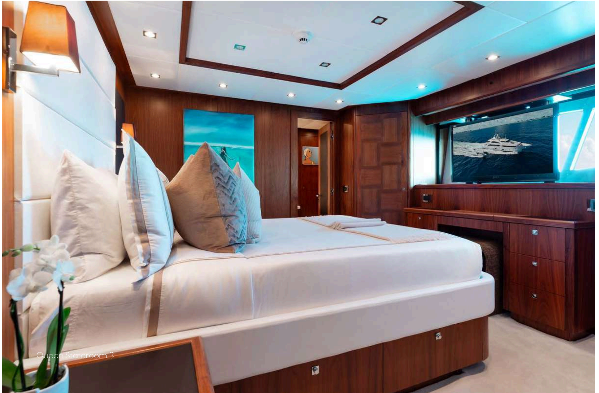
Queen Stateroom 3