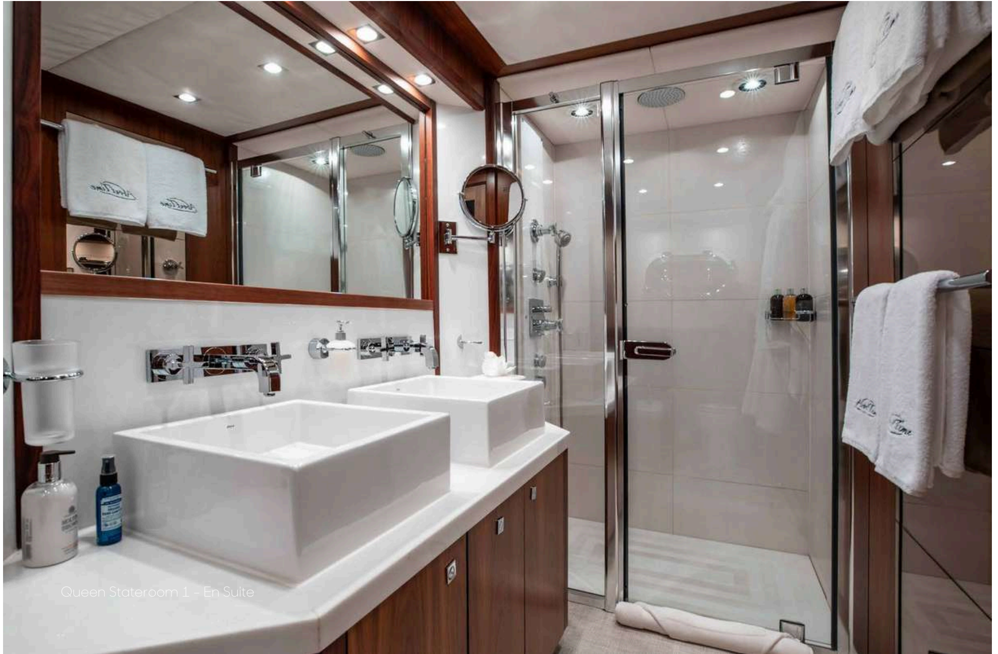
Queen Stateroom 1 - En Suite