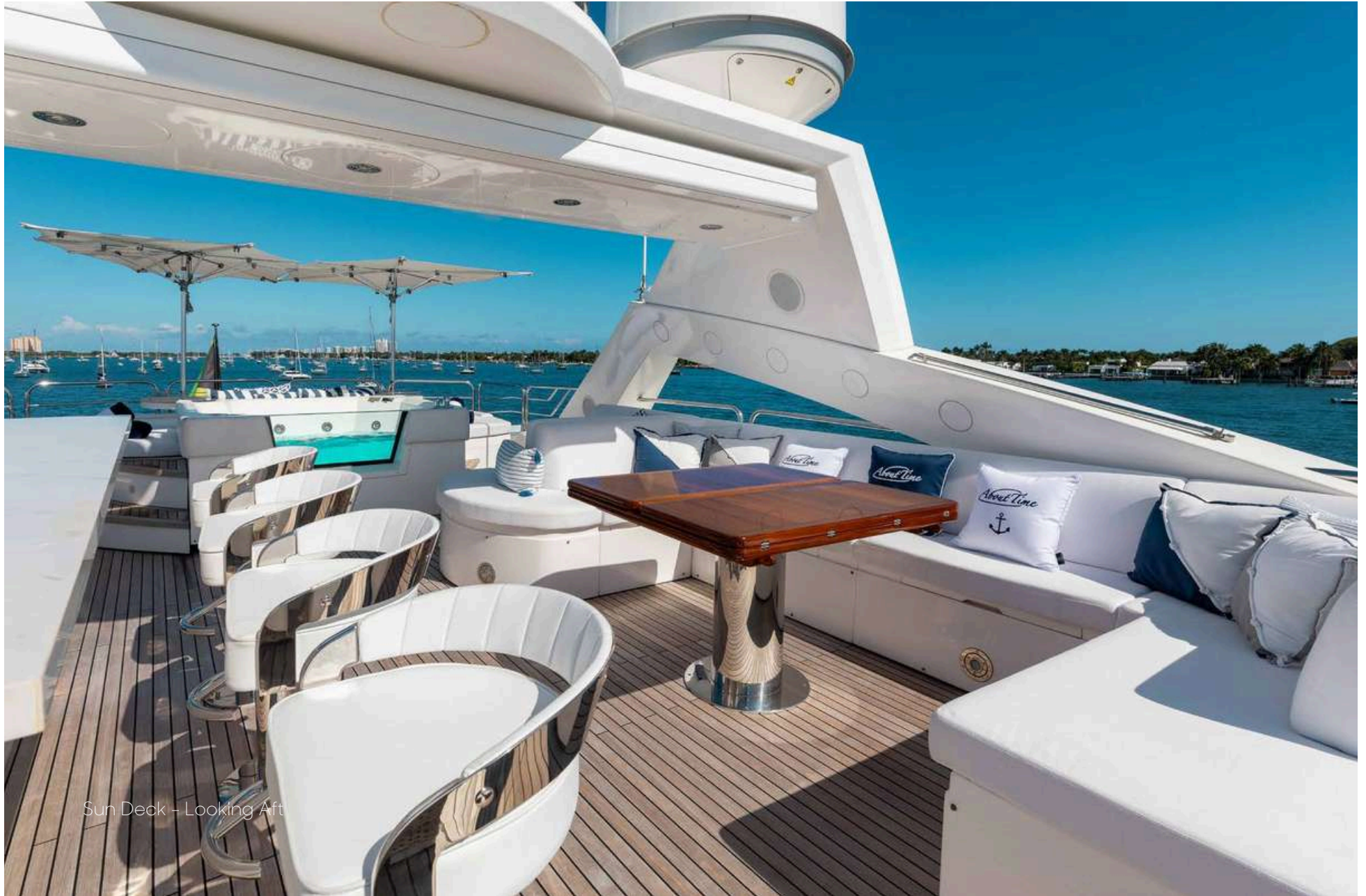
Sun Deck - Looking Aft