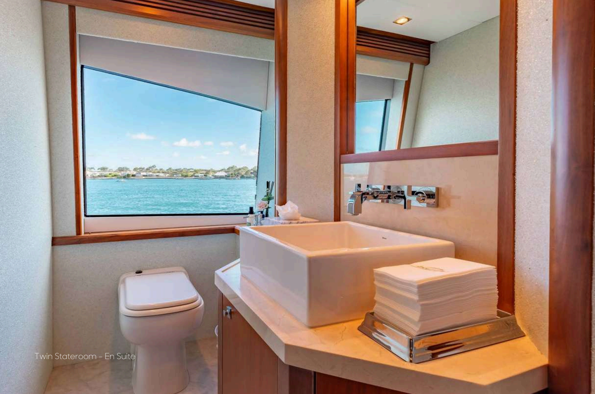
Twin Stateroom - En Suite