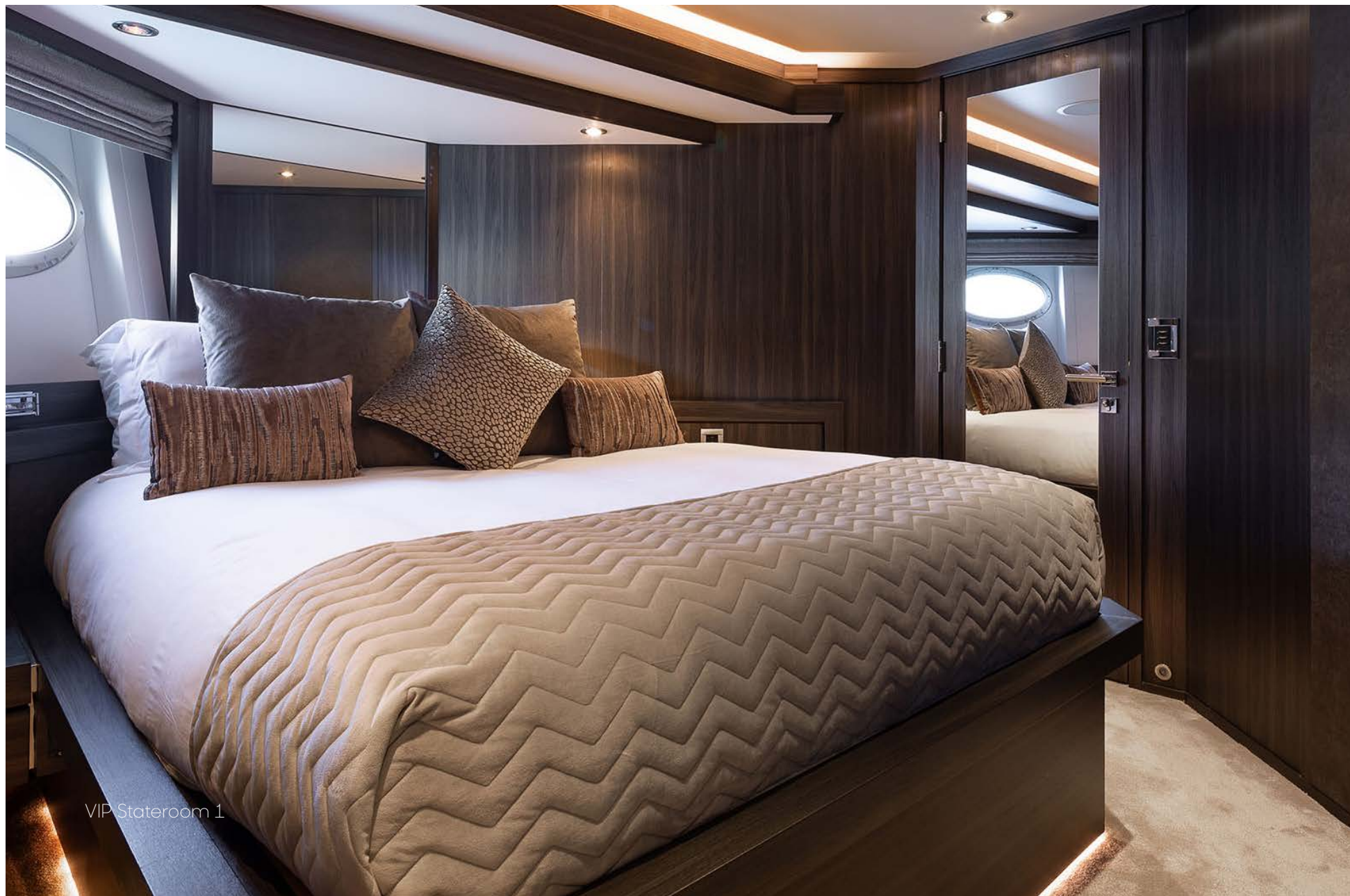
VIP Stateroom 1