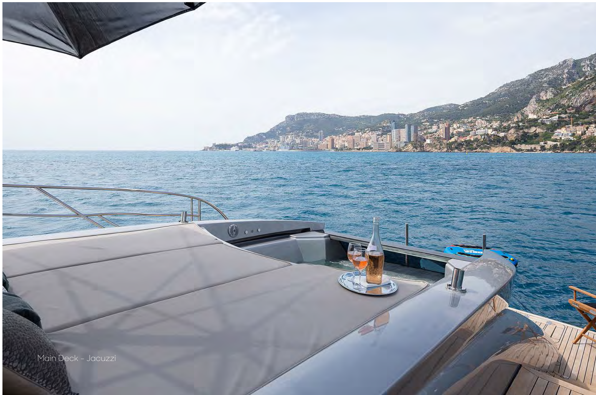
Main Deck - Jacuzzi