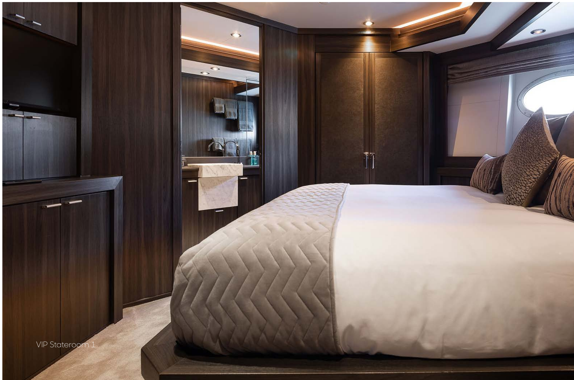
VIP Stateroom 1