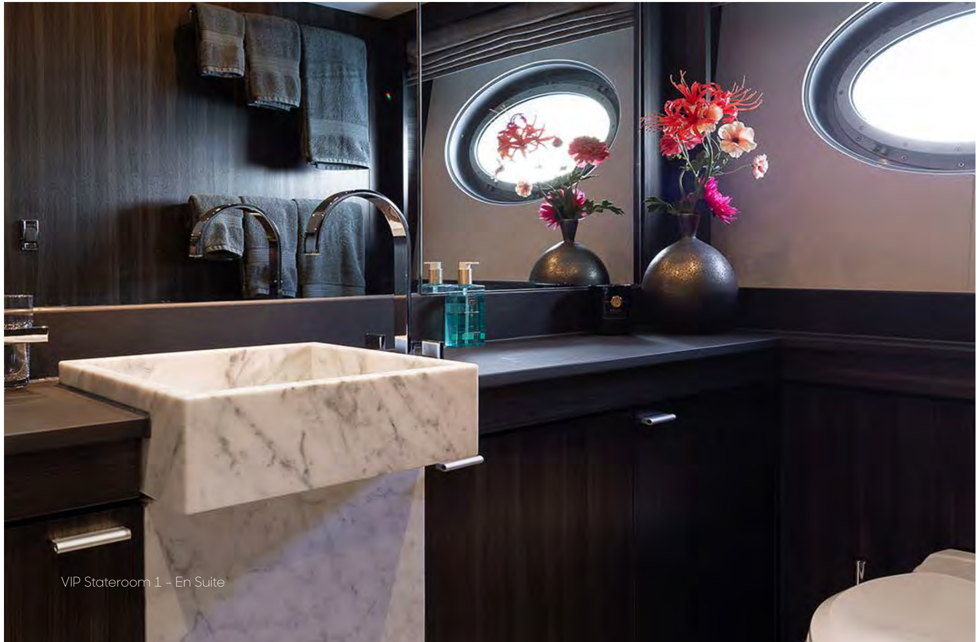
VIP Stateroom 1 - En Suite