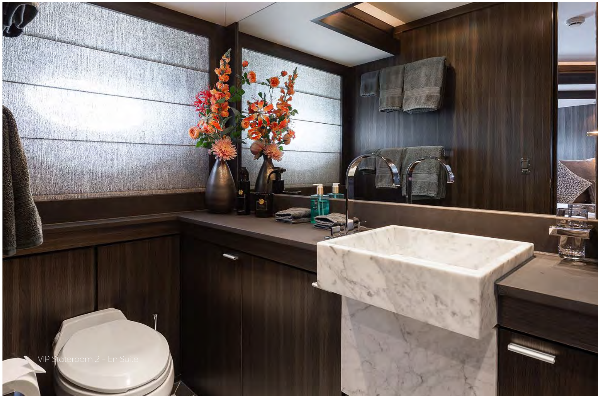
VIP Stateroom 2 - En Suite