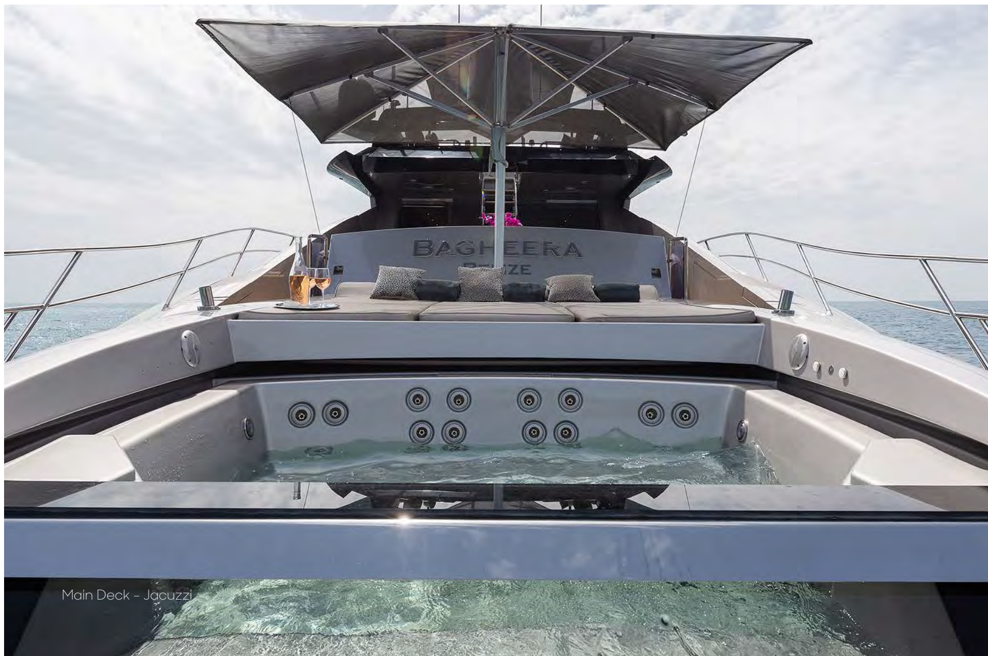
Main Deck - Jacuzzi