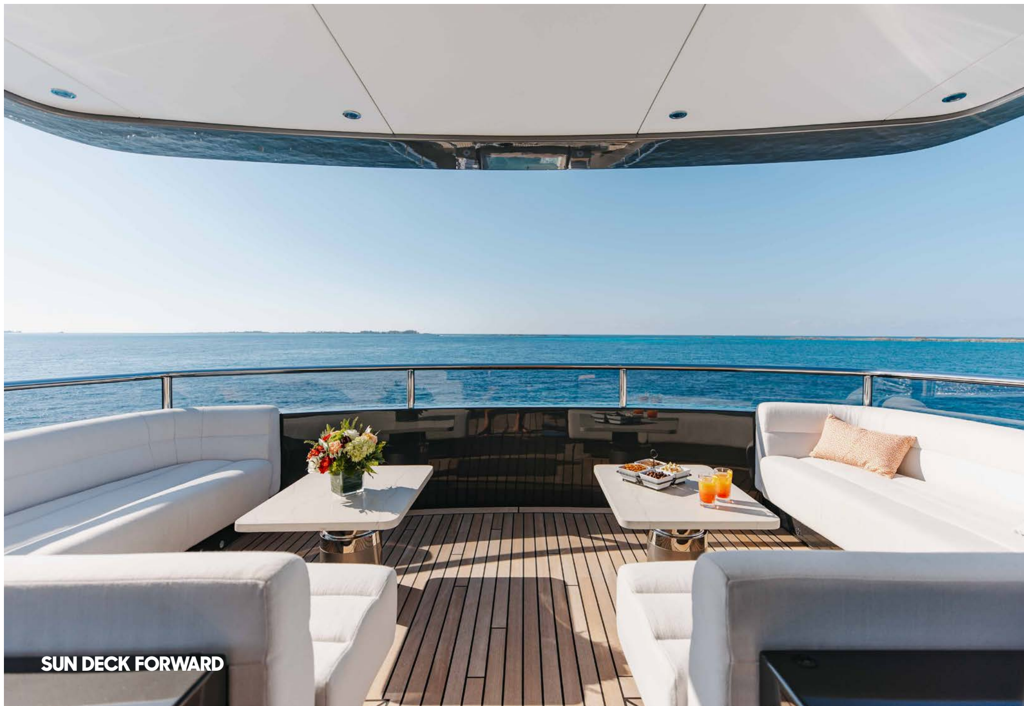
SUN DECK FORWARD