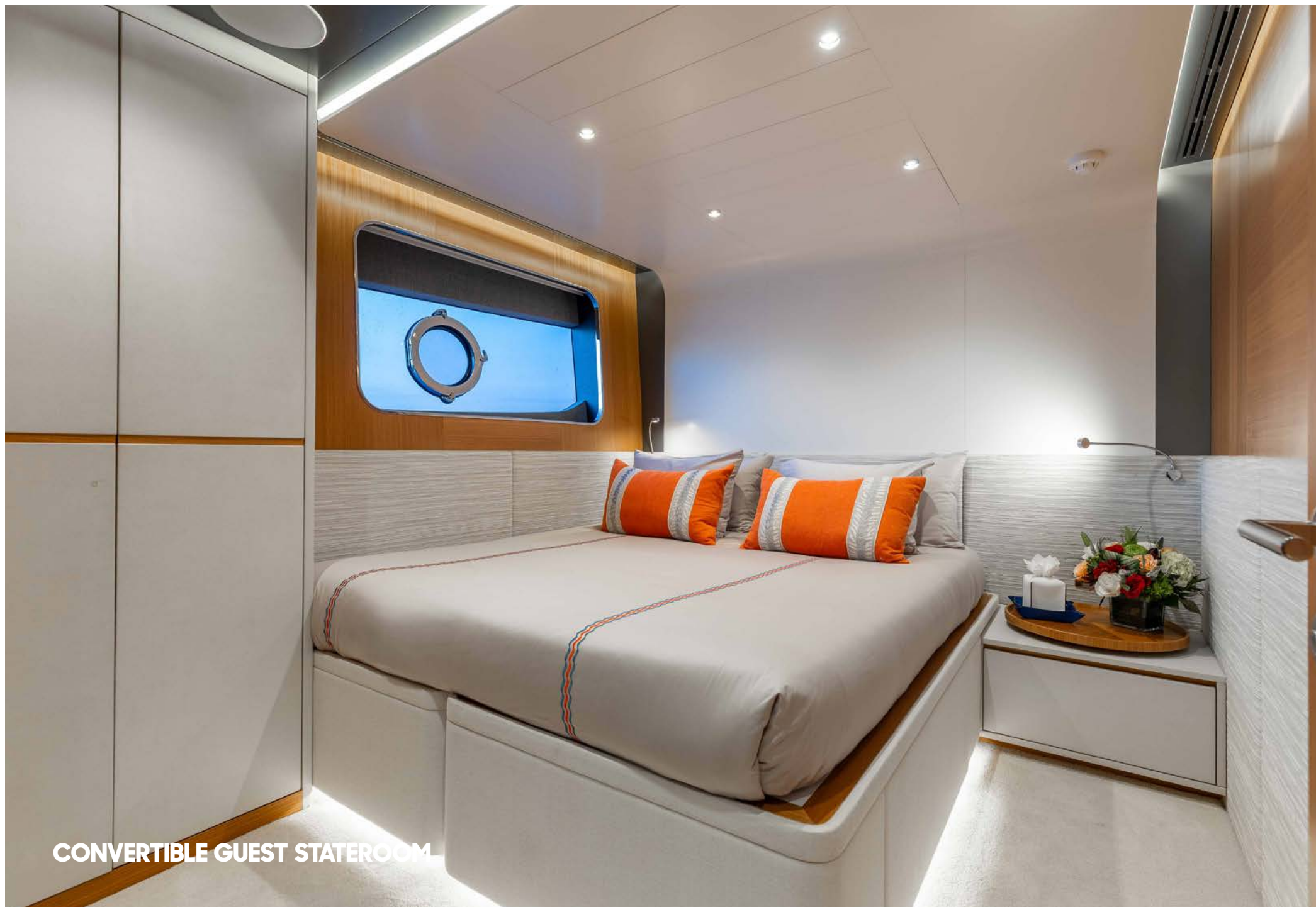
CONVERTIBLE GUEST STATEROOM