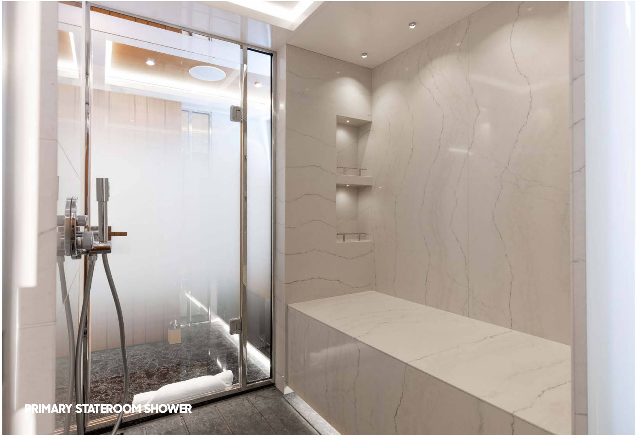
PRIMARY STATEROOM SHOWER