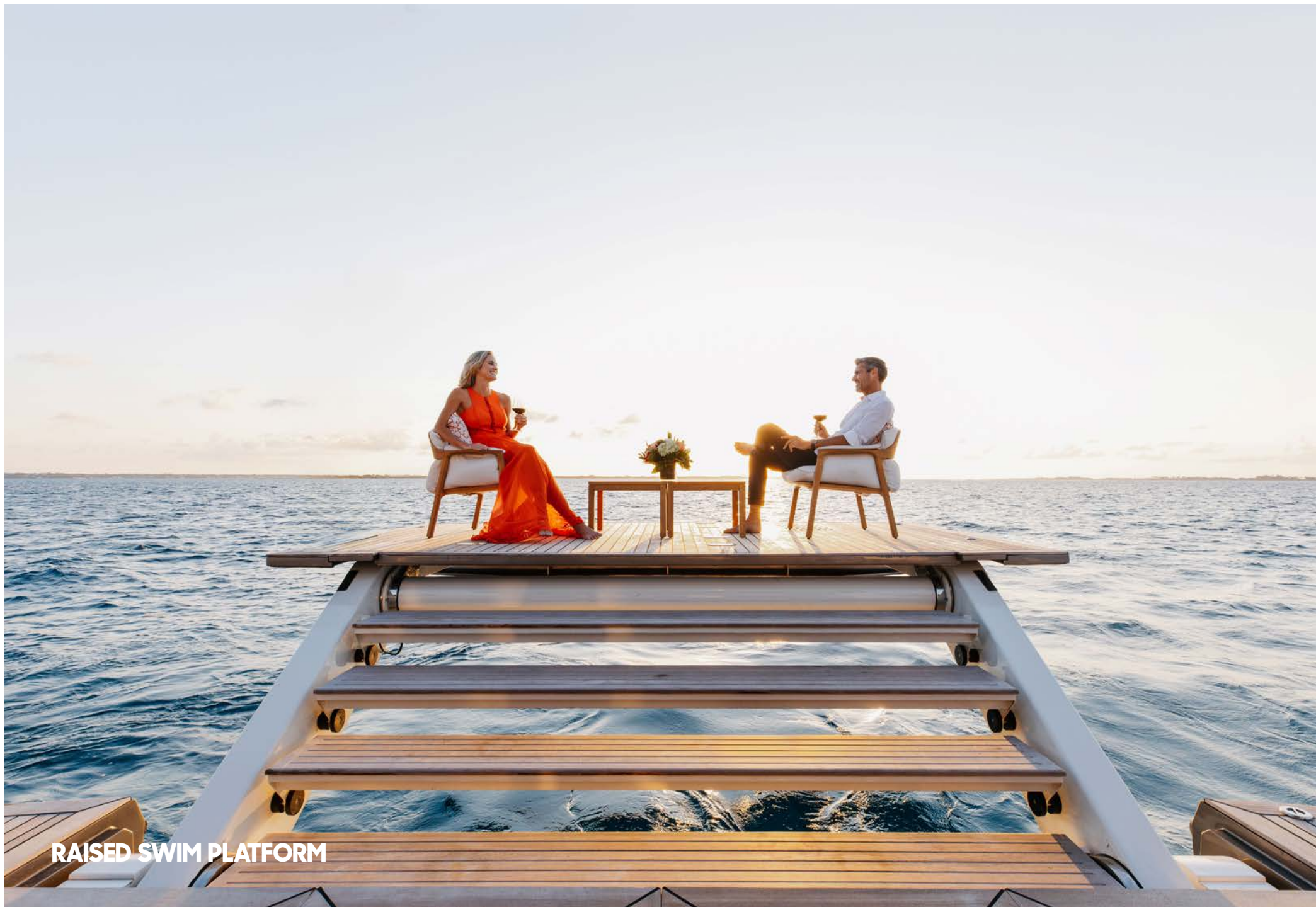
RAISED SWIM PLATFORM