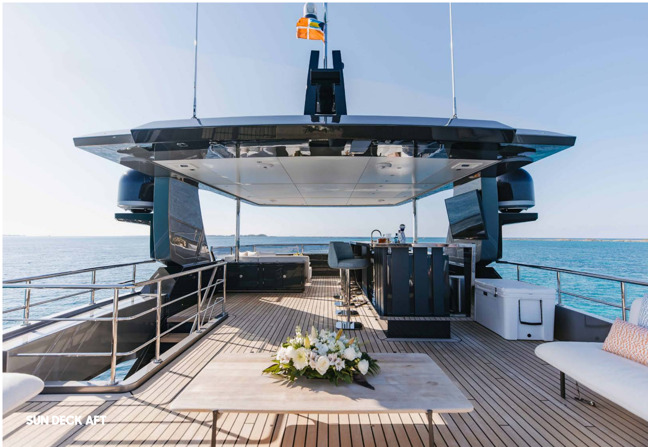
SUN DECK AFT