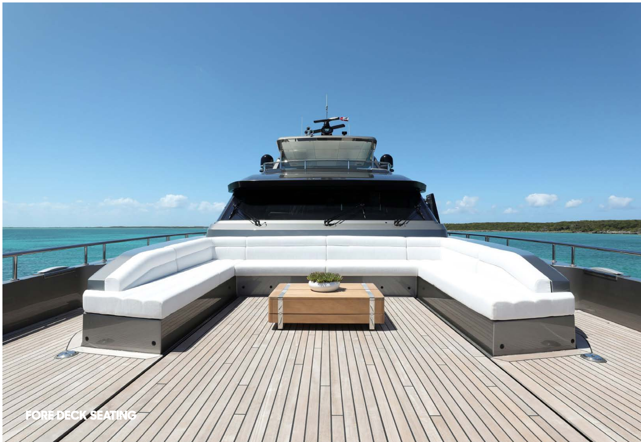
FORE DECK SEATING