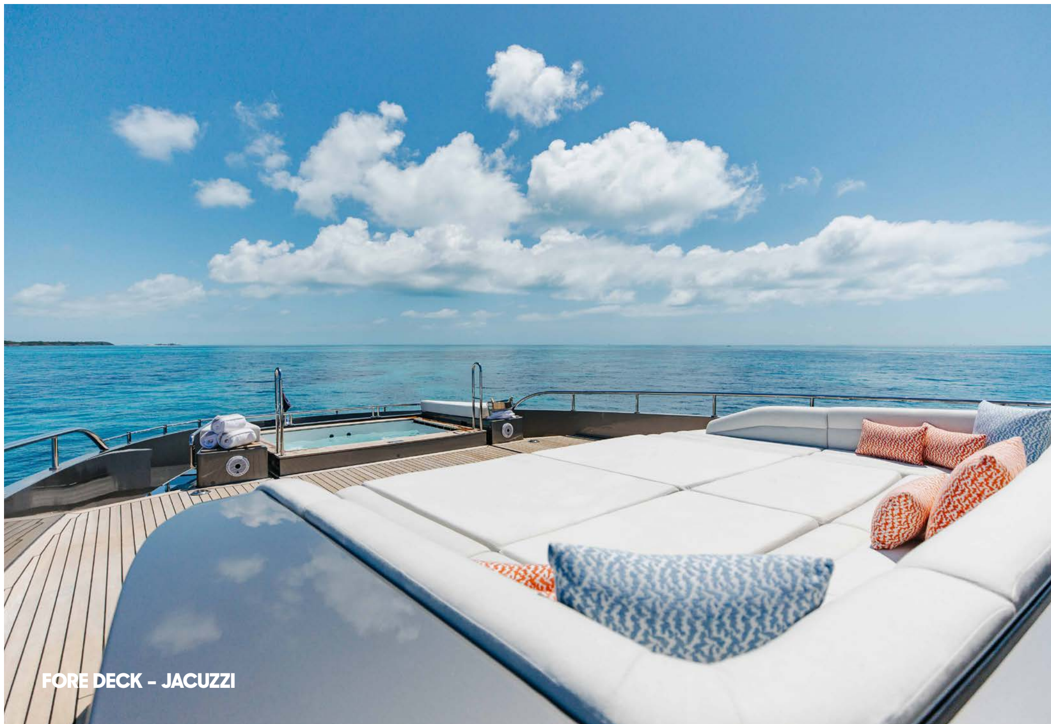
FORE DECK - JACUZZI