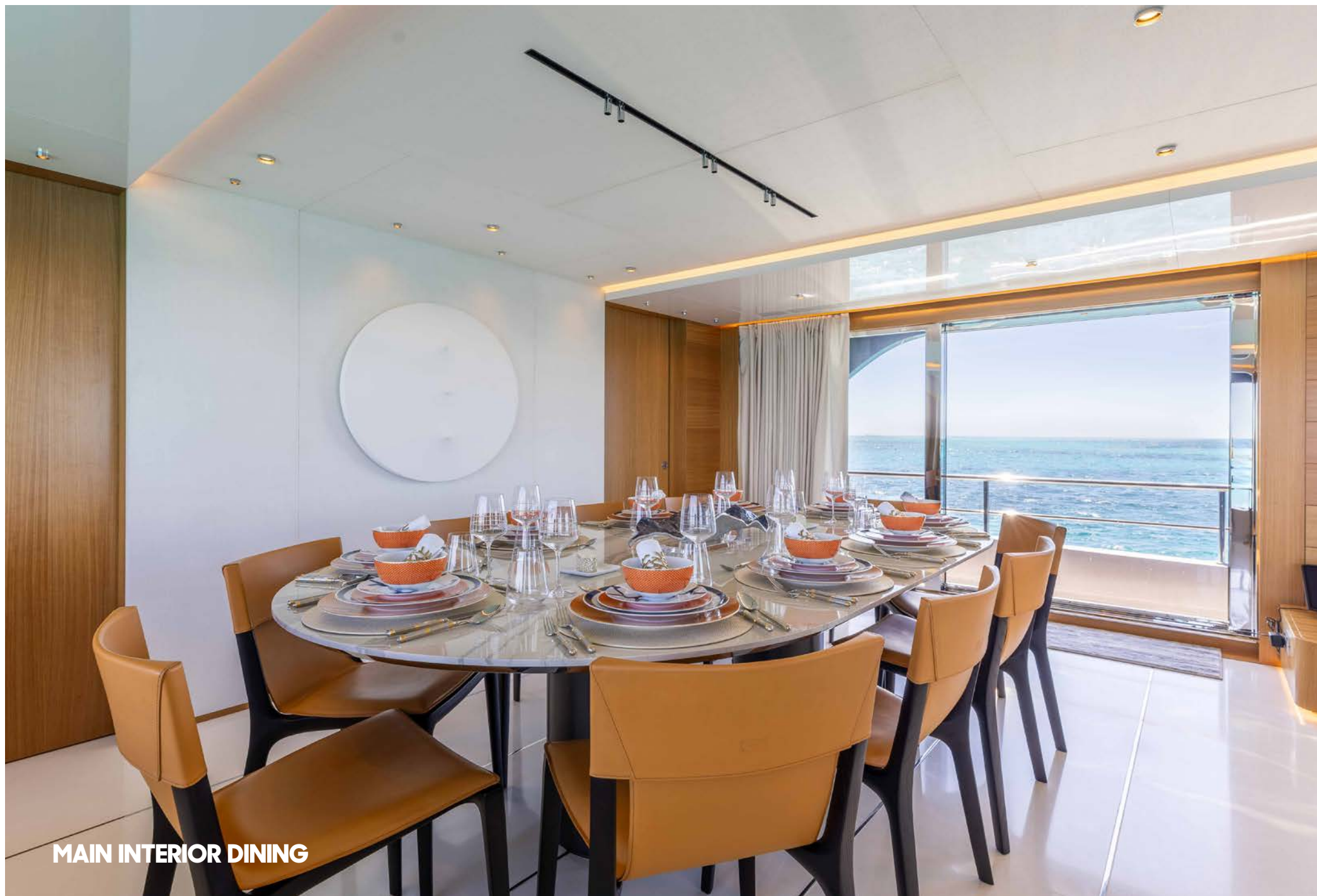
MAIN INTERIOR DINING