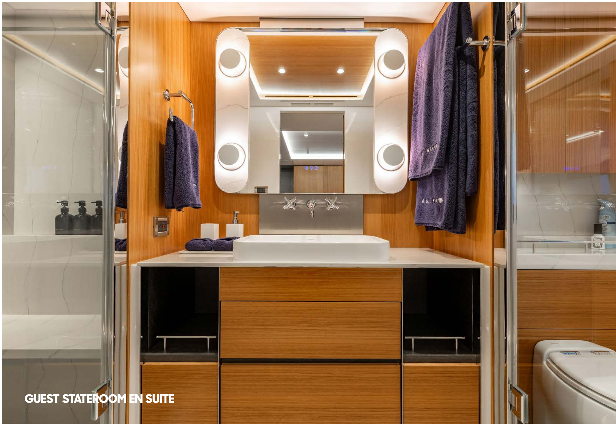
GUEST STATEROOM EN SUITE