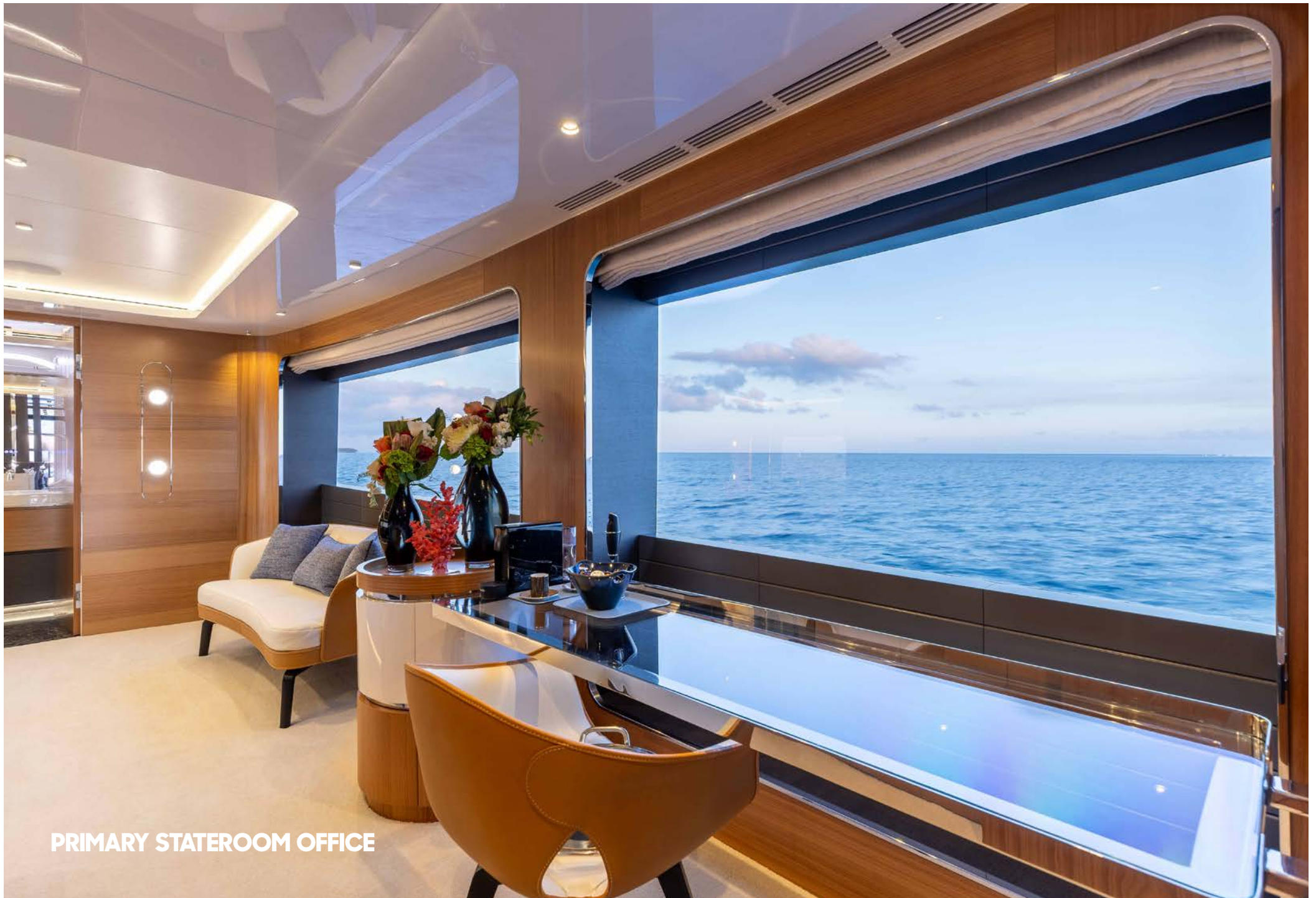
PRIMARY STATEROOM OFFICE