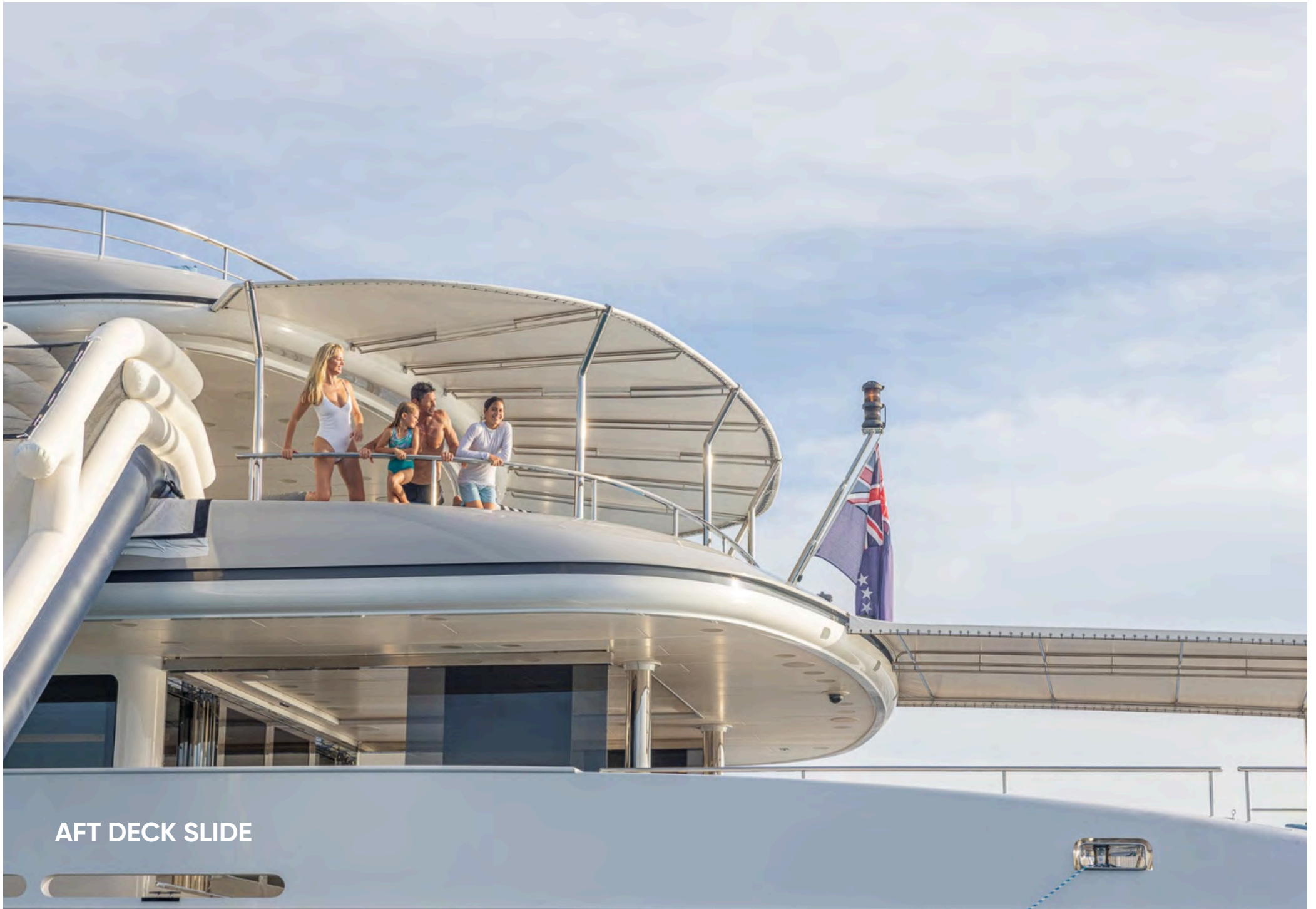
AFT DECK SLIDE