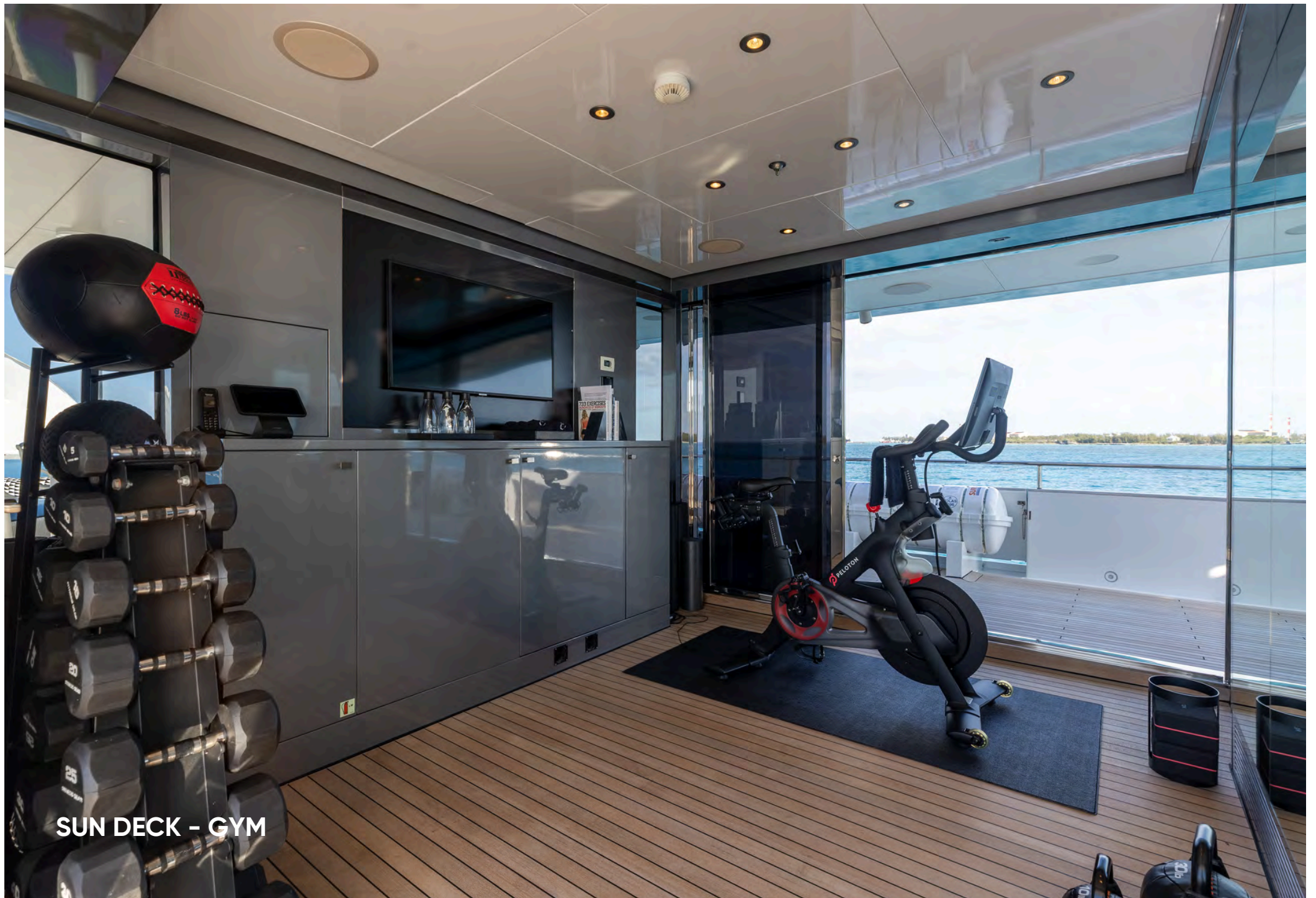
SUN DECK - GYM