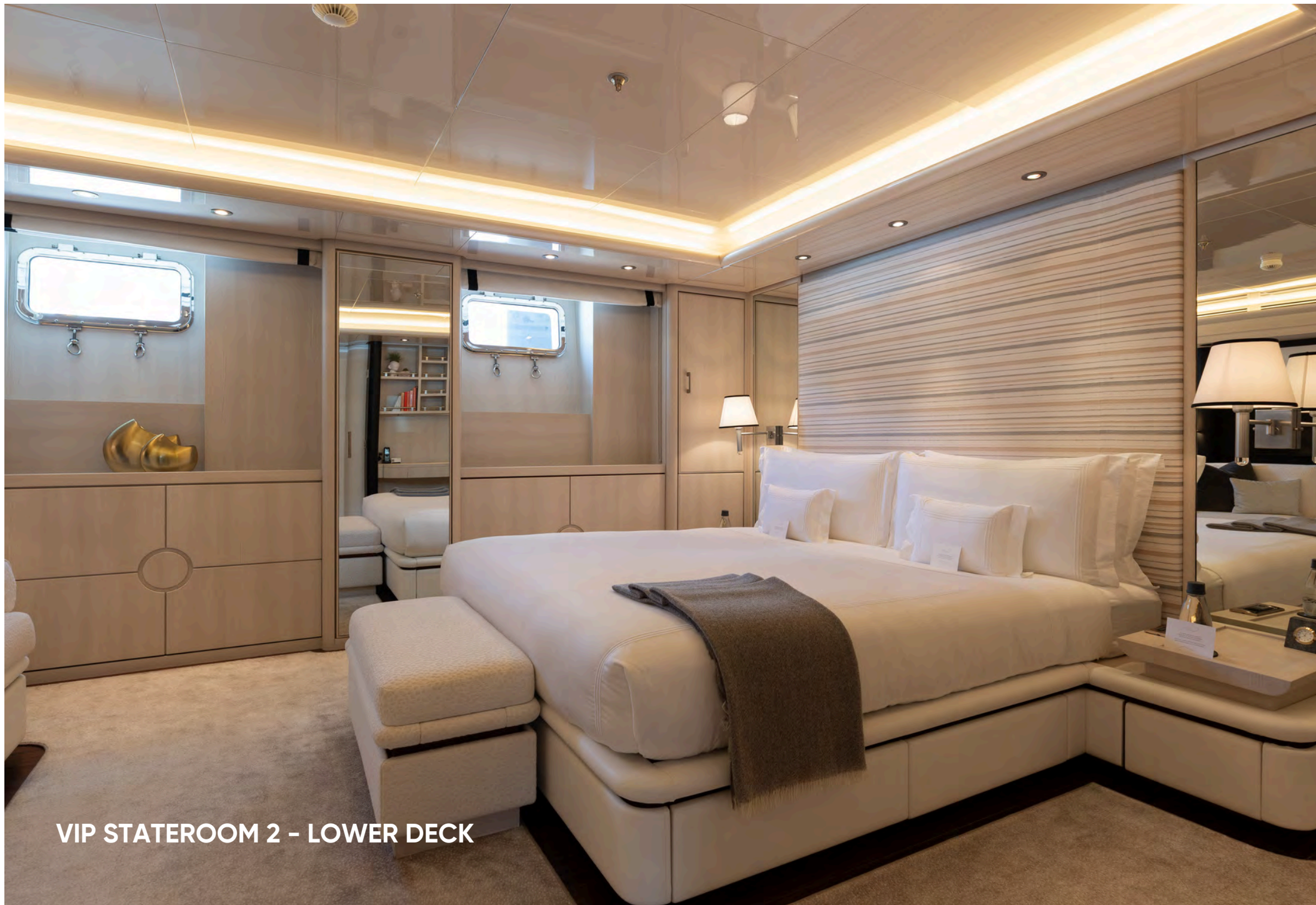
VIP STATEROOM 2 - LOWER DECK