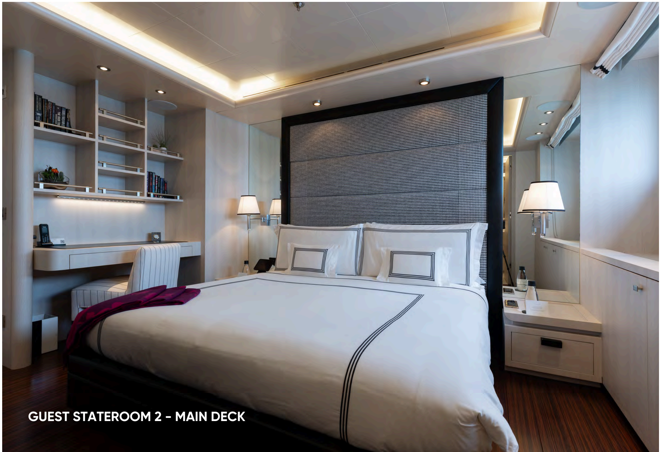
GUEST STATEROOM 2 - MAIN DECK