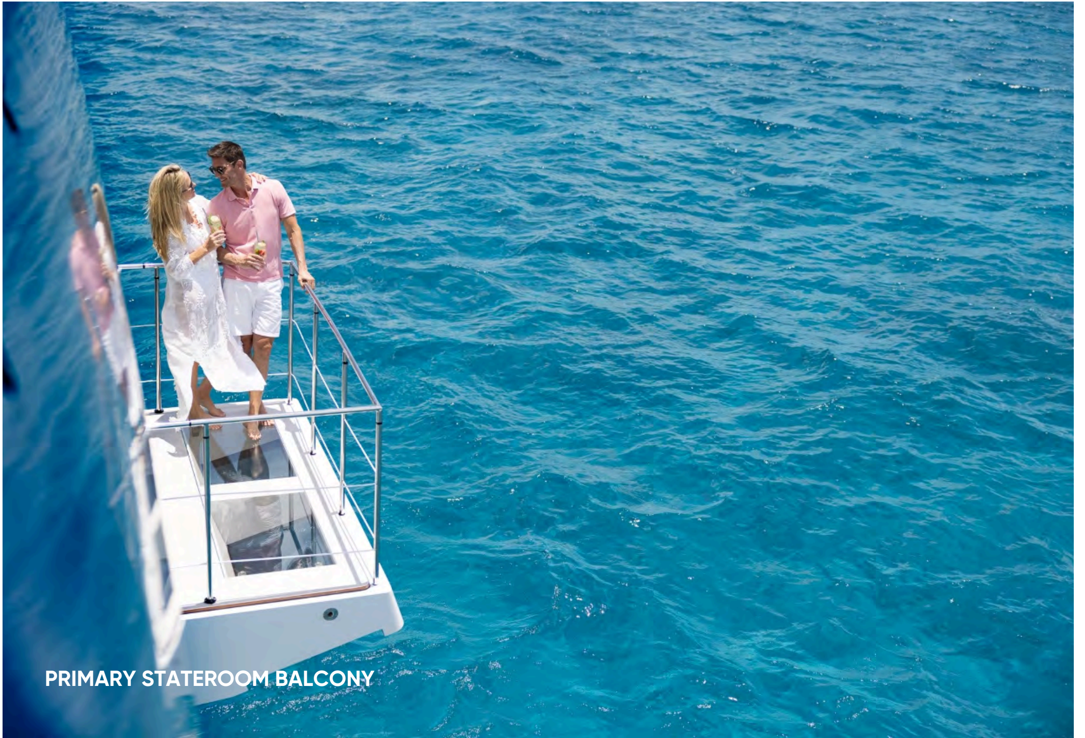
PRIMARY STATEROOM BALCONY