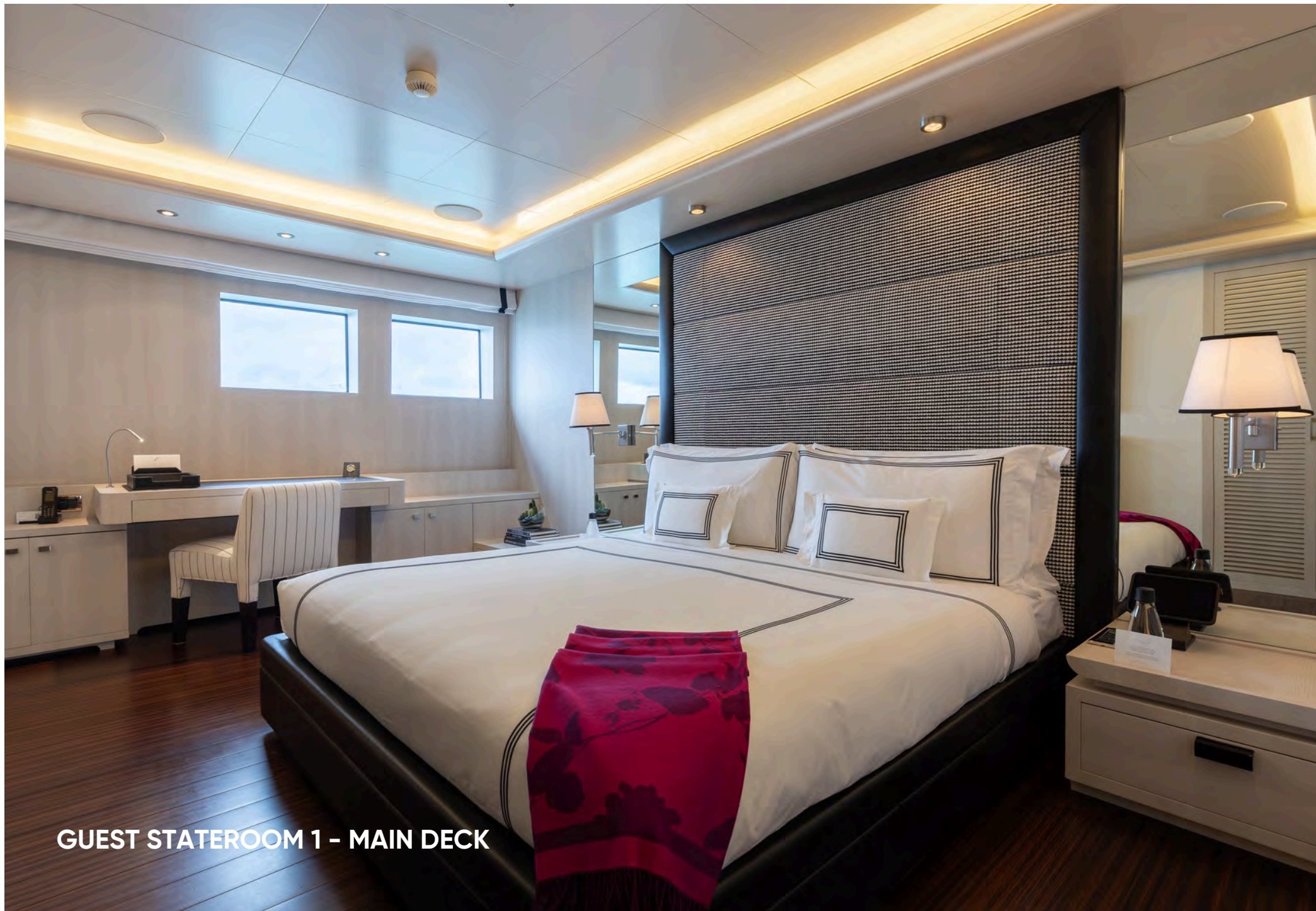
GUEST STATEROOM 1 - MAIN DECK