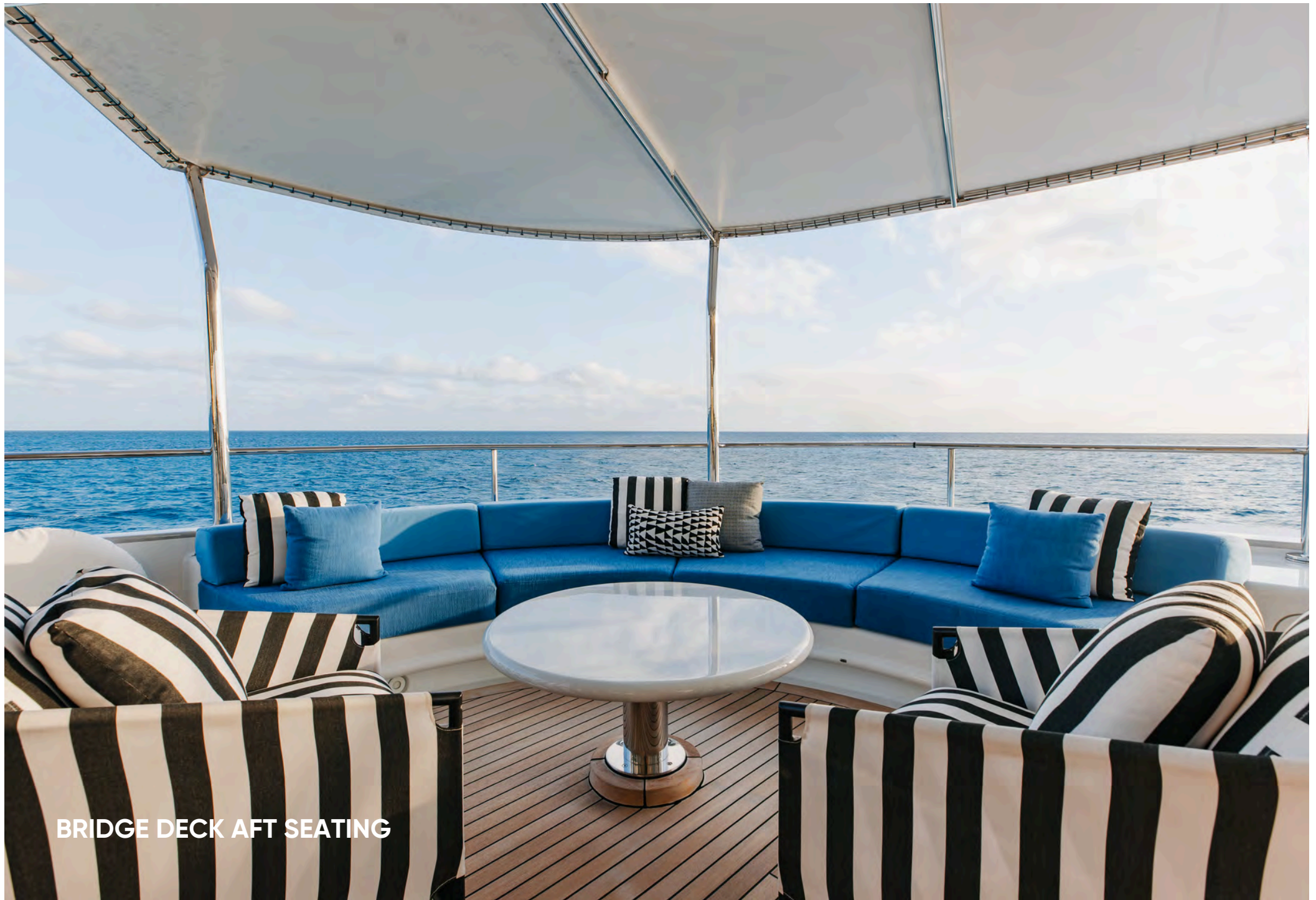
BRIDGE DECK AFT SEATING