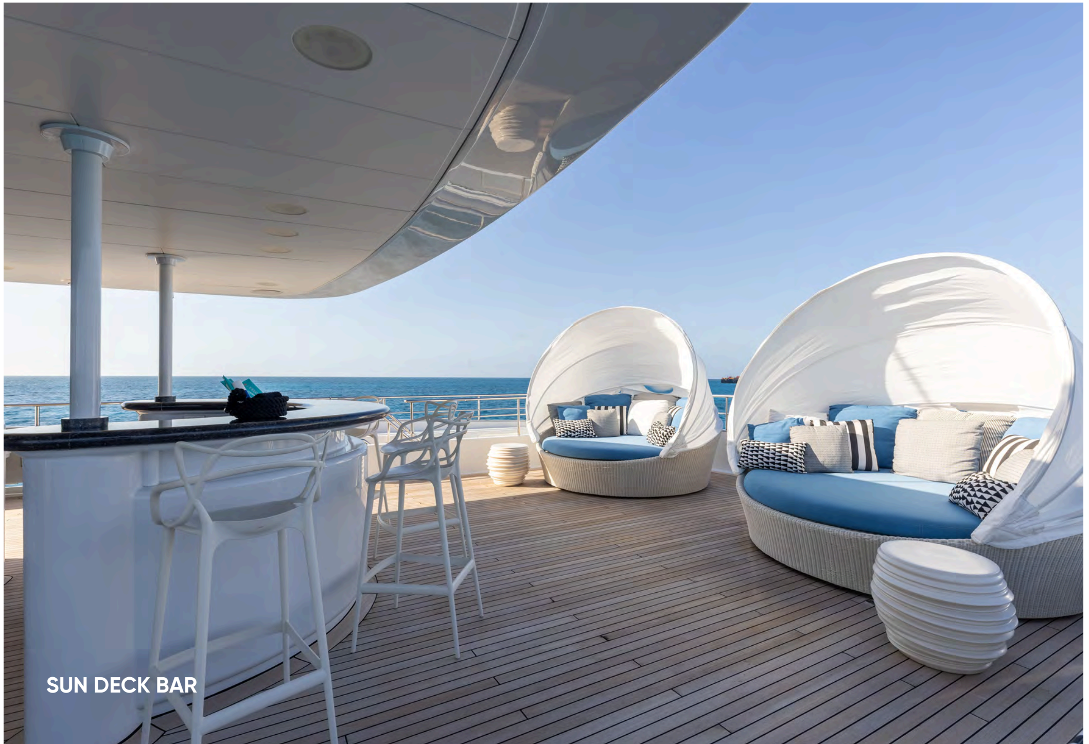
SUN DECK BAR