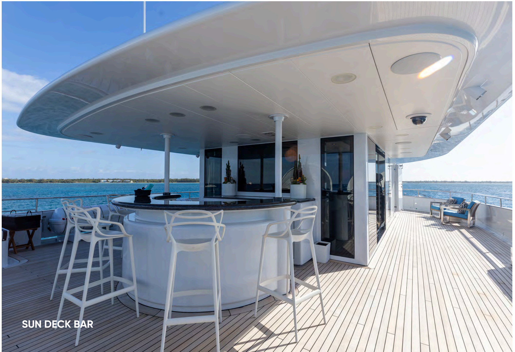
SUN DECK BAR