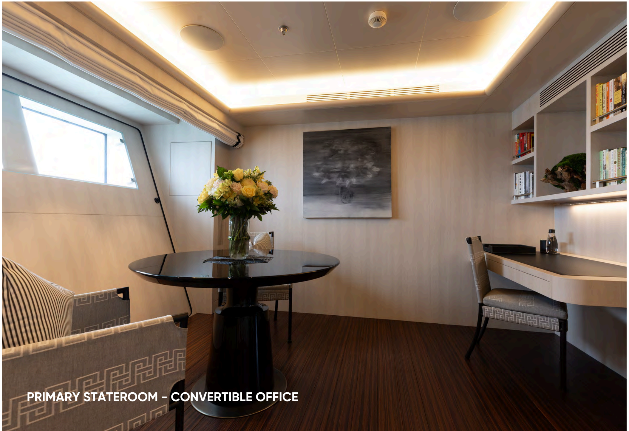
PRIMARY STATEROOM – CONVERTIBLE OFFICE