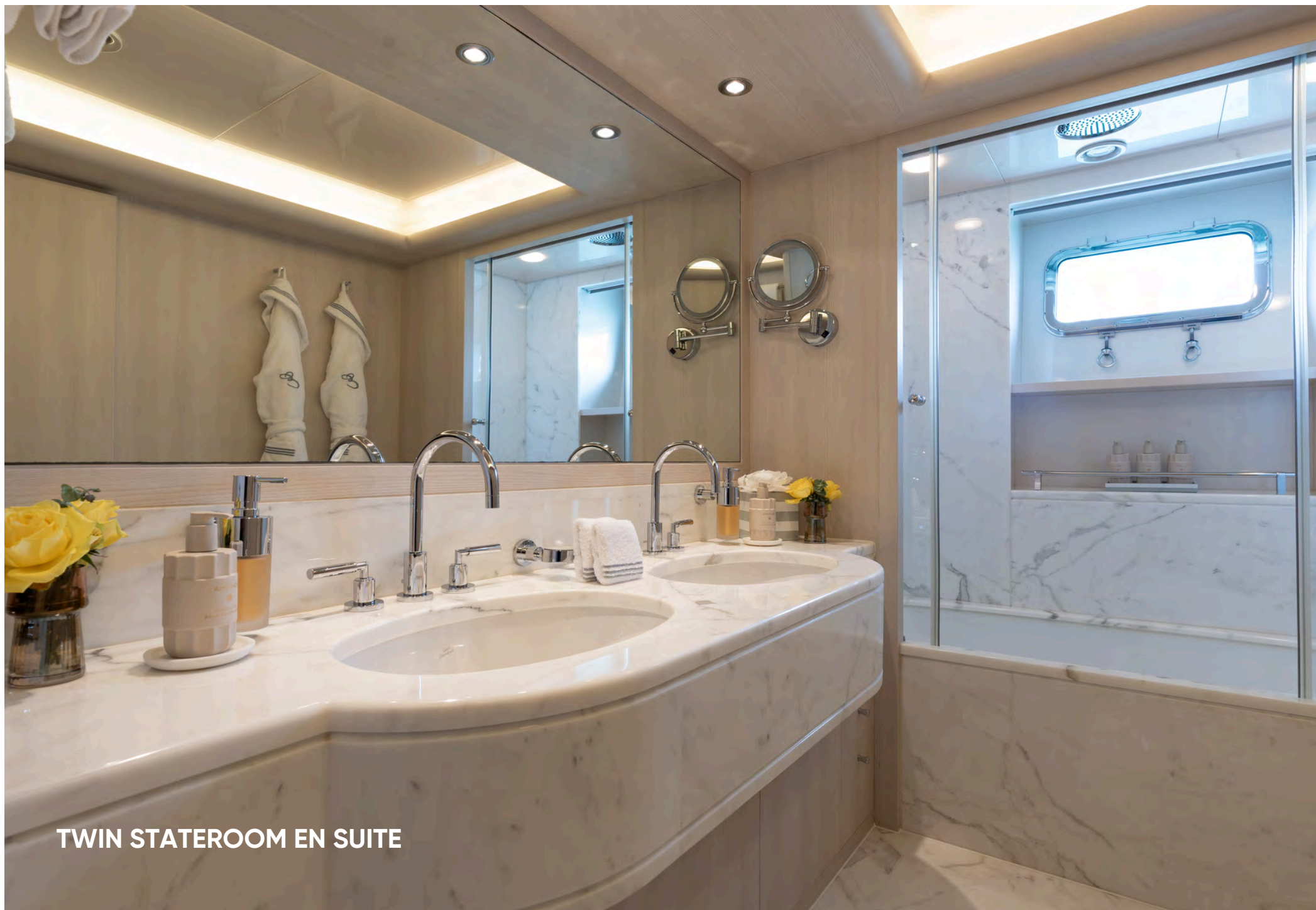
TWIN STATEROOM EN SUITE