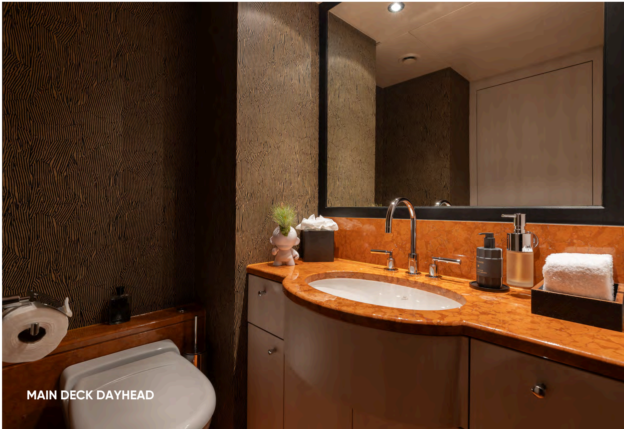
MAIN DECK DAYHEAD