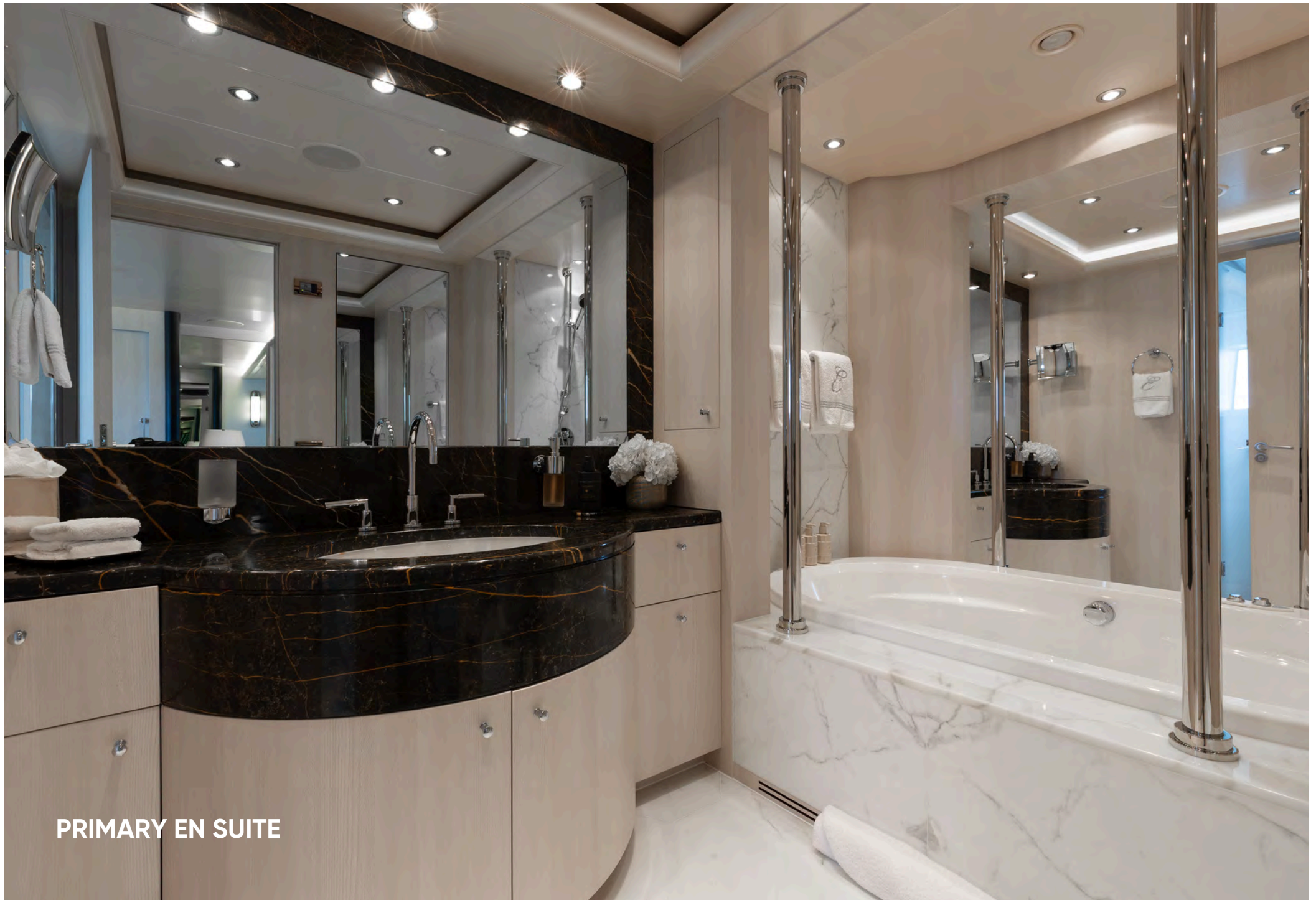
PRIMARY EN SUITE