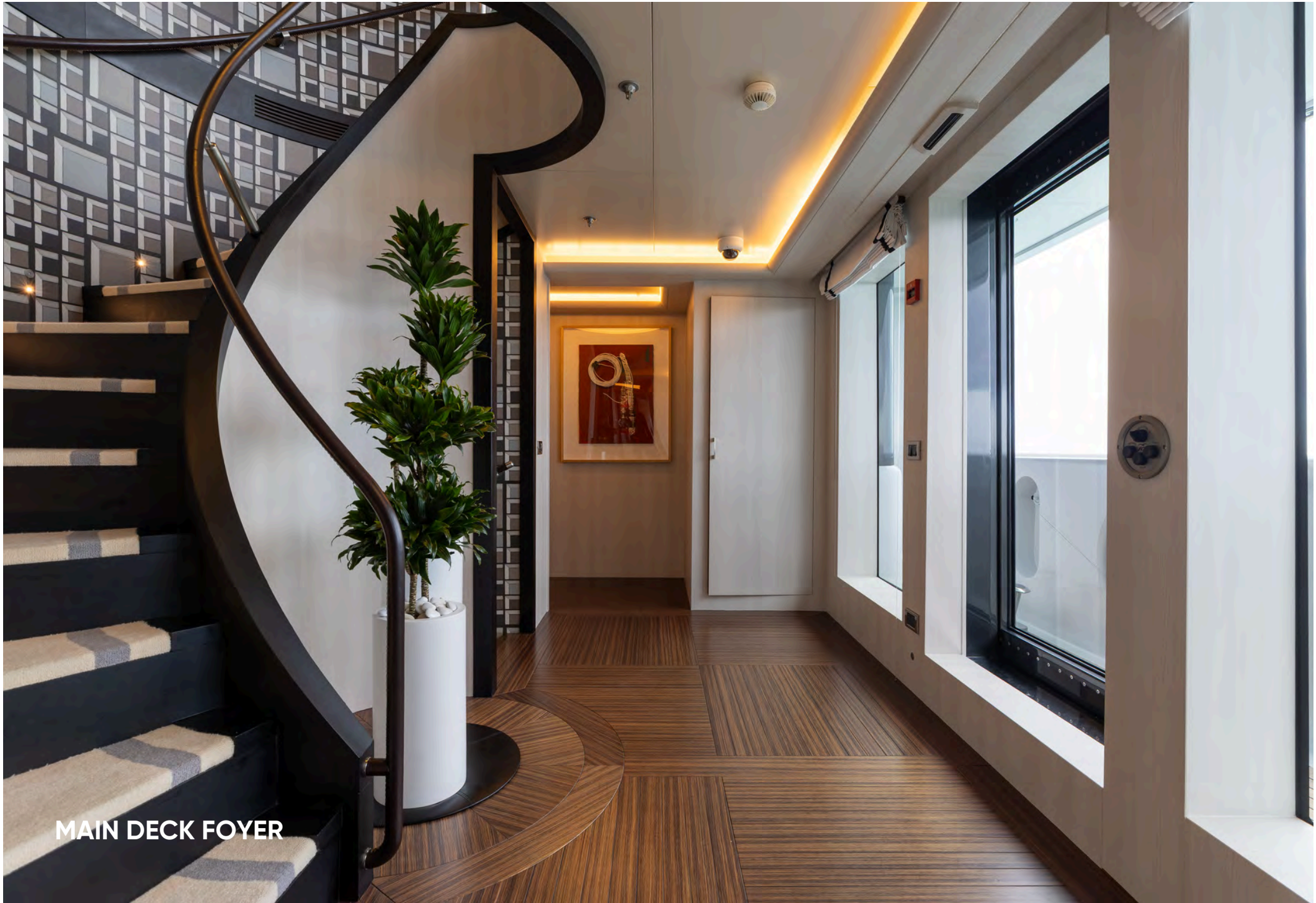
MAIN DECK FOYER