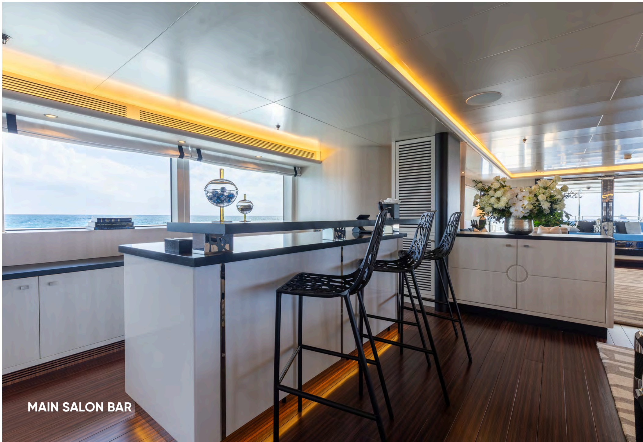
MAIN SALON BAR