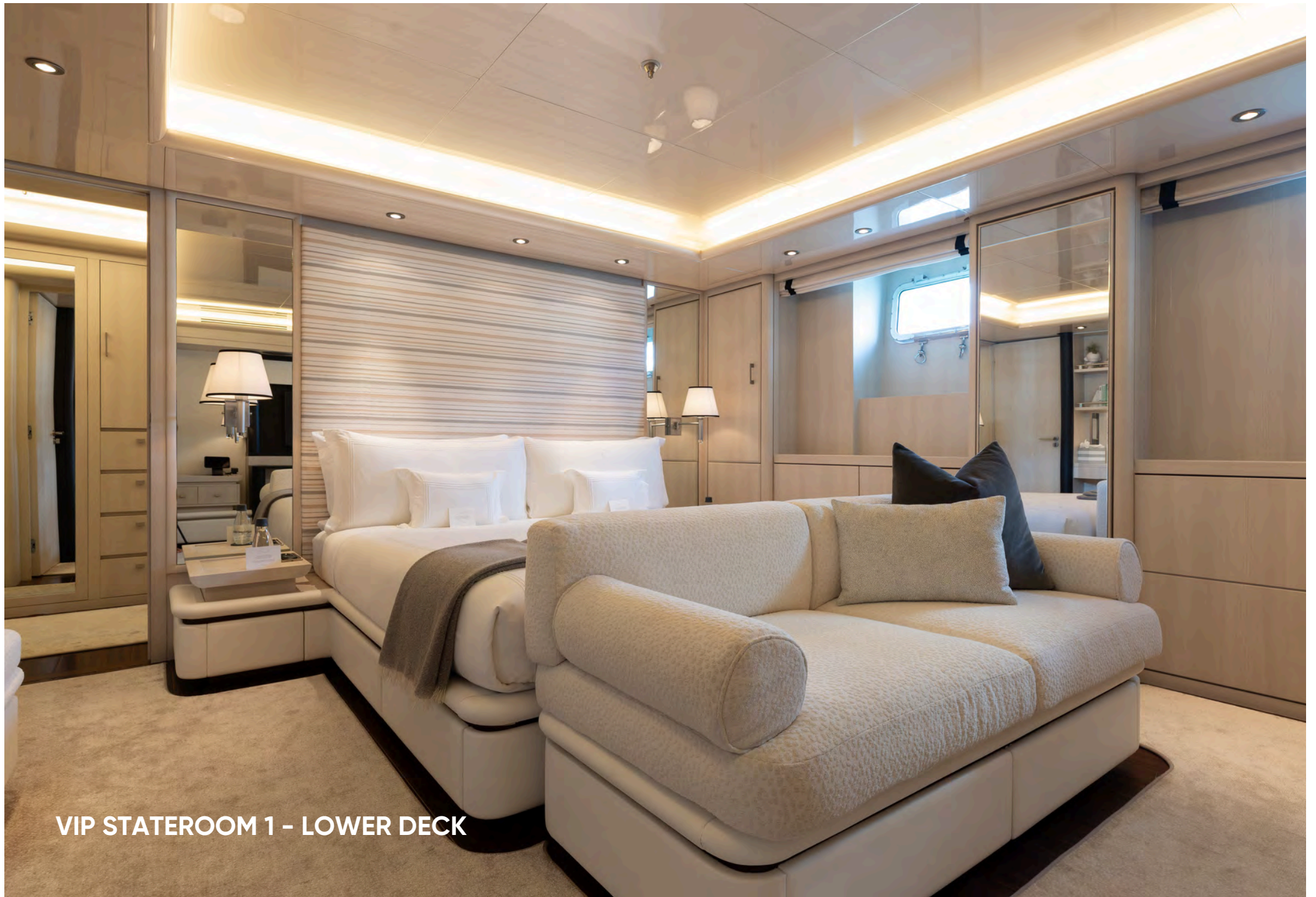
VIP STATEROOM 1 - LOWER DECK