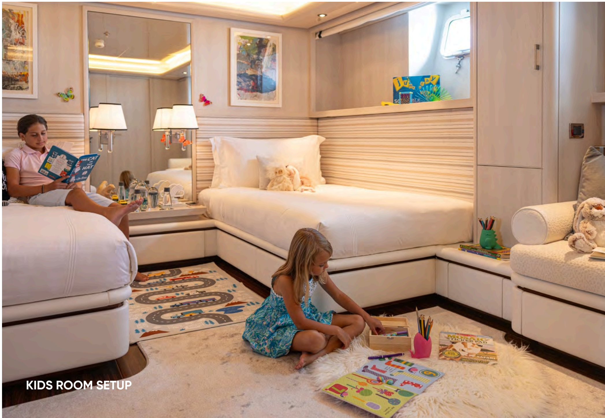
KIDS ROOM SETUP