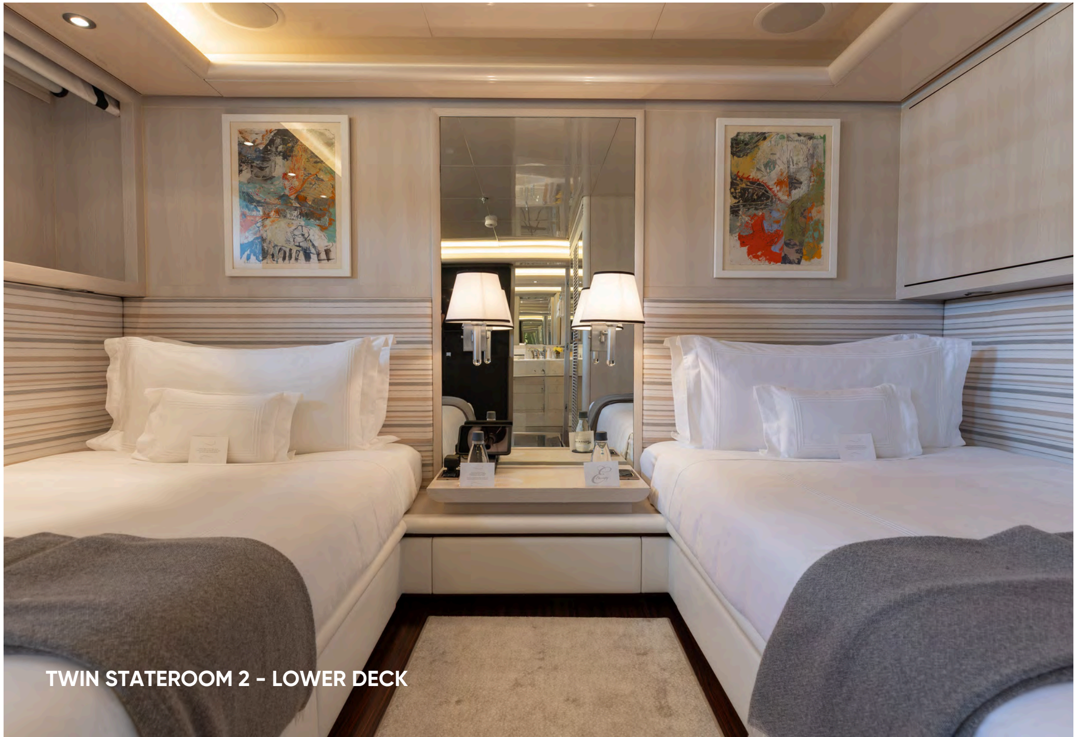
TWIN STATEROOM 2 - LOWER DECK