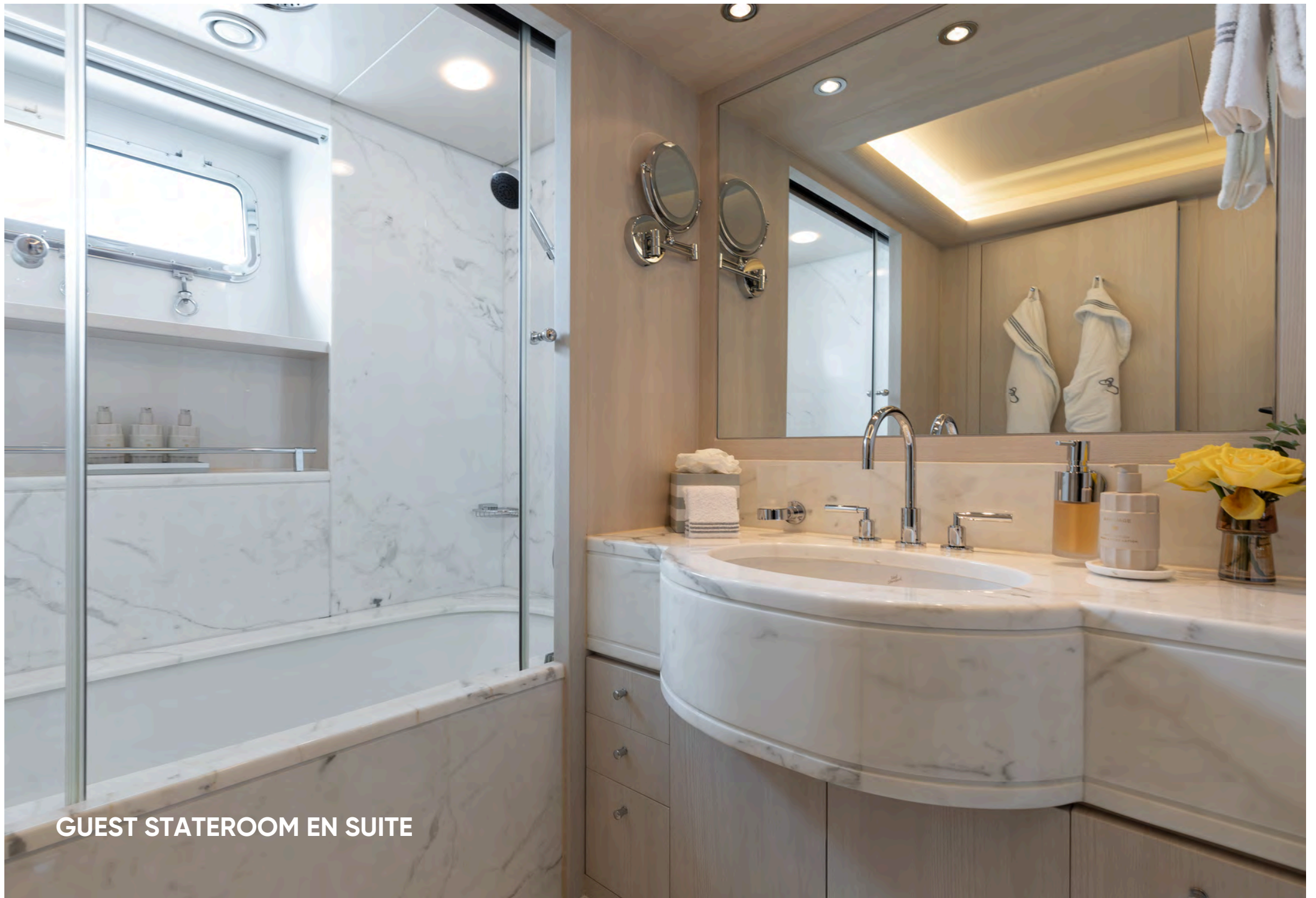
GUEST STATEROOM EN SUITE