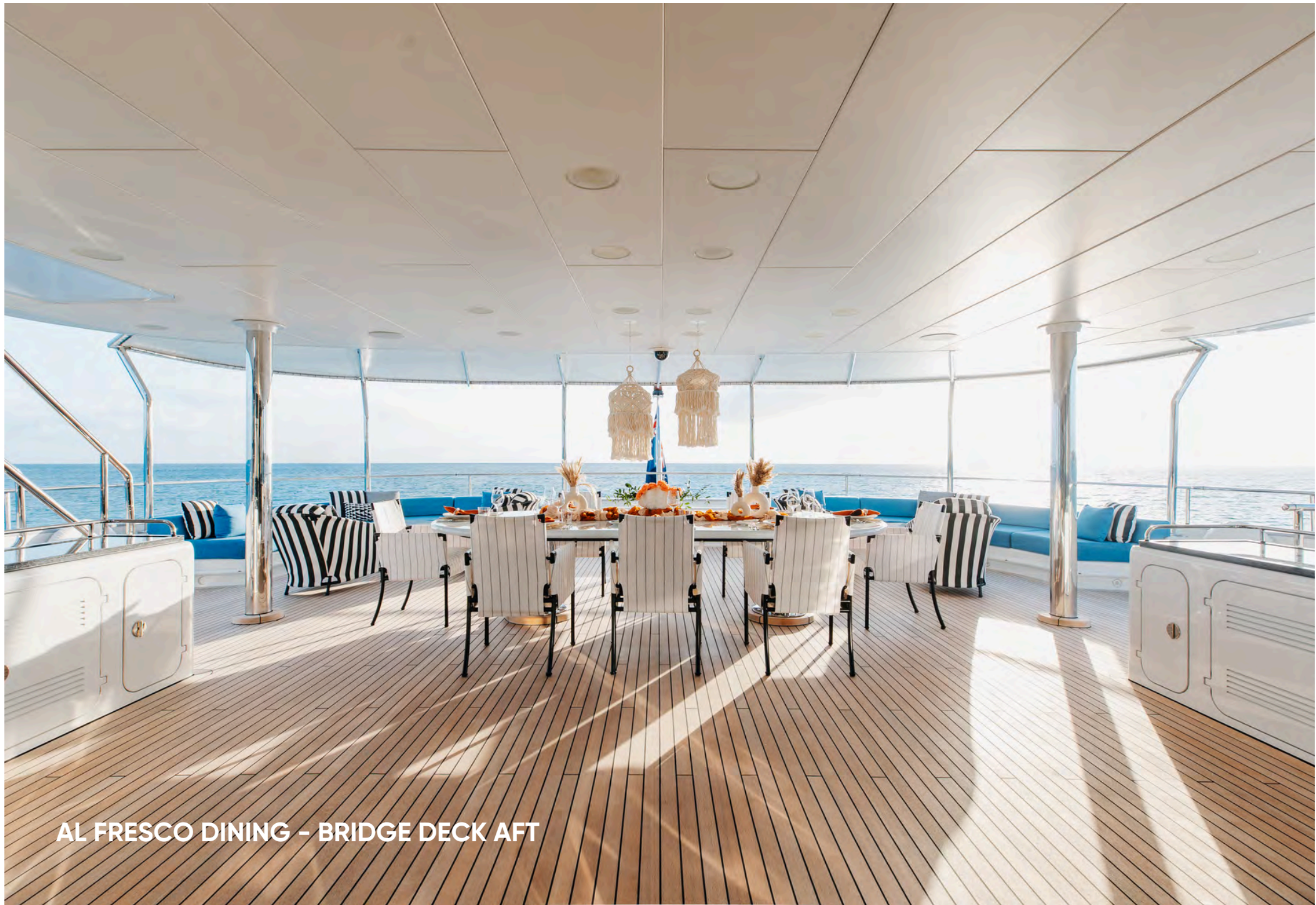
AL FRESCO DINING - BRIDGE DECK AFT