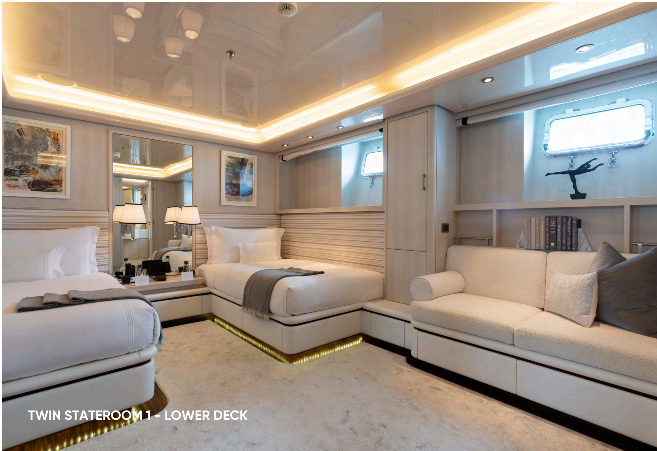
TWIN STATEROOM 1 - LOWER DECK