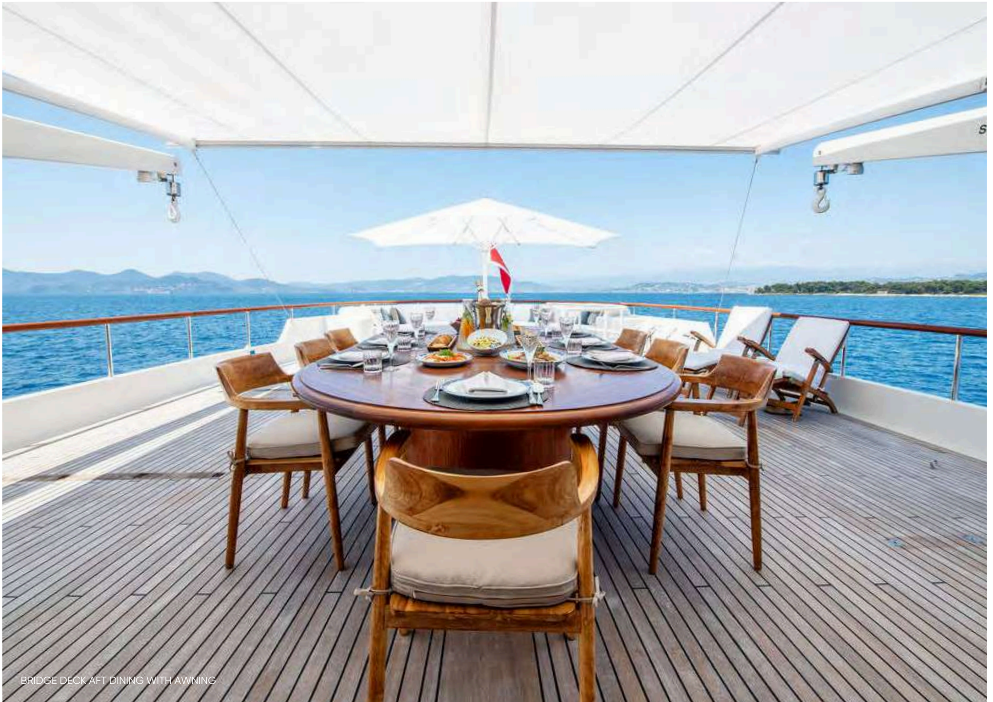
BRIDGE DECK AFT DINING WITH AWNING