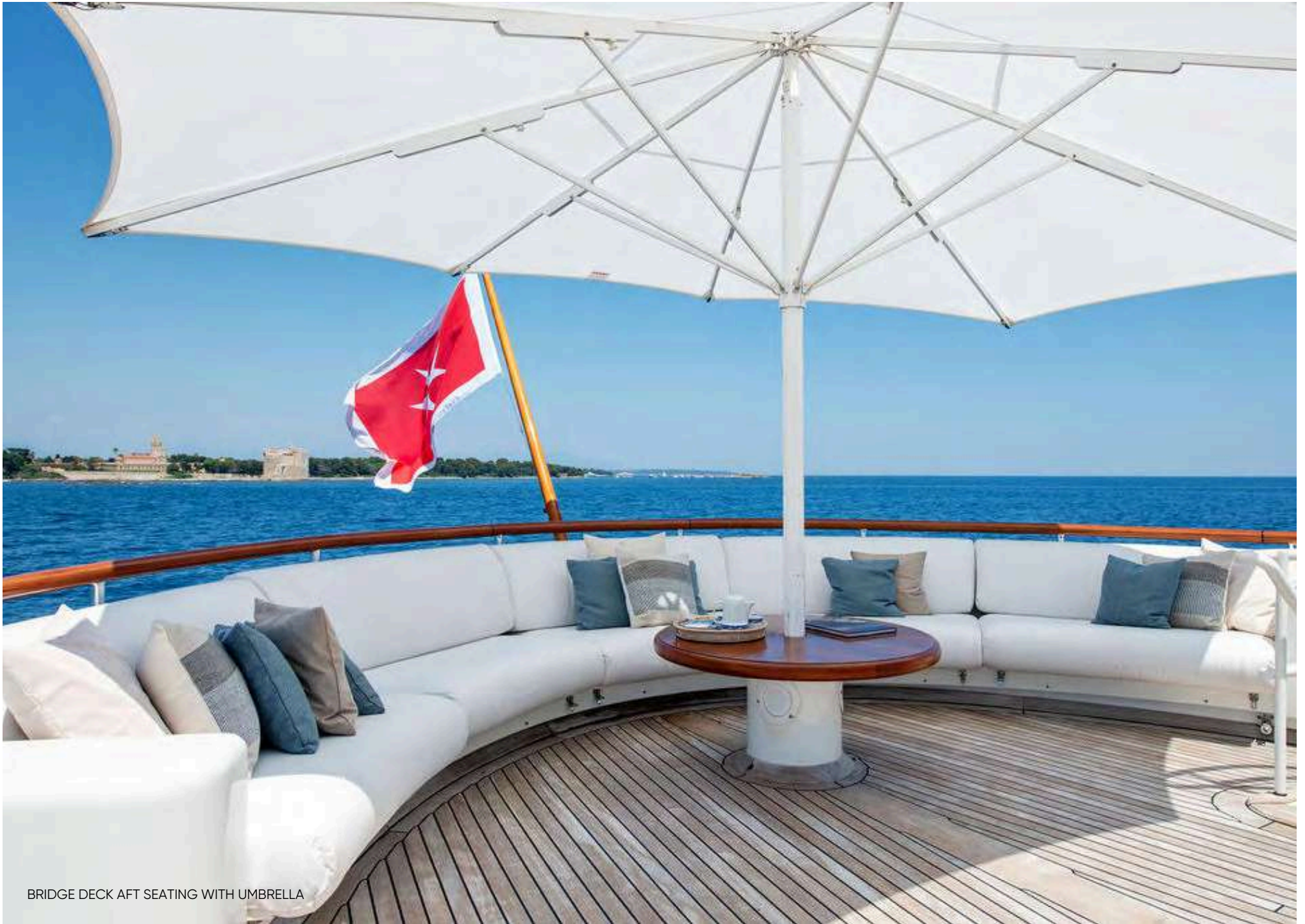
BRIDGE DECK AFT SEATING WITH UMBRELLA