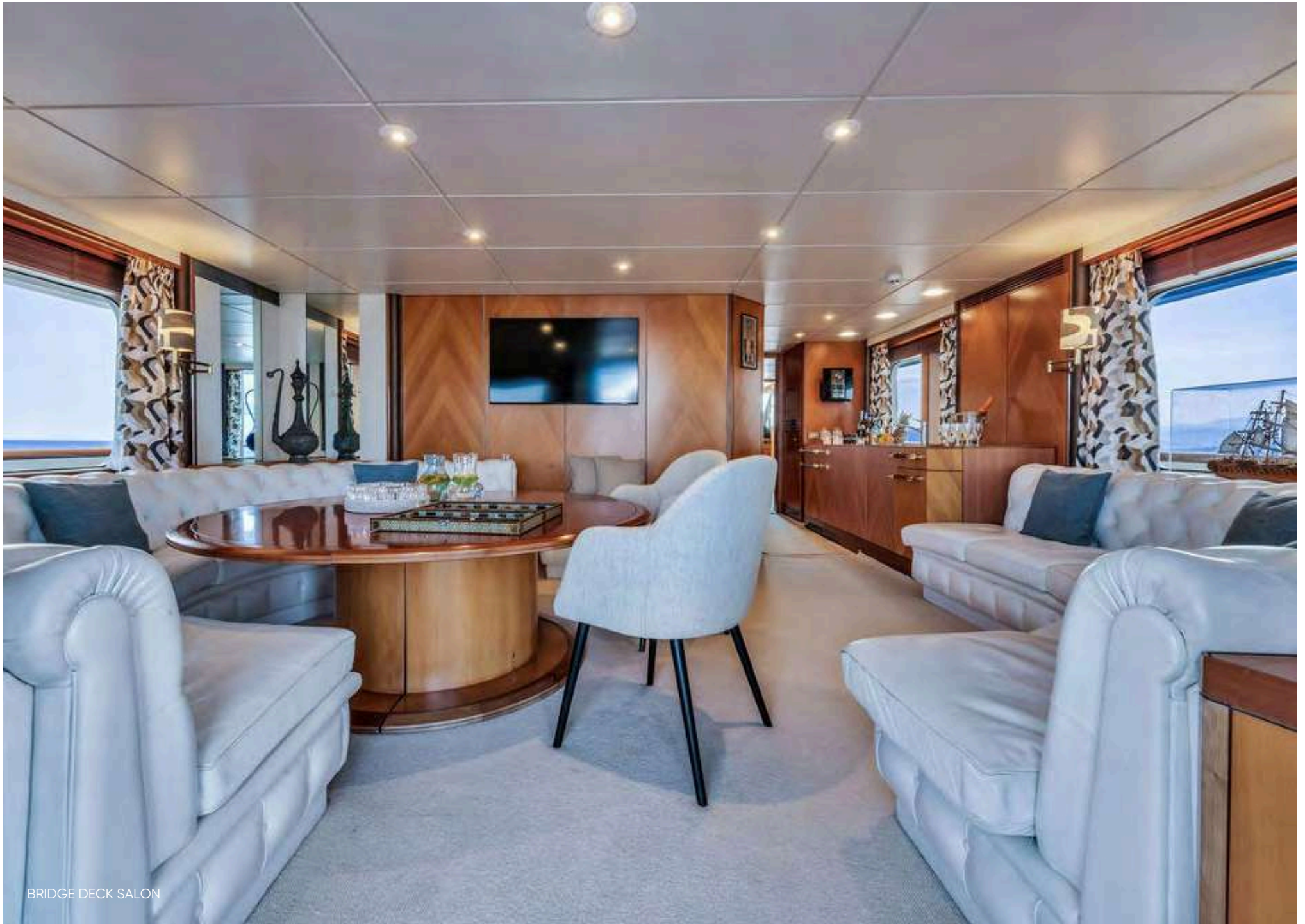
BRIDGE DECK SALON