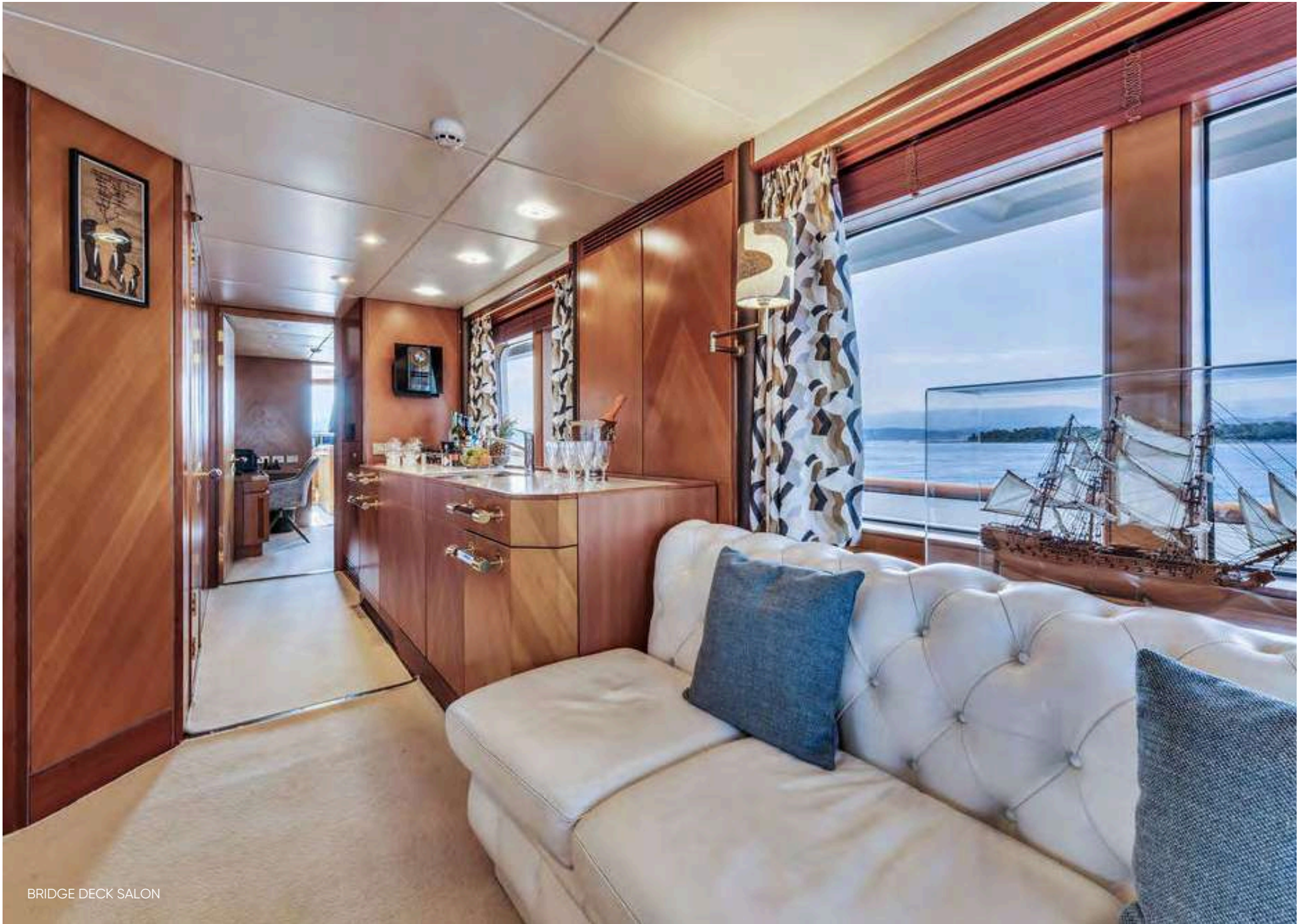
BRIDGE DECK SALON