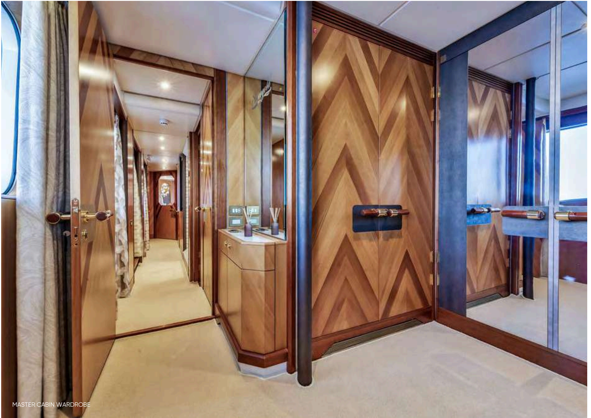
MASTER CABIN WARDROBE