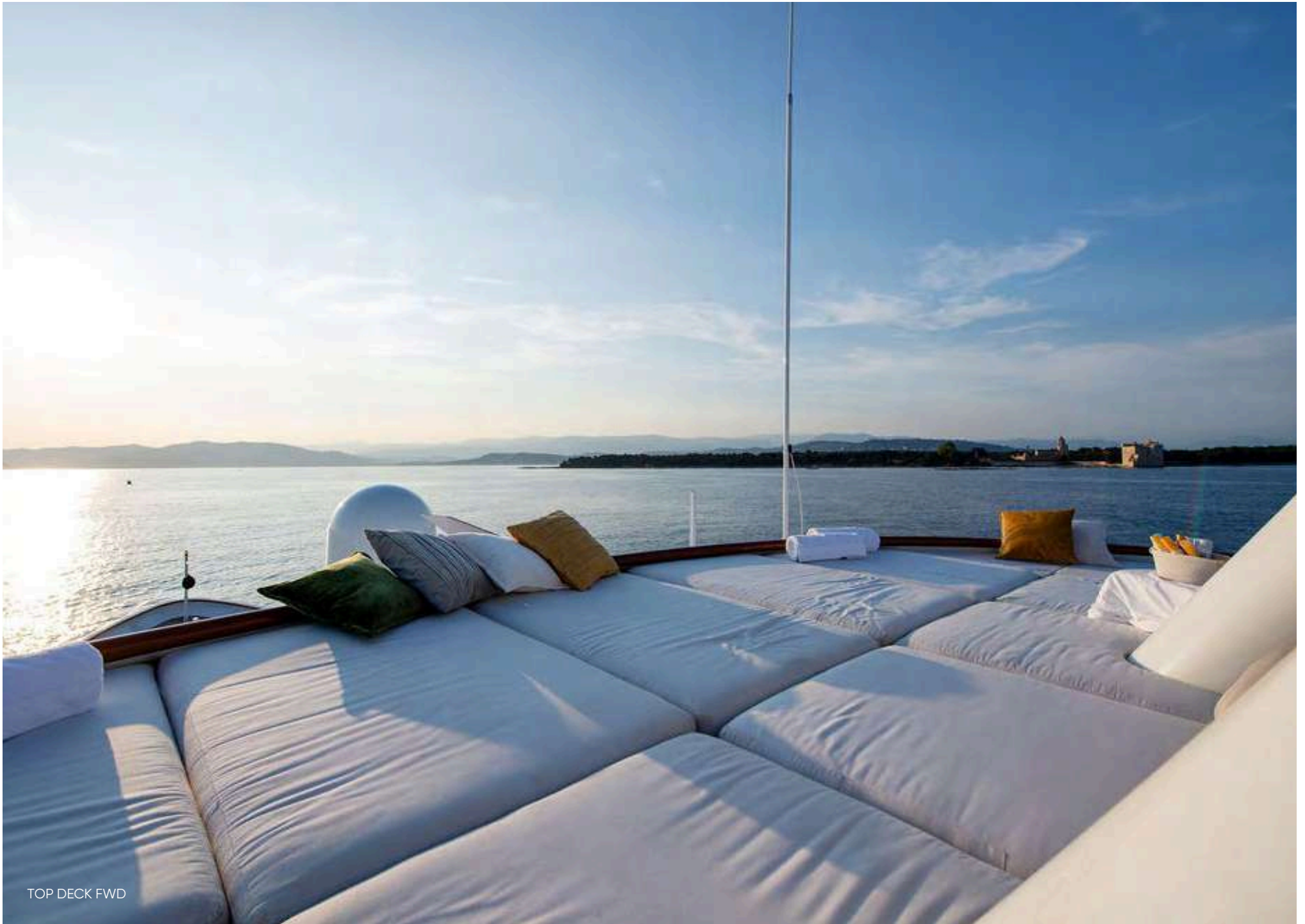
TOP DECK FWD