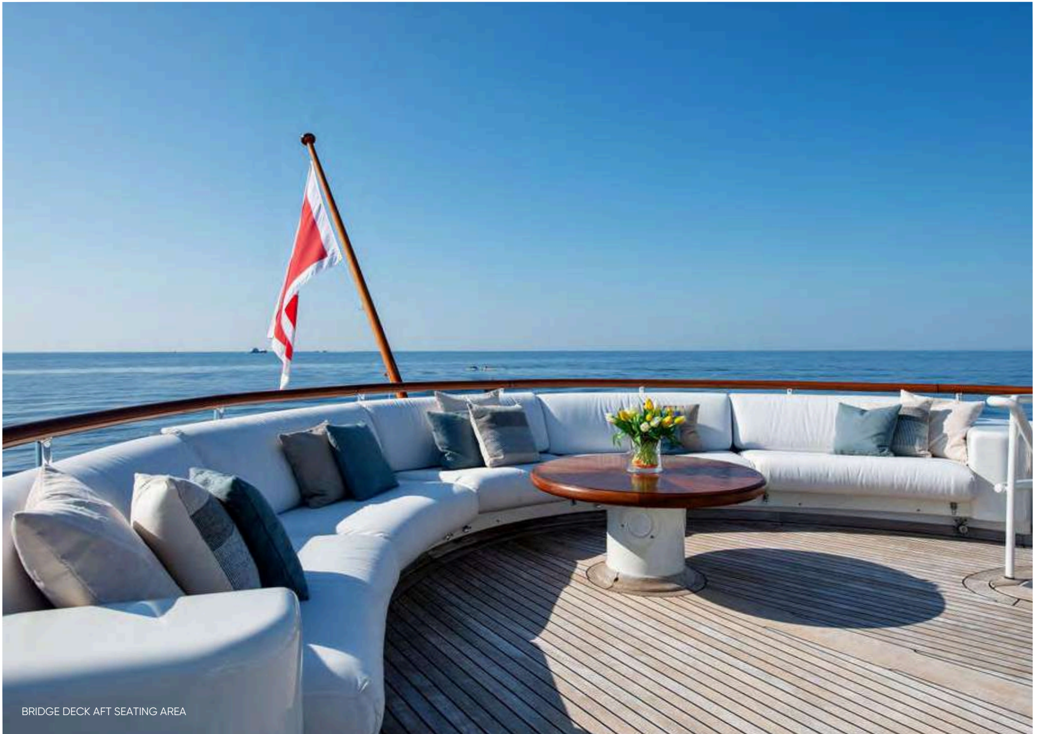
BRIDGE DECK AFT SEATING AREA