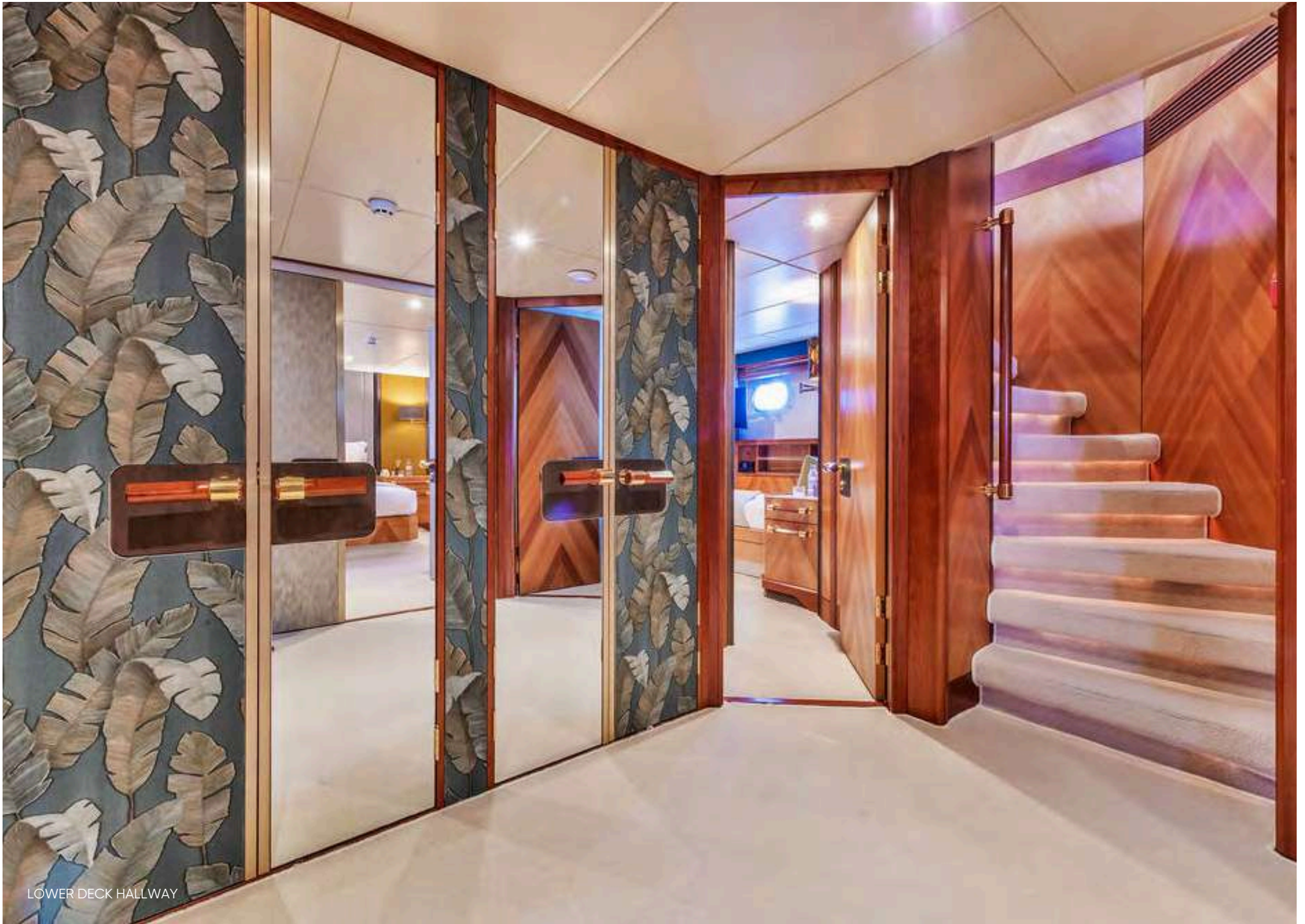
LOWER DECK HALLWAY