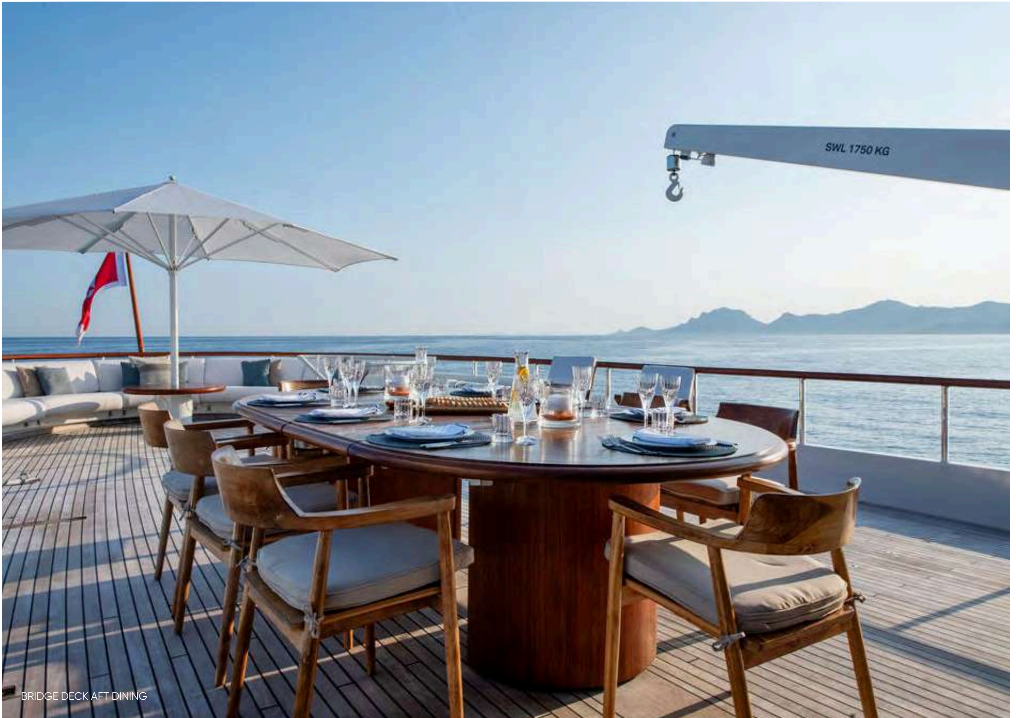
BRIDGE DECK AFT DINING