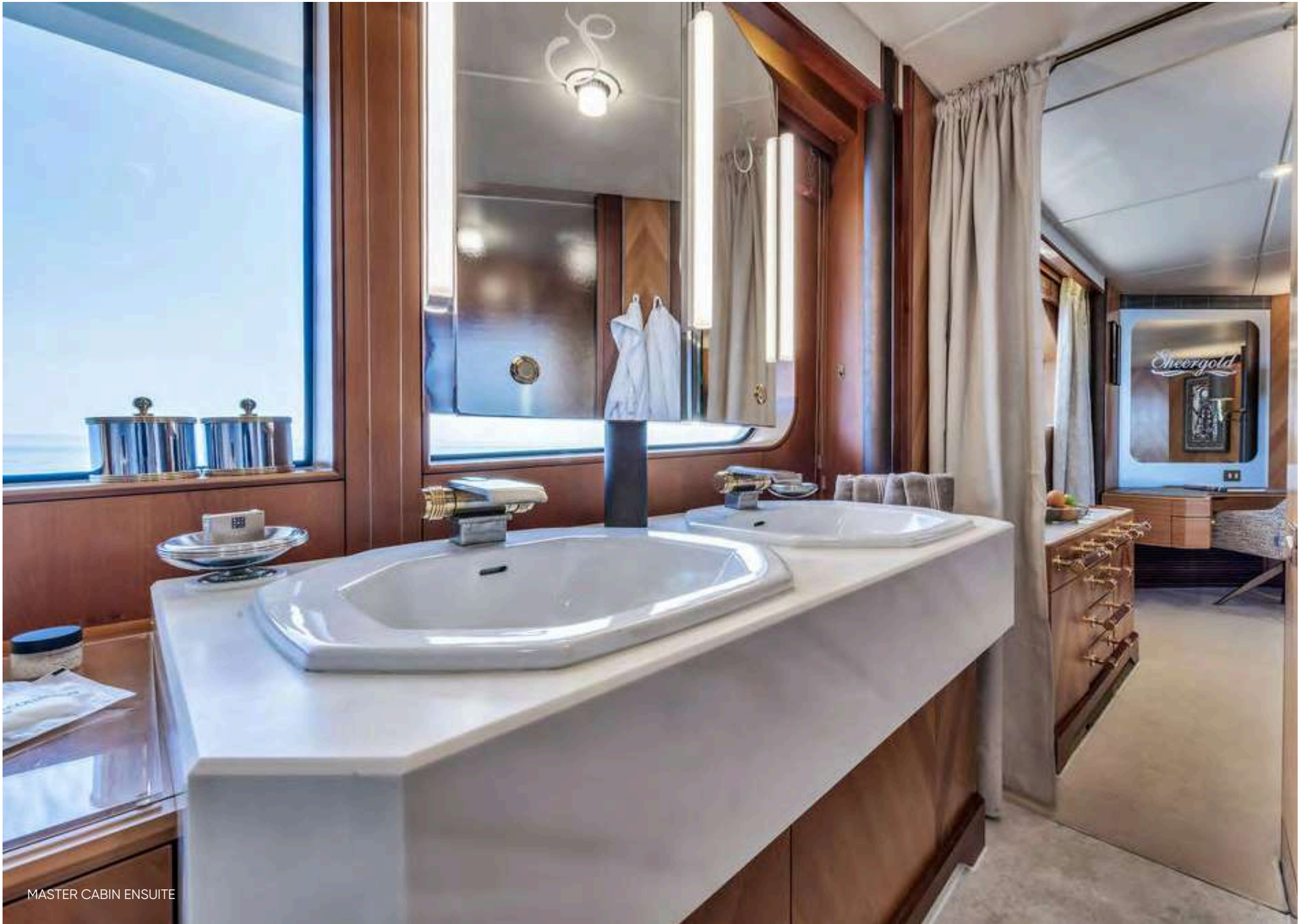
MASTER CABIN ENSUITE