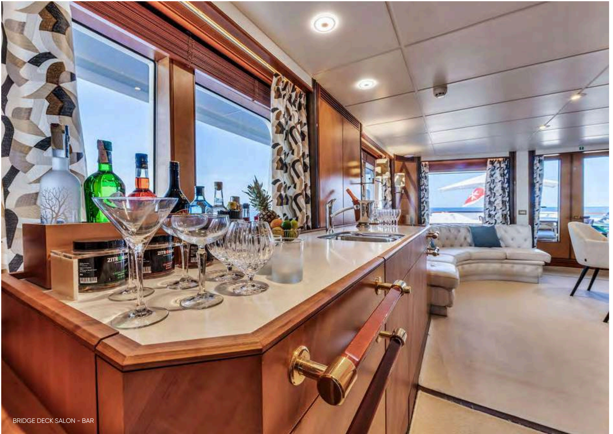
BRIDGE DECK SALON - BAR