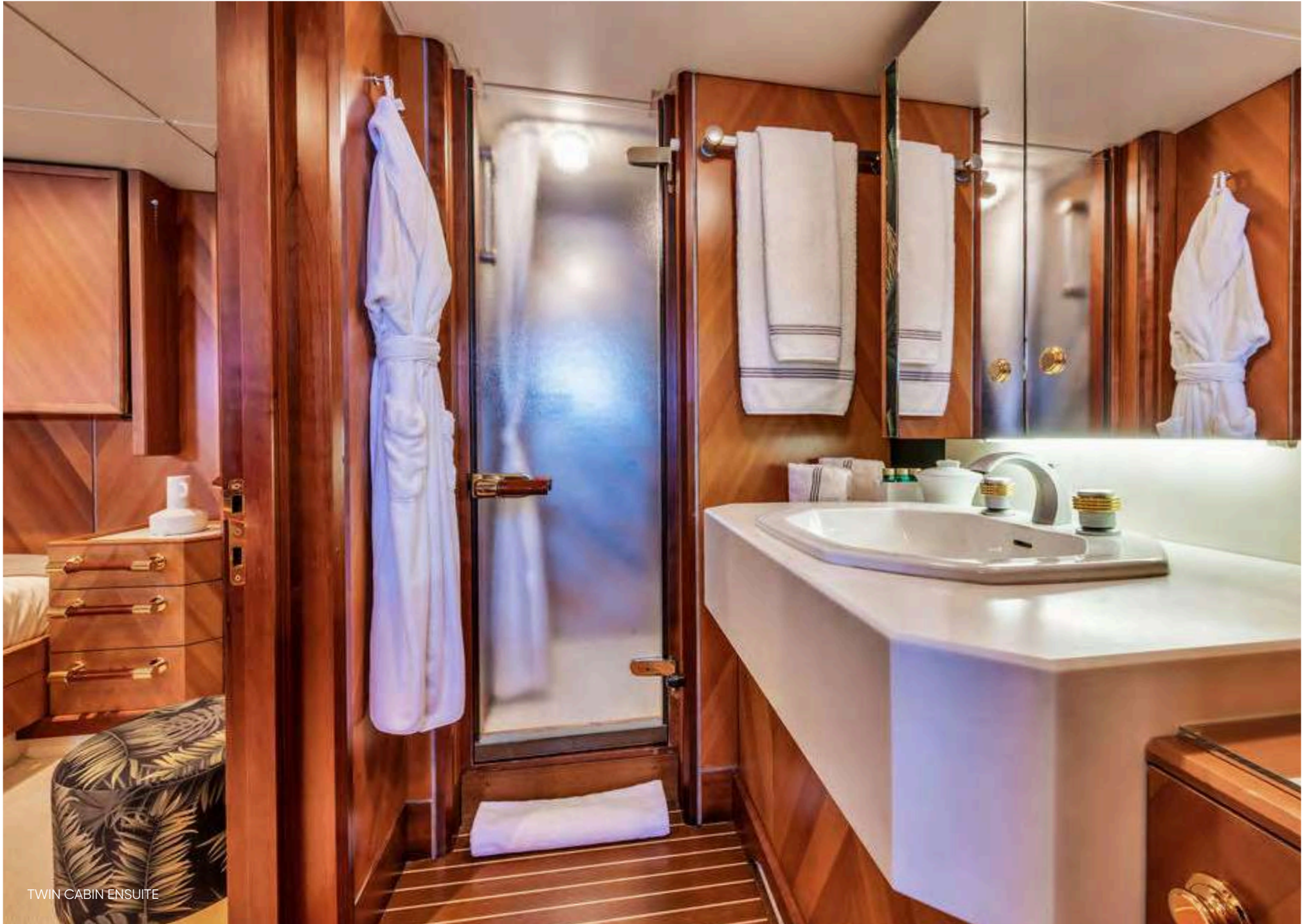
TWIN CABIN ENSUITE