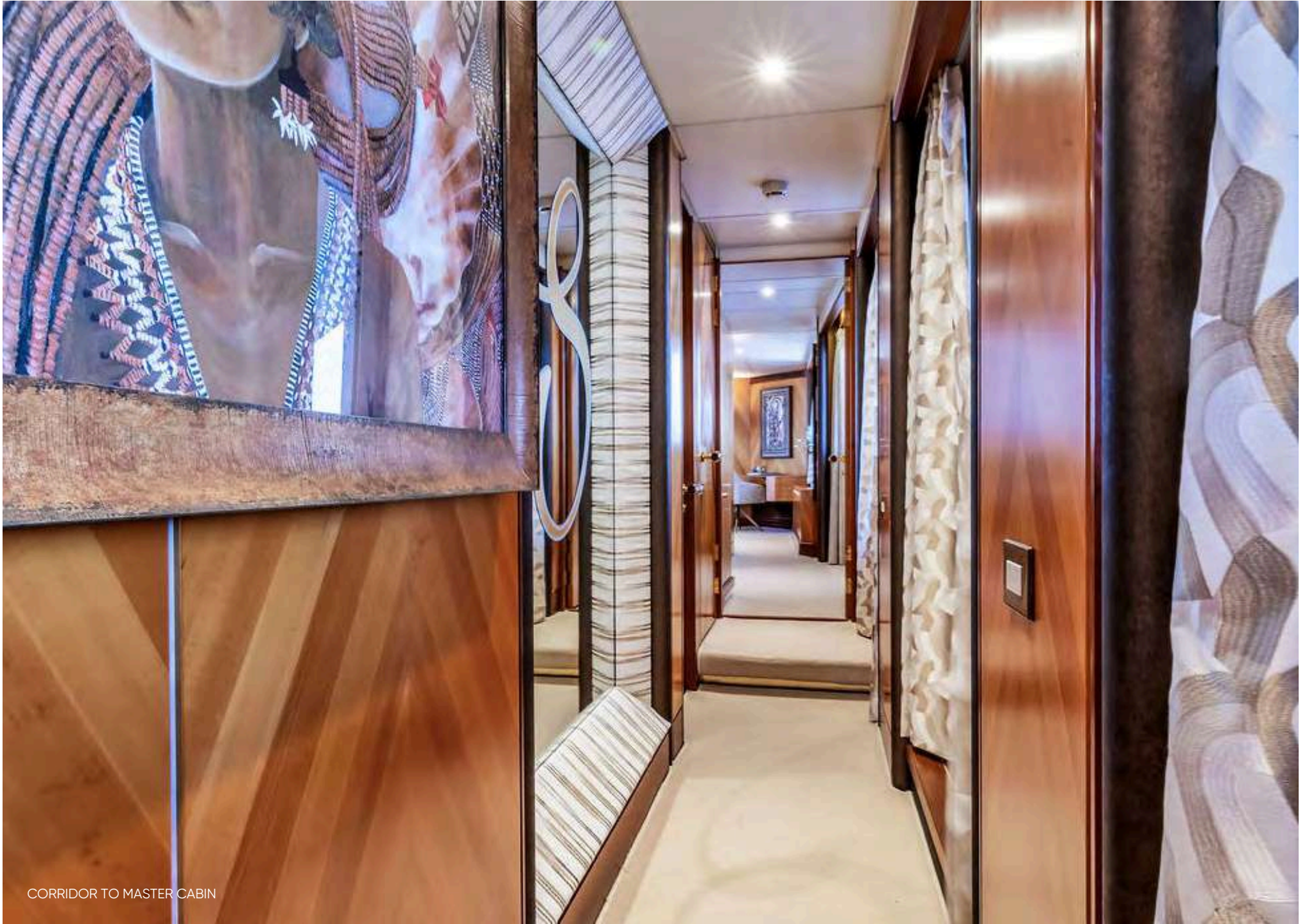
CORRIDOR TO MASTER CABIN