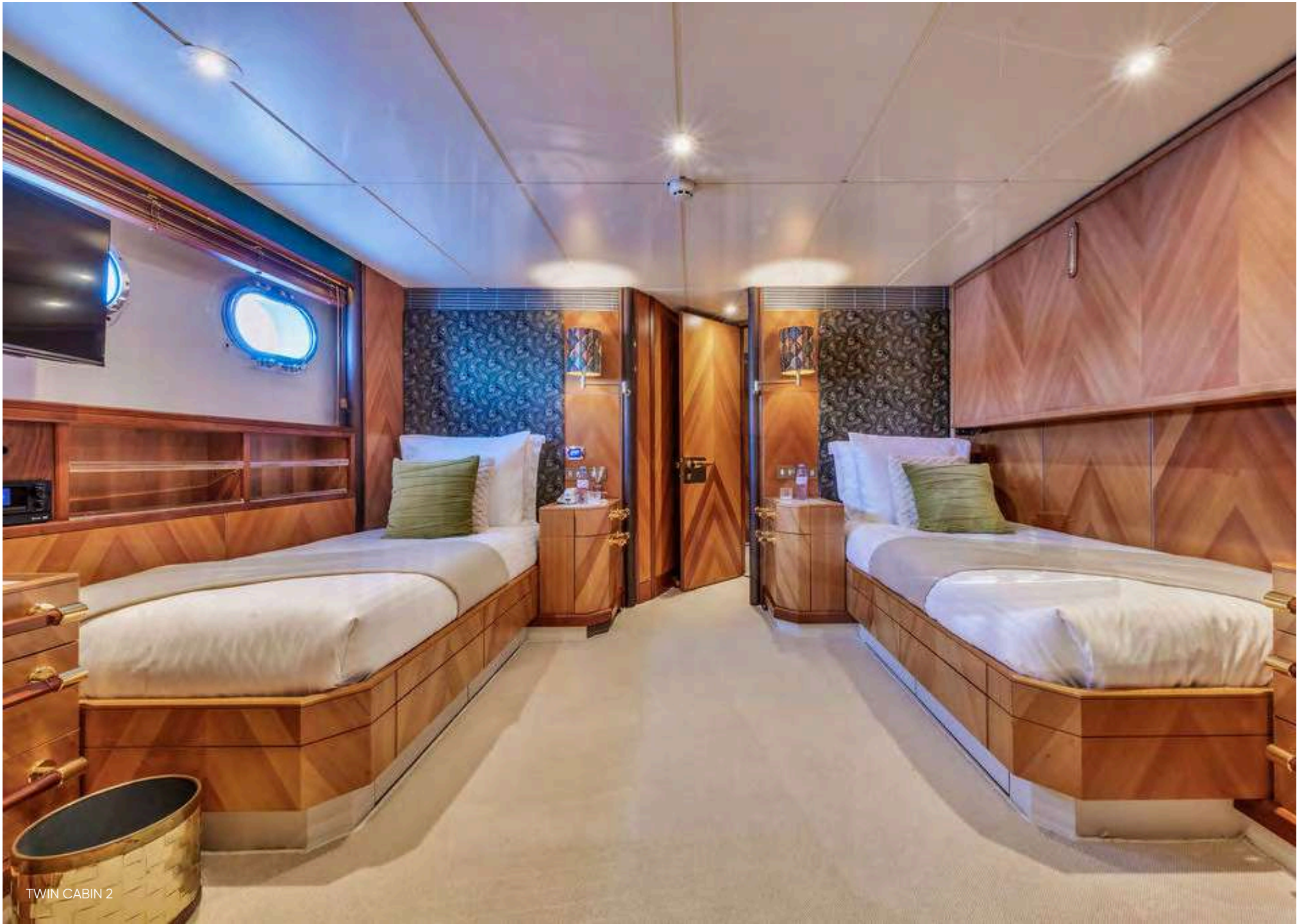
TWIN CABIN 2