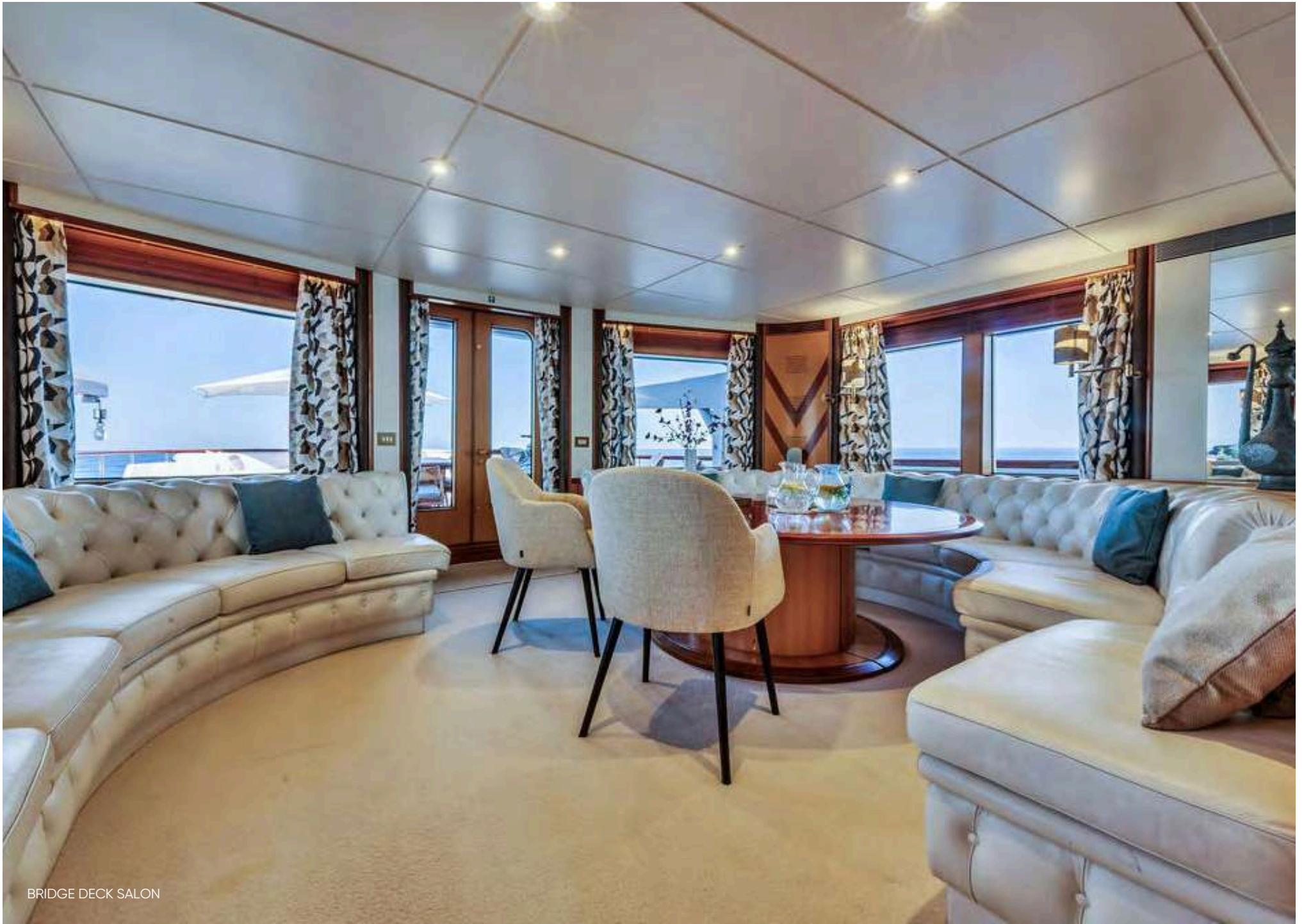
BRIDGE DECK SALON