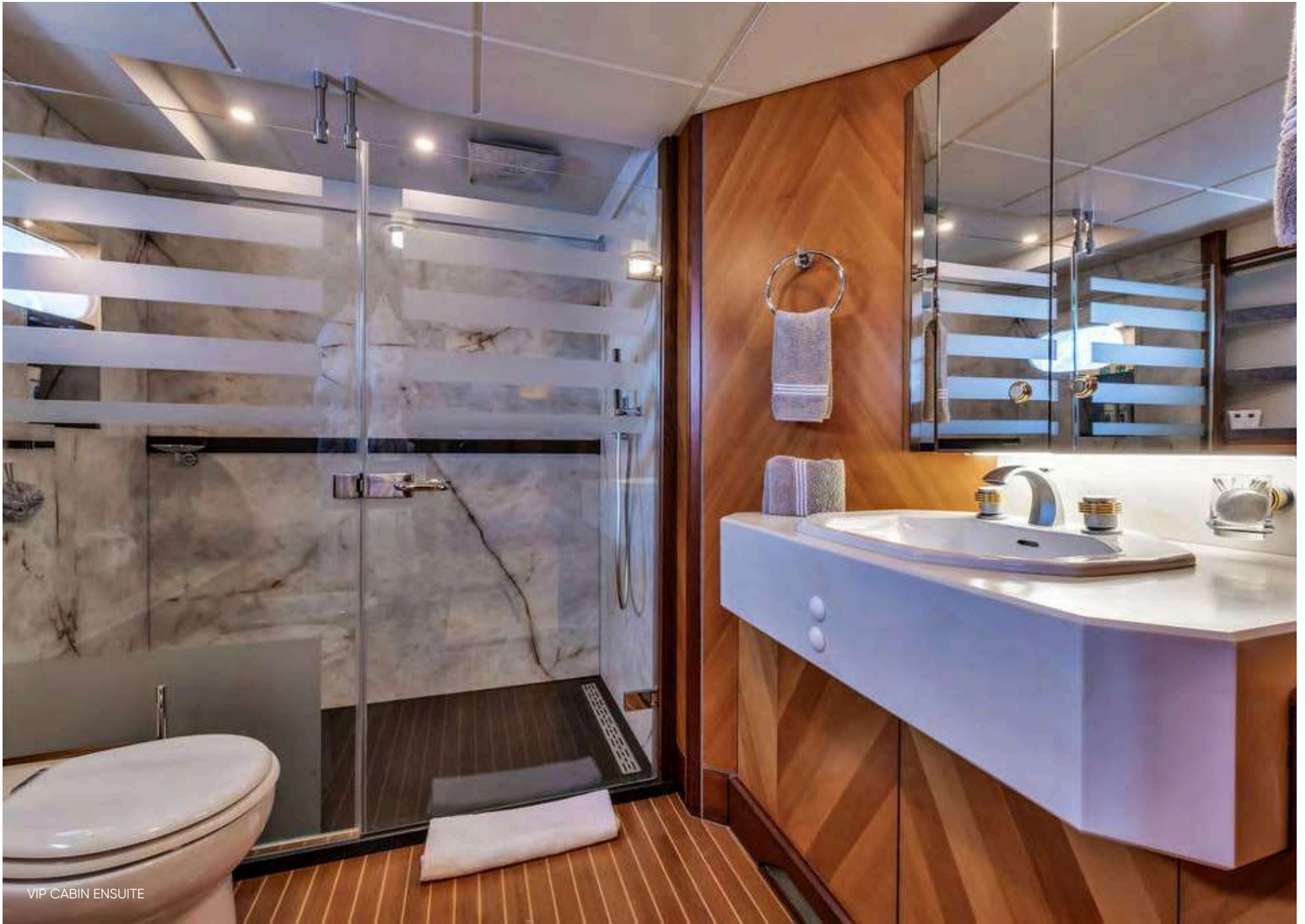
VIP CABIN ENSUITE