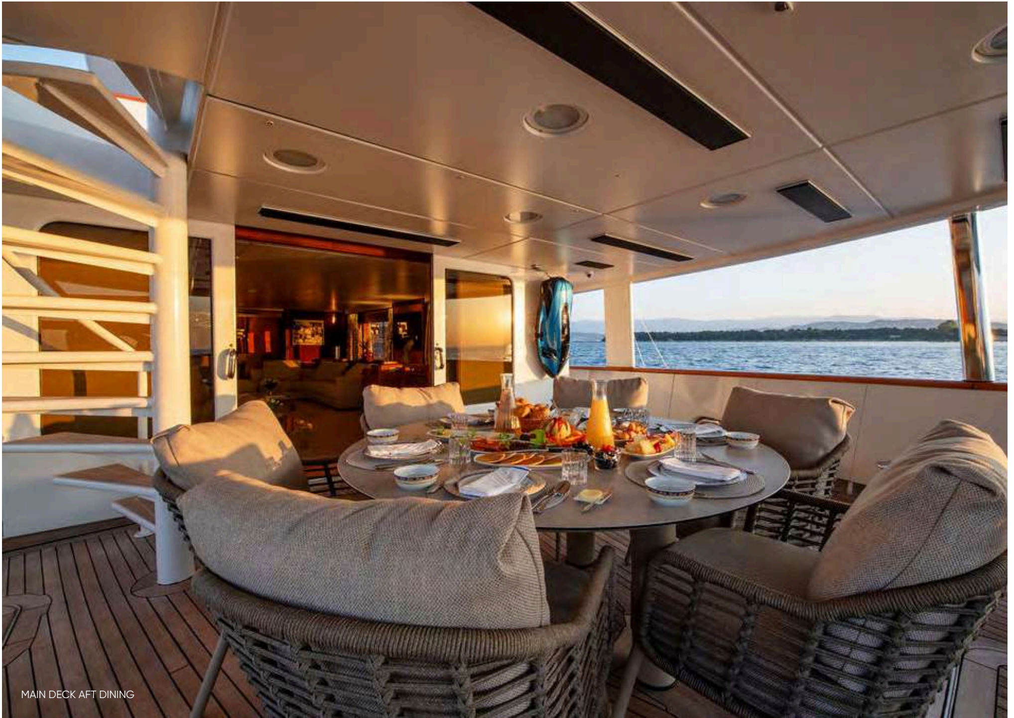
MAIN DECK AFT DINING