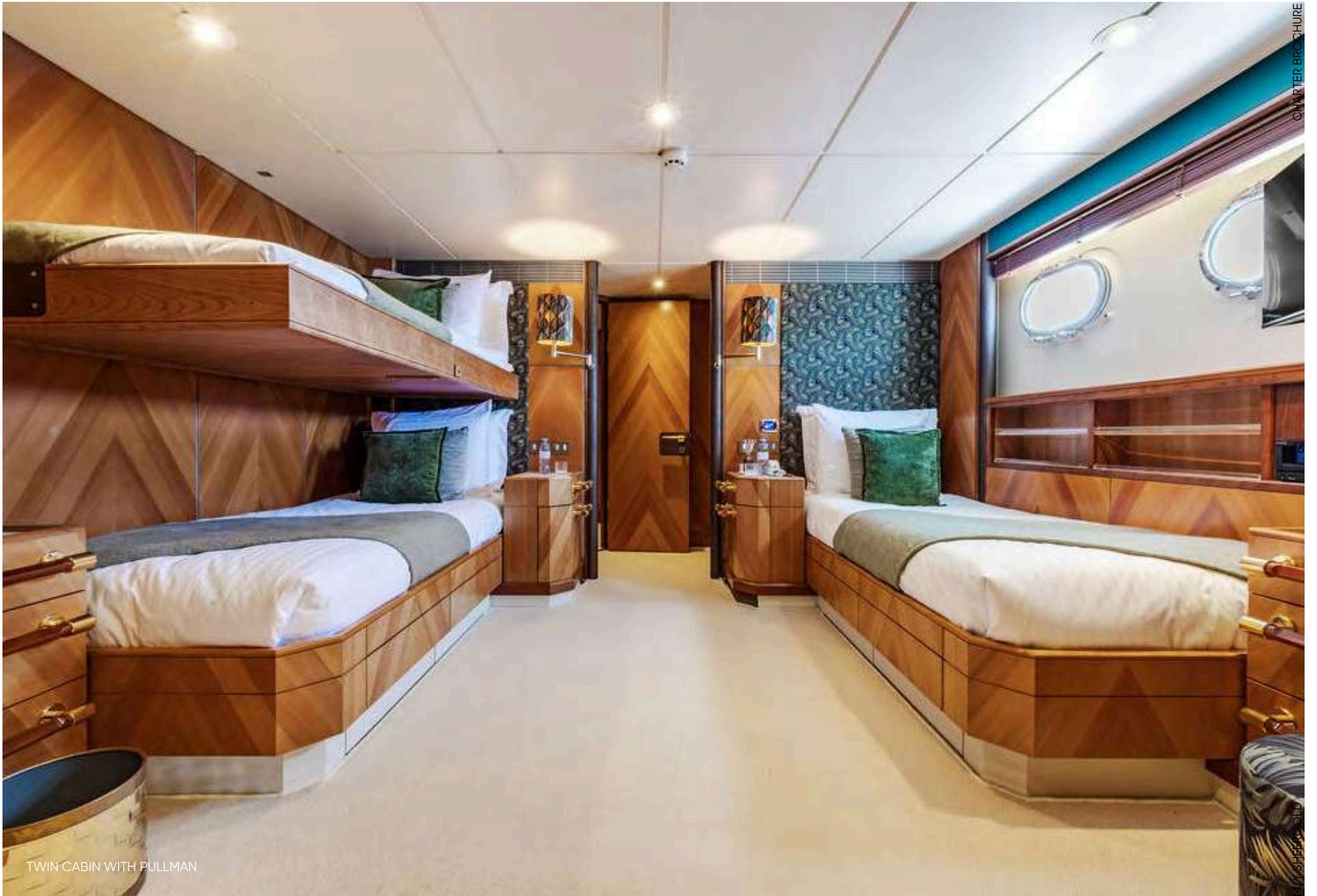
TWIN CABIN WITH PULLMAN