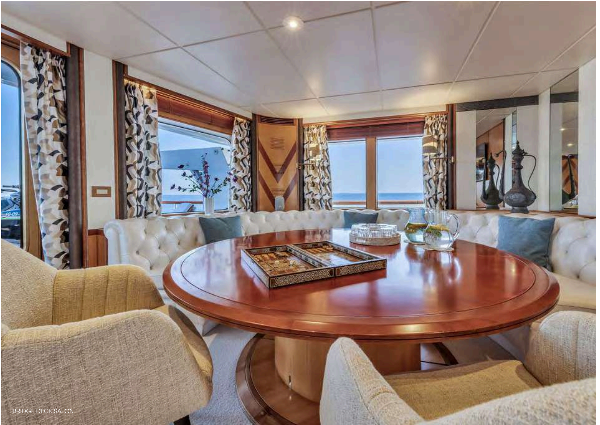
BRIDGE DECK SALON