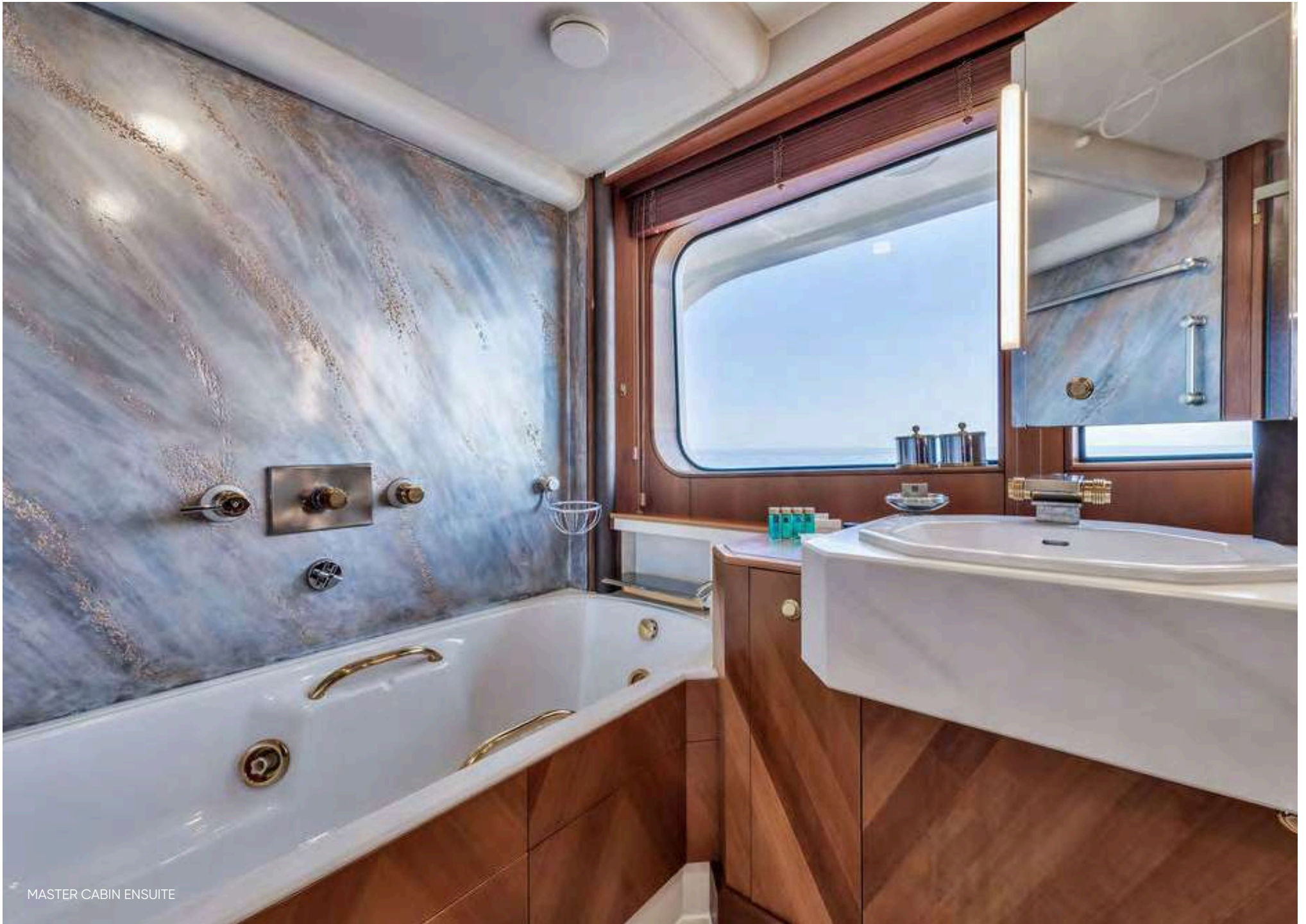
MASTER CABIN ENSUITE