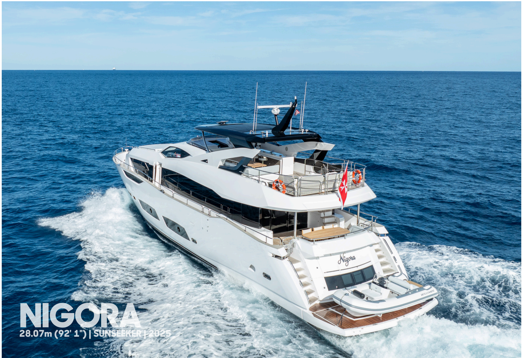
NIGORA 28.07m (92' 1") | SUNSEEKER | 2025