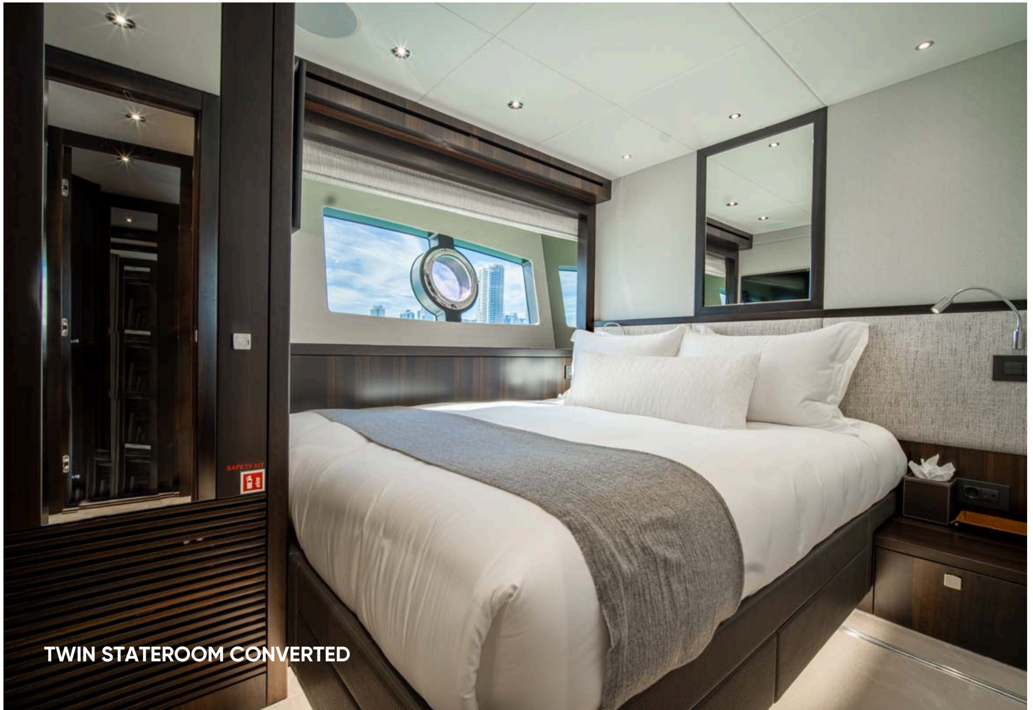
TWIN STATEROOM CONVERTED