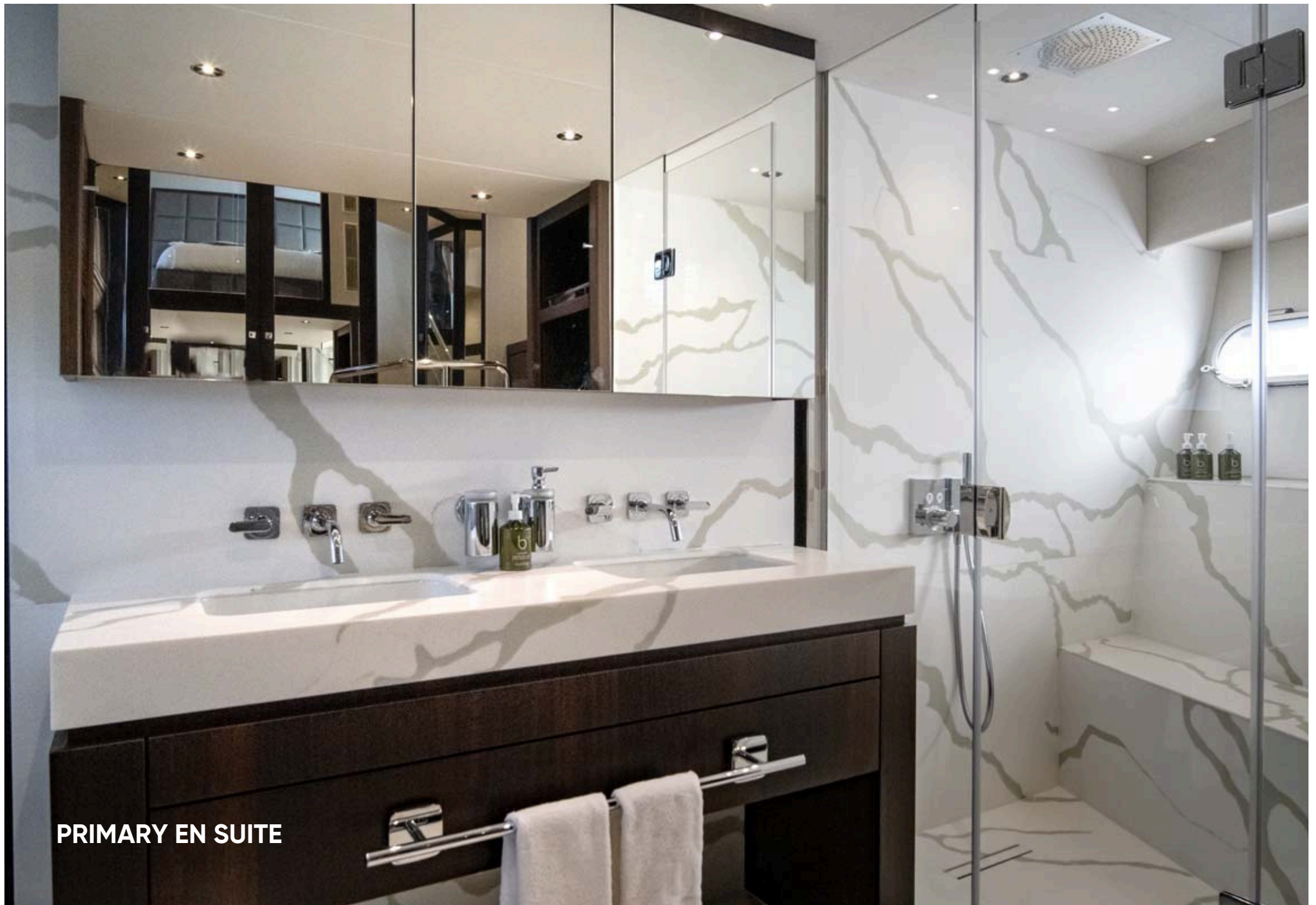
PRIMARY EN SUITE