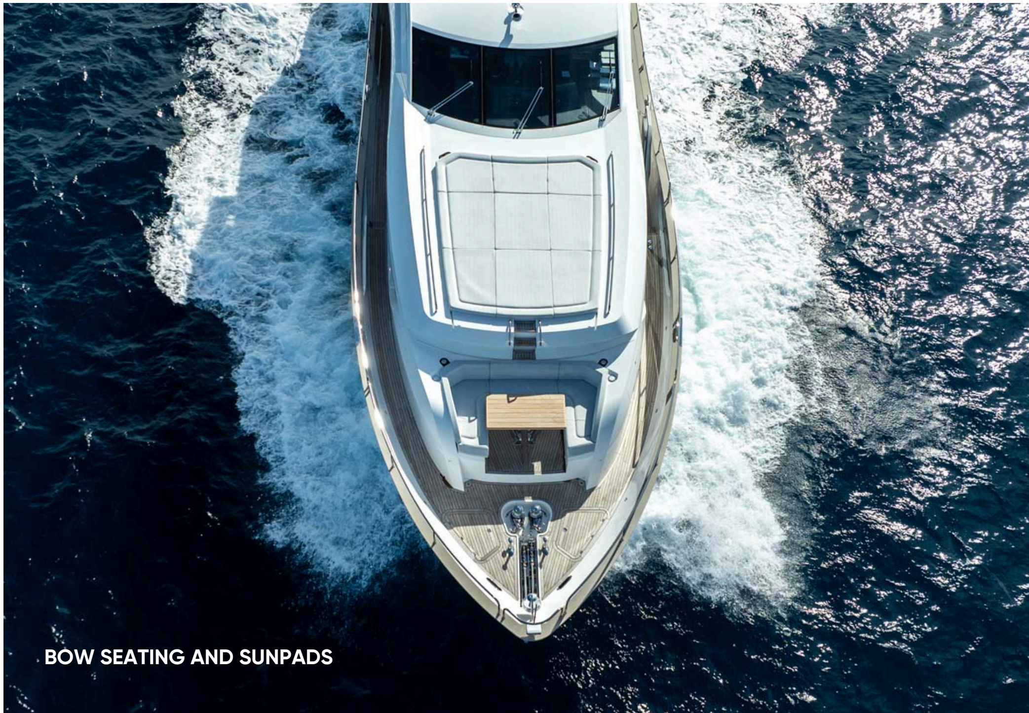
BOW SEATING AND SUNPADS