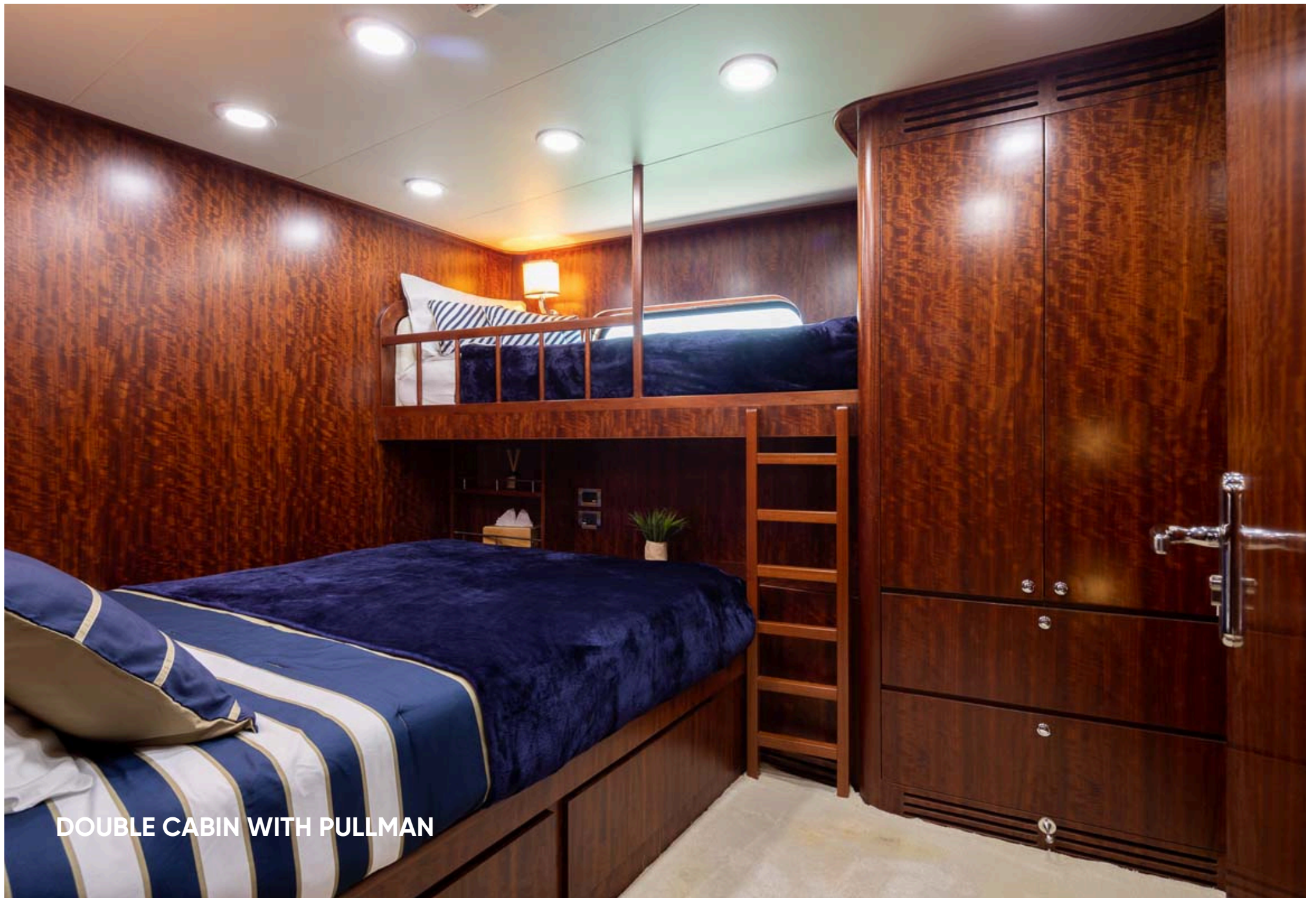
DOUBLE CABIN WITH PULLMAN