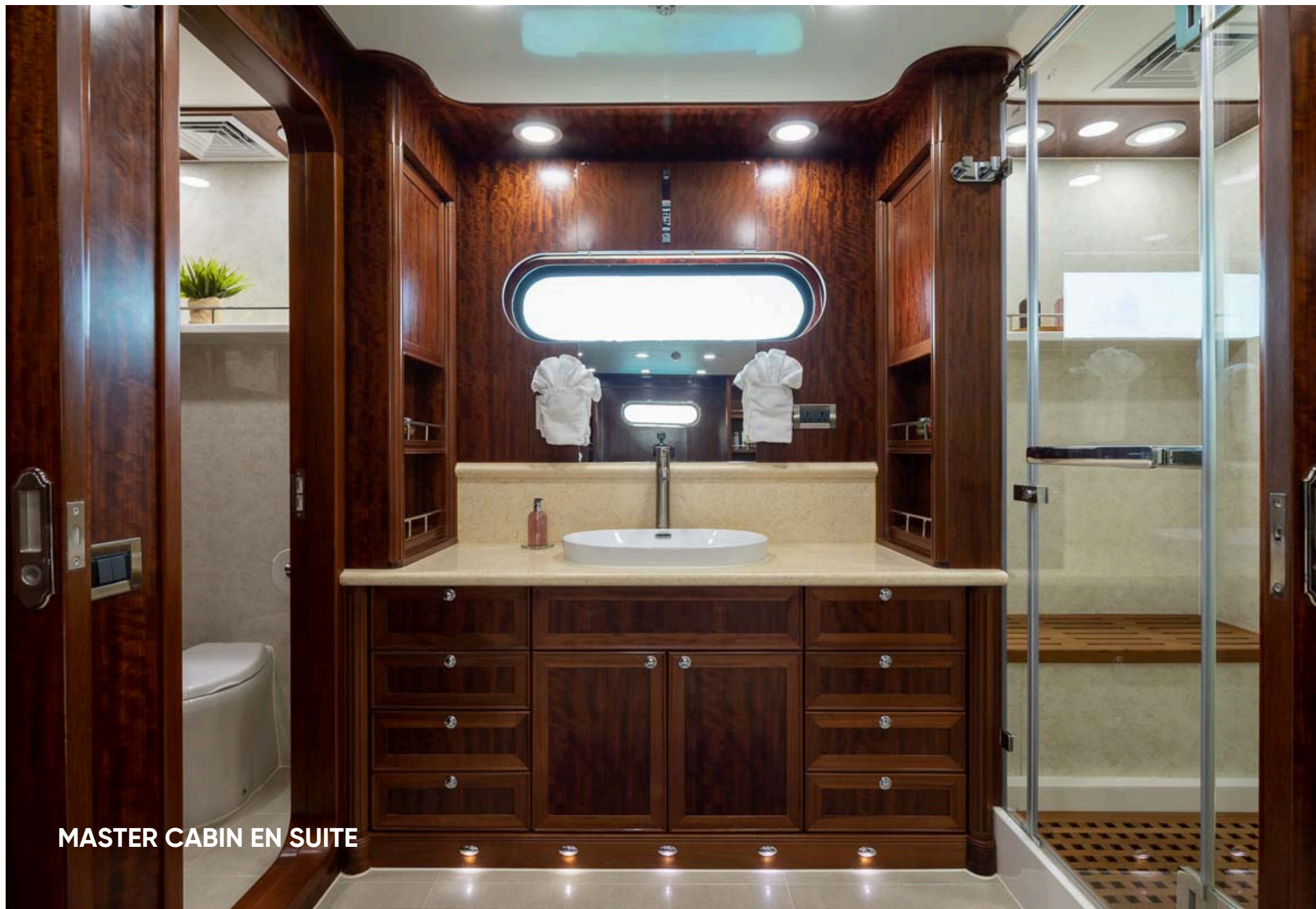
MASTER CABIN EN SUITE