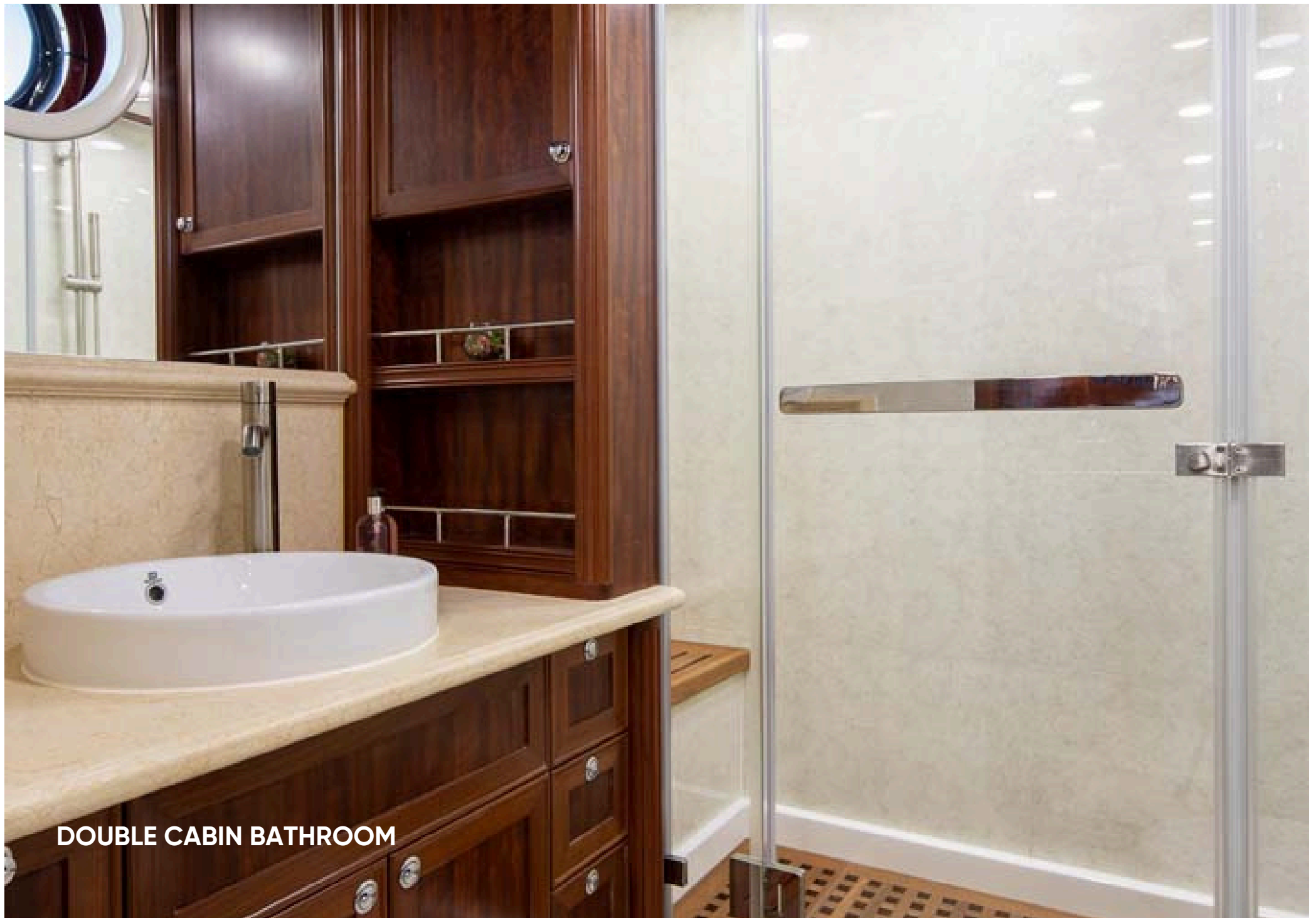
DOUBLE CABIN BATHROOM