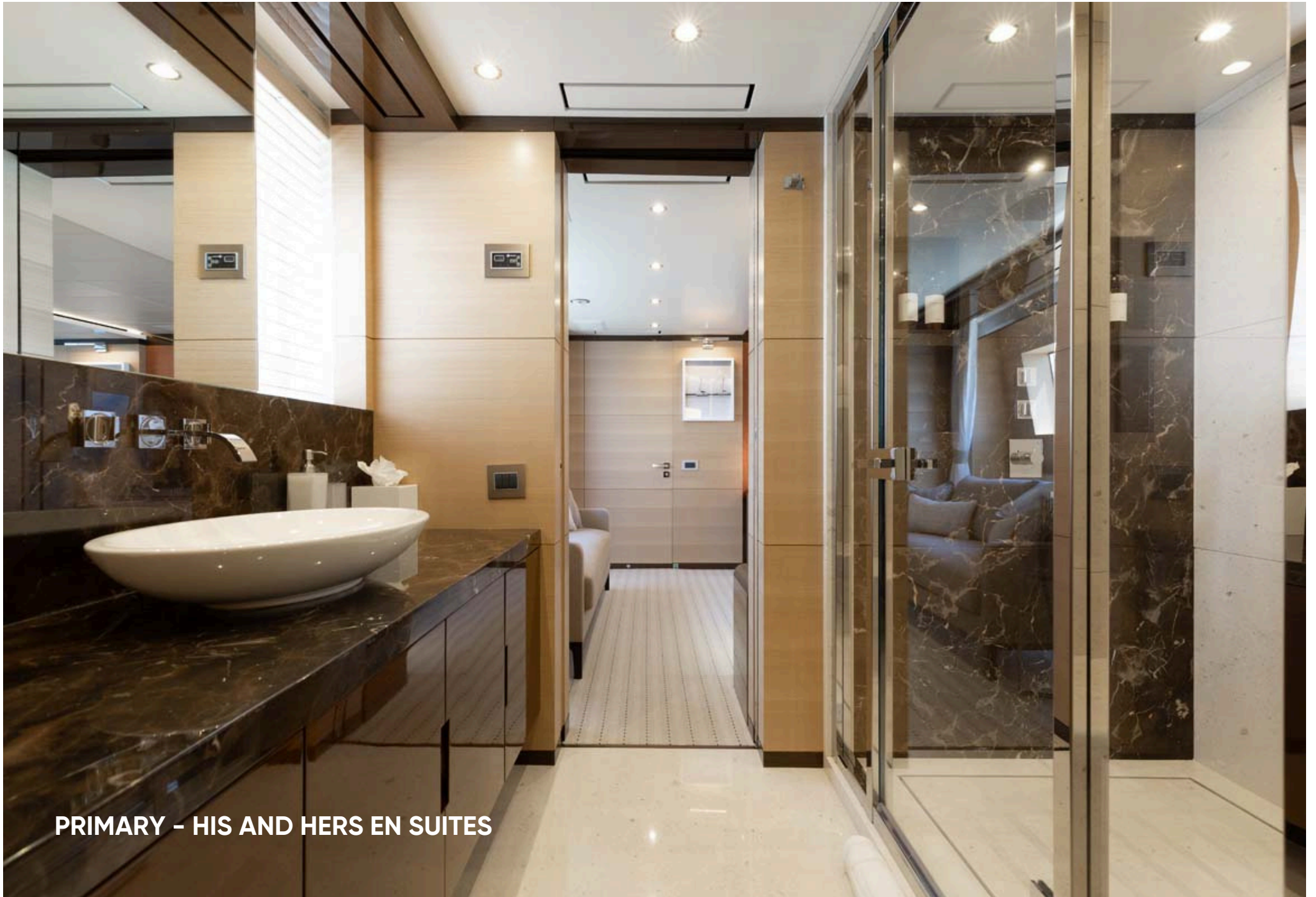
PRIMARY - HIS AND HERS EN SUITES