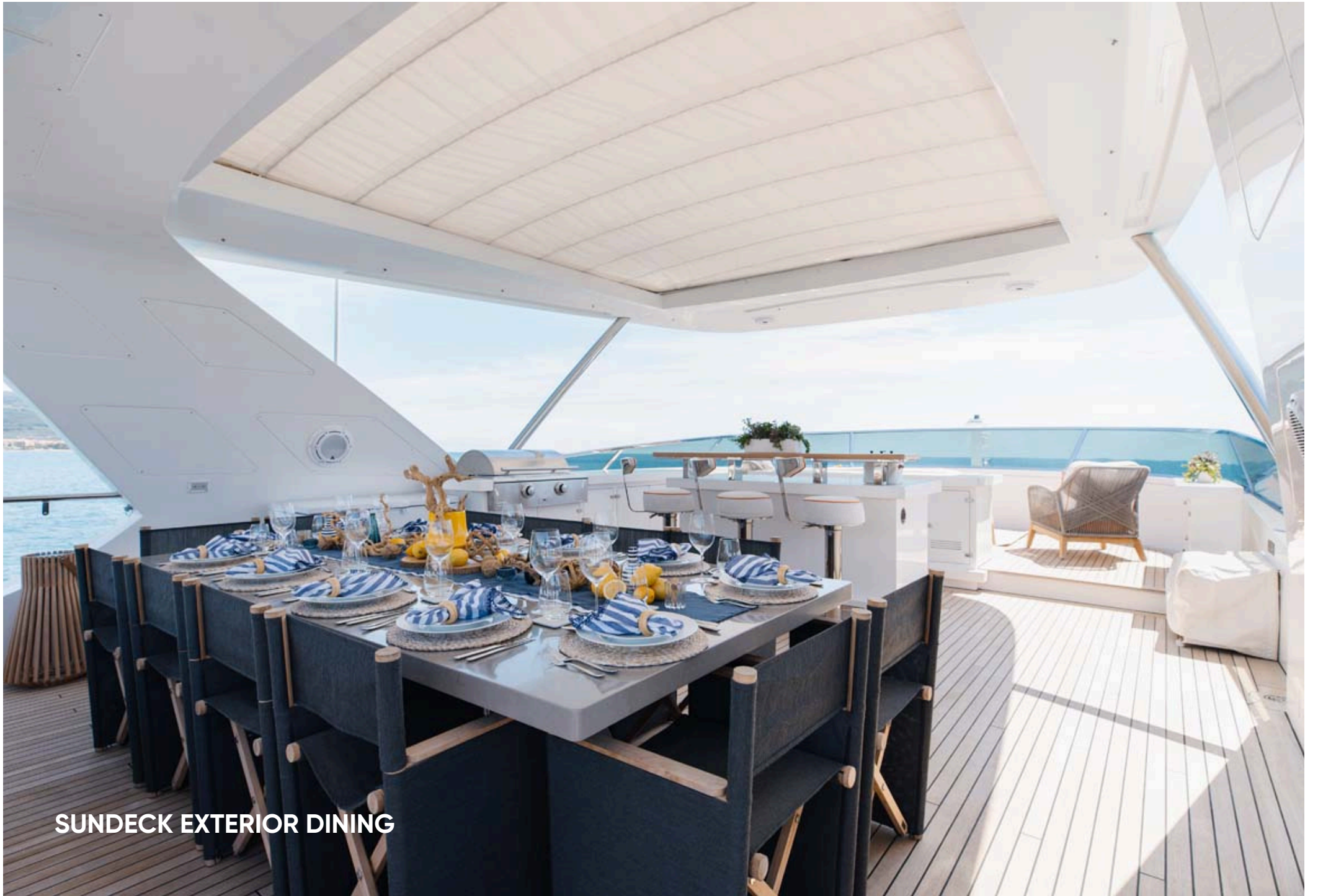
SUNDECK EXTERIOR DINING