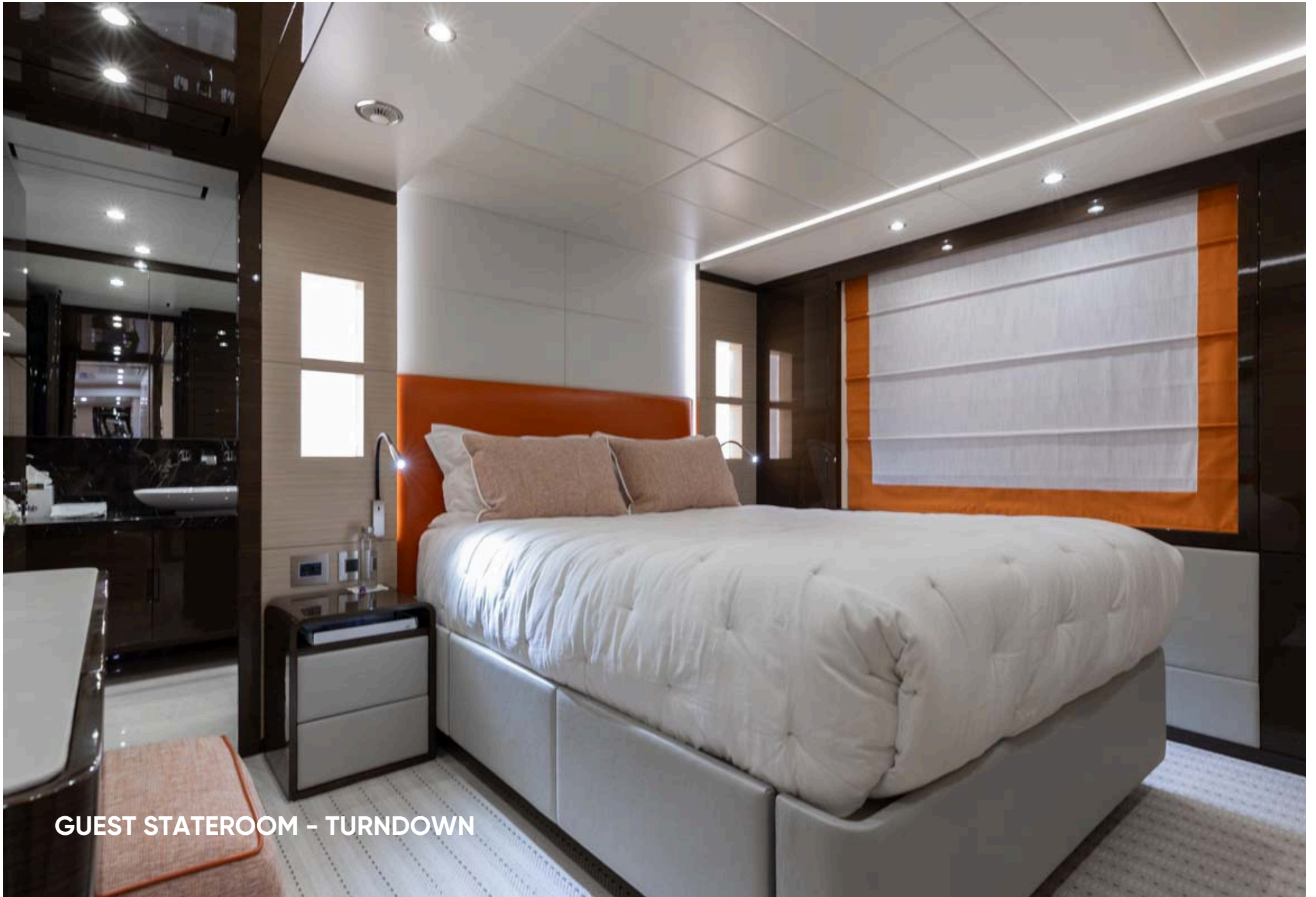
GUEST STATEROOM - TURNDOWN