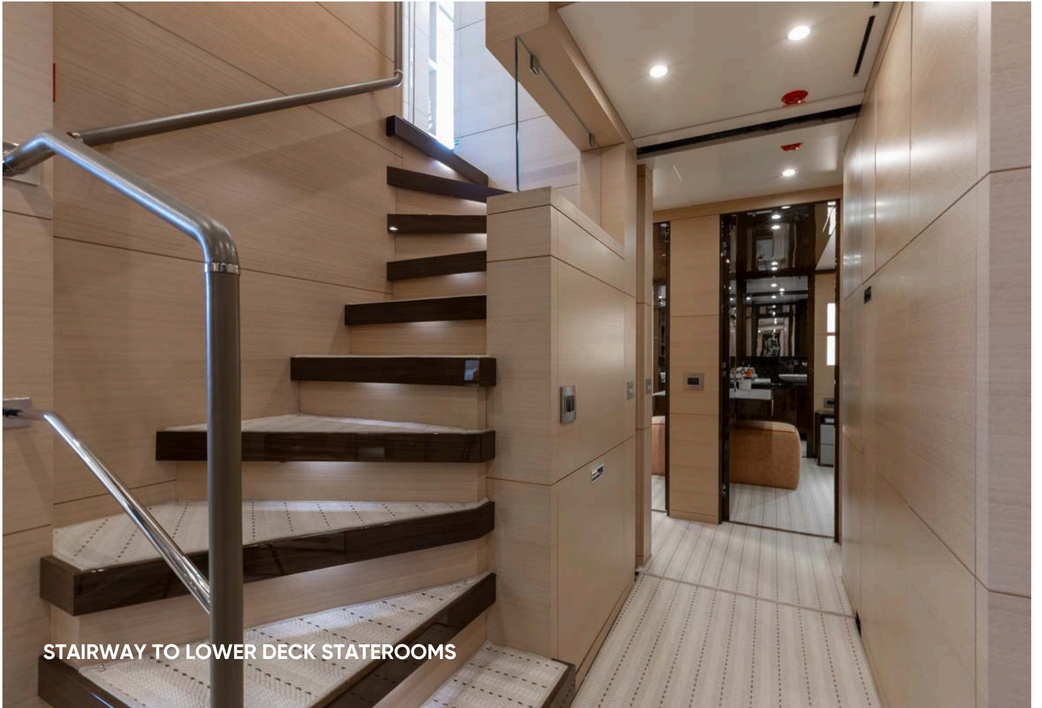
STAIRWAY TO LOWER DECK STATEROOMS