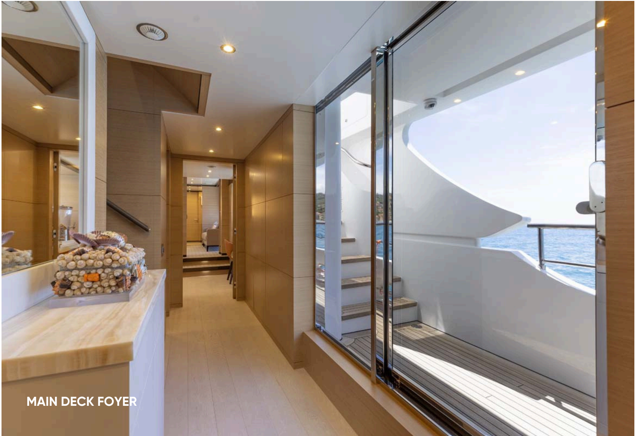
MAIN DECK FOYER