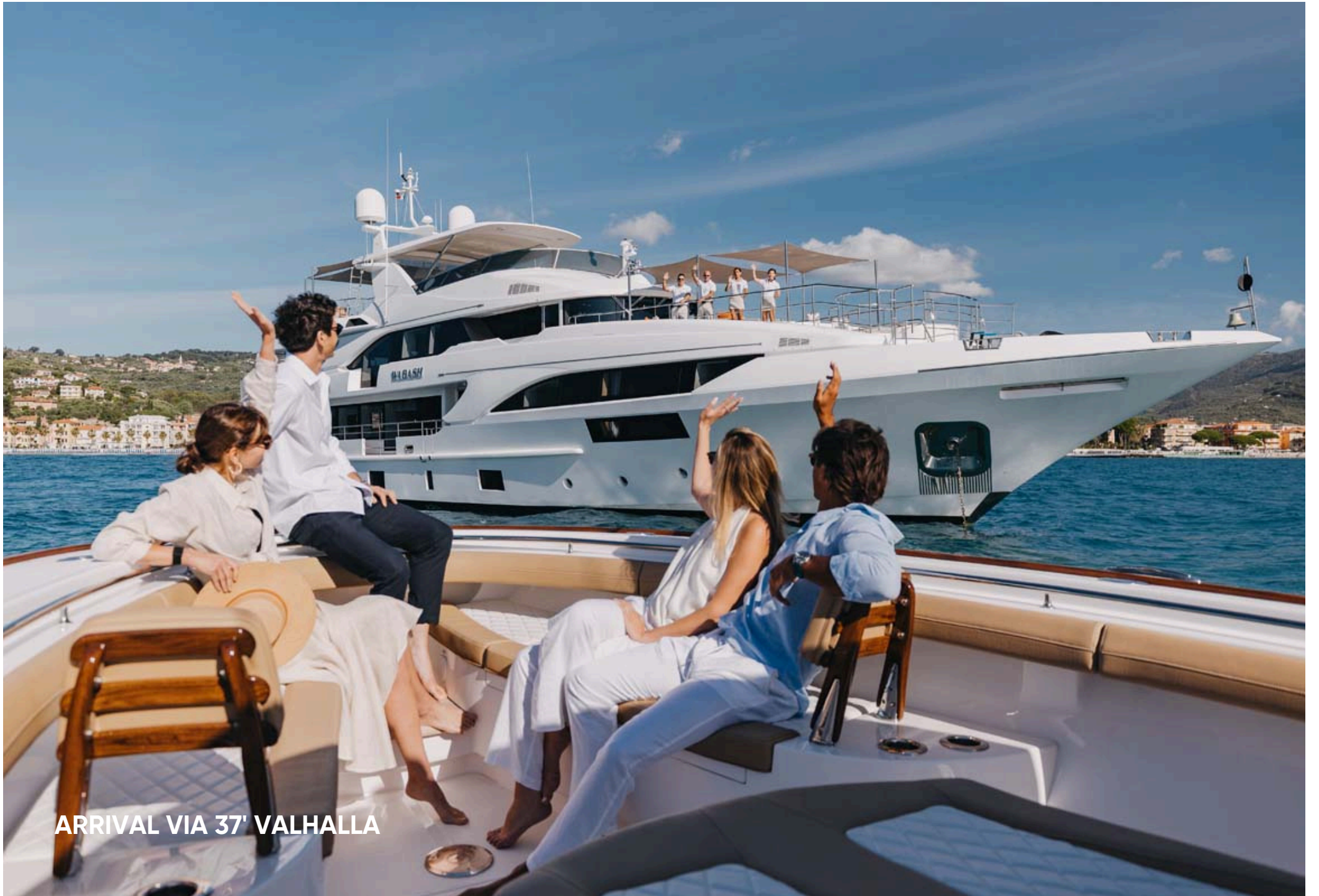
ARRIVAL VIA 37' VALHALLA