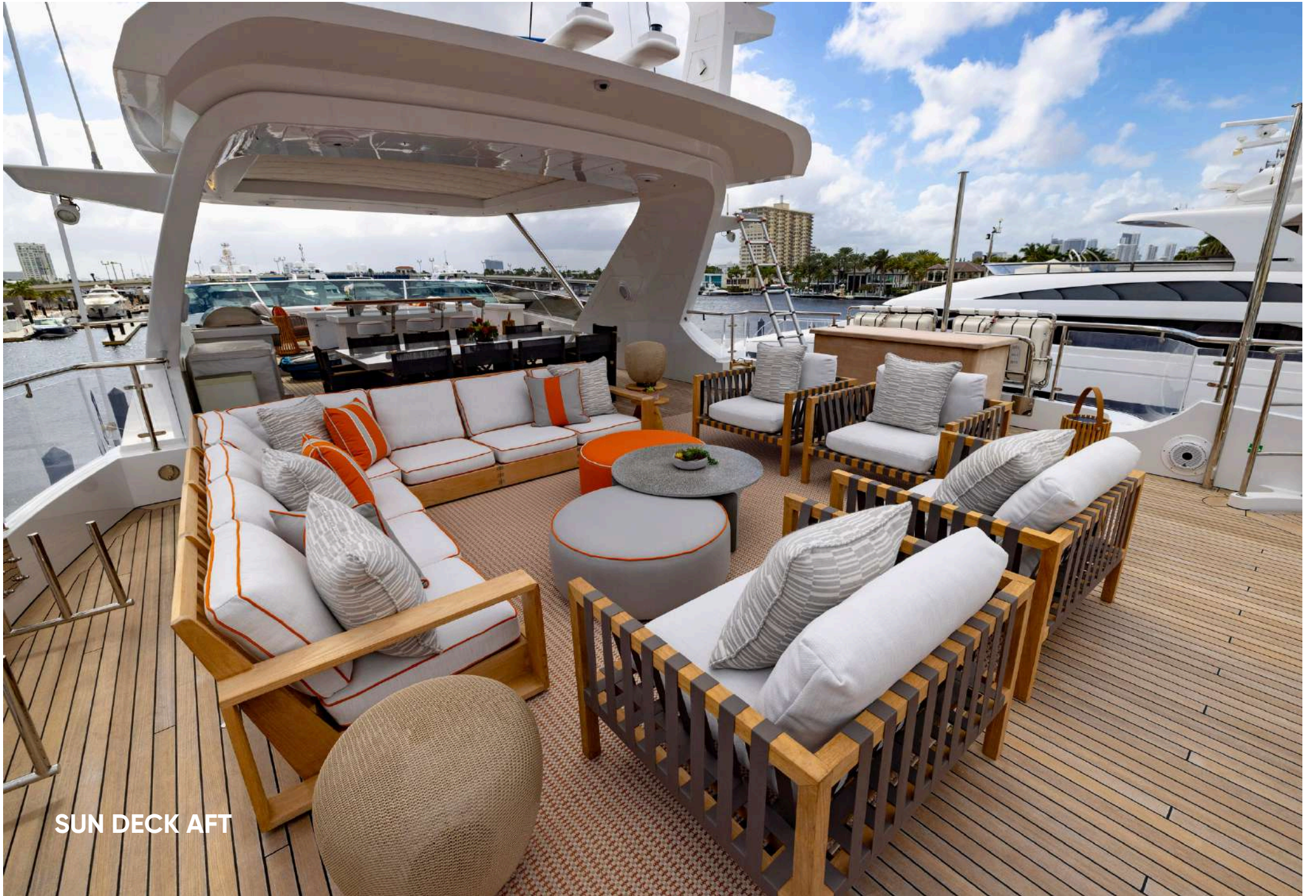
SUN DECK AFT